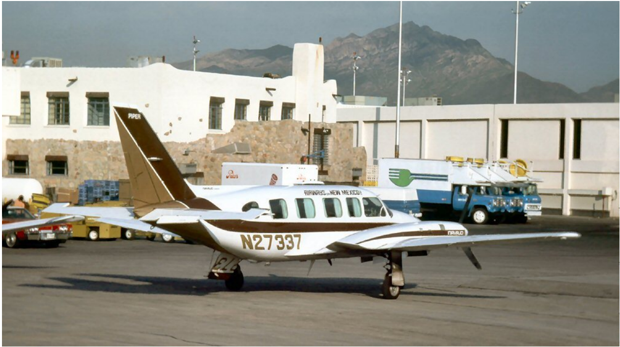
Airways of New Mexico Piper Navajo.