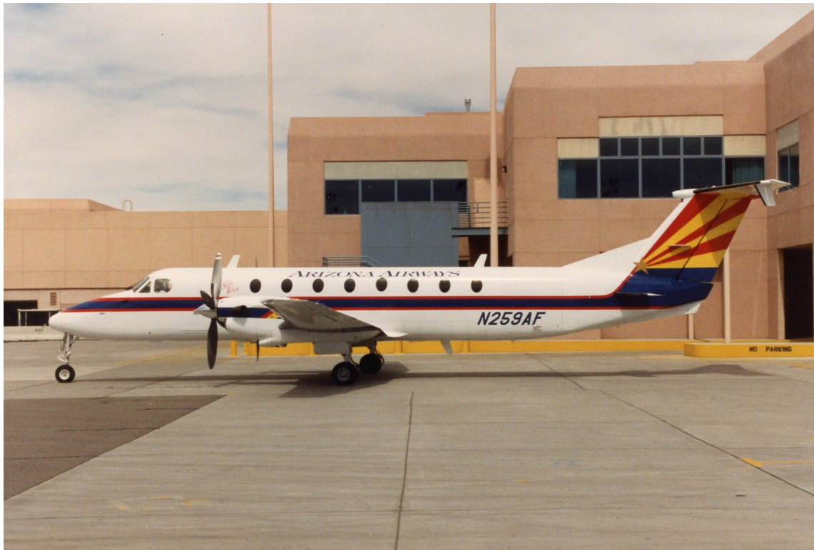
Arizona Airways Beech 1900C at the Albuquerque International Sunport.