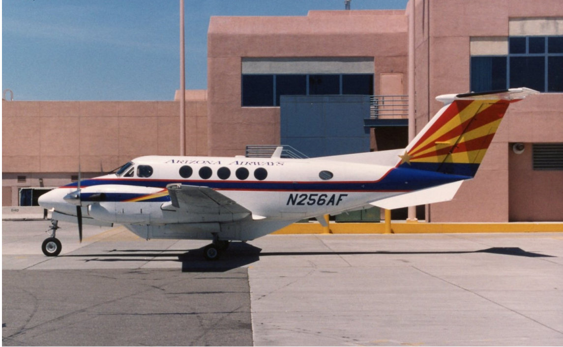
Arizona Airways Beech 1300 at the Albuquerque International Sunport.