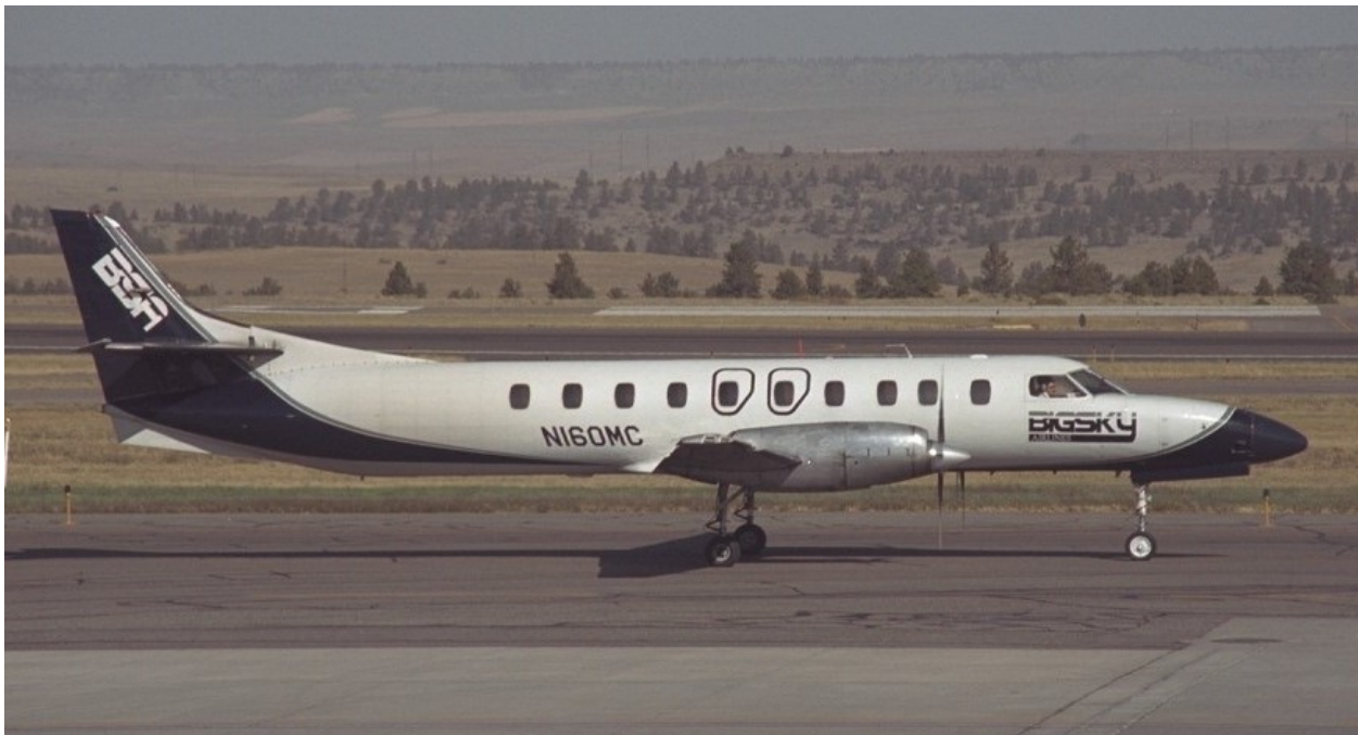
Big Sky Airlines Swearingen Metroliner III.

Big Sky Airlines was established in 1978 and headquartered in Billings, Montana. The carrier operated a hub at Billings offering commuter airline service to several cities in Montana, North Dakota, and Washington. Most cities were served under the Essential Air Service (EAS) program with government subsidy. Big Sky began another hub operation at Dallas/Fort Worth in 1998 by starting service on a number of routes that were vacated by Lone Star/Aspen Mountain Air when that carrier ceased operations. On October 21, 2000 Big Sky expanded into New Mexico with a DFW-Hobbs-Carlsbad-Roswell-Denver-Billings-Missoula route with one flight per day in each direction using Swearingen Metroliner aircraft. The leg from Roswell to Denver was discontinued three months later and the service was modified with two daily round-trips on a DFW-Carlsbad-Roswell route as well as a DFW-Brownwood, Texas-Hobbs route. The Carlsbad and Roswell flights were discontinued on March 26, 2001 while the Hobbs service continued through at least November, 2001. Big Sky ceased all operations in 2008.