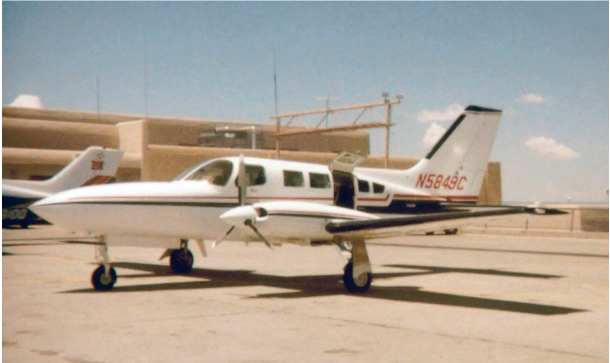
Crown Airlines Cessna 402 at the Albuquerque Sunport.