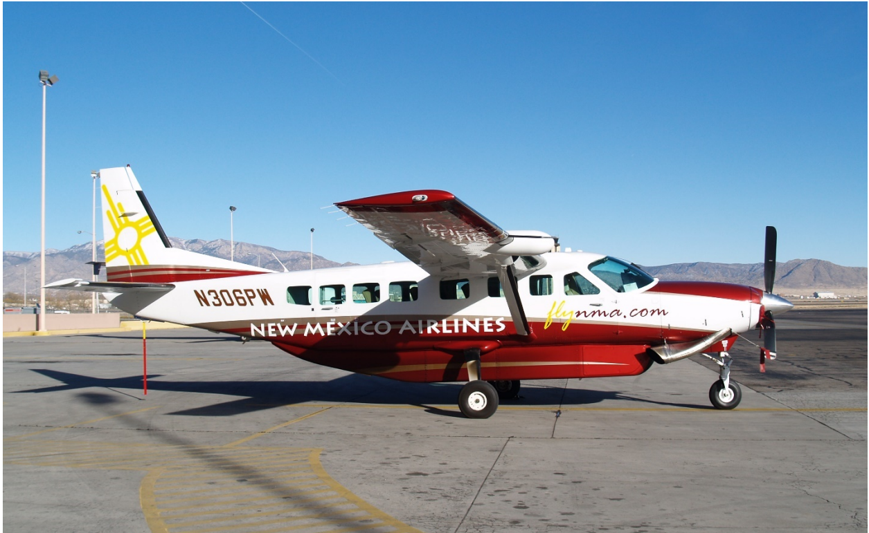
New Mexico Airlines Cessna 208B Grand Caravan at the Albuquerque International Sunport.