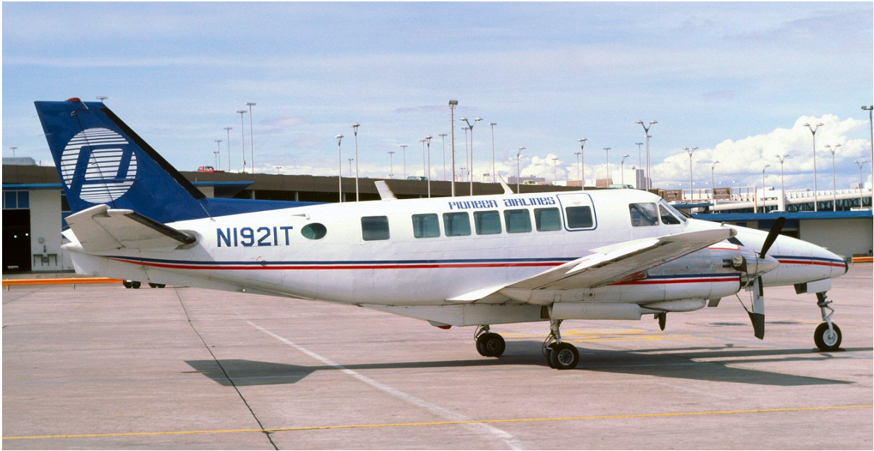
Pioneer Airlines Beechcraft 99.

callings to Farmington were short lived as all flights ended in August, 1983. The carrier continued to serve Santa Fe and went on to become a Continental Commuter feeder carrier on behalf of Continental Airlines at their Denver hub in October, 1983. The Santa Fe-Denver flights continued operating under the Continental brand through July, 1985, stopping in Alamosa, Colorado during the latter months. Pioneer ceased all operations in May, 1986 after losing its affiliation with Continental Airlines.