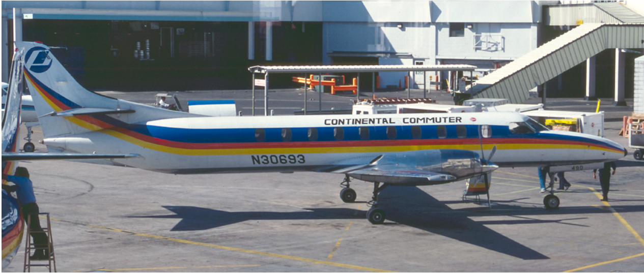
Pioneer Airlines Swearingen Metroliner with Continental Commuter titles.