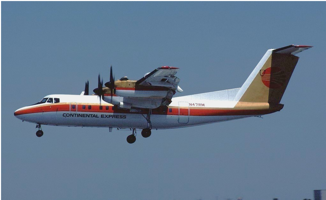
Continental Express DeHavilland Dash-7 operated by Rocky Mountain Airways.