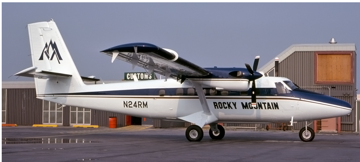
Rocky Mountain DeHavilland Twin Otter used as a freighter to Albuquerque in 1979.

Rocky Mountain Airways was established in 1963 as Vail Airways and created an operation throughout Colorado with its headquarters and a central hub at Denver. The name was changed to Rocky Mountain Airways in 1968. In 1979 the carrier operated a late night freighter flight from Denver to Albuquerque using a DeHavilland DHC-6 Twin Otter aircraft to transport the Wall Street Journal. In 1986 Rocky Mountain was purchased by Texas Air Corporation, parent company for Continental Airlines, and began operating as Continental Express feeding Continental Airlines at their Denver hub. Rocky Mountain began serving Farmington as Continental Express on May 1, 1990 with four daily flights to Denver using Beechcraft 1900C aircraft. One flight was later upgraded to an ATR-42 aircraft but made a stop in Durango on the way to Denver. Occasionally a DeHavilland DHC-7 Dash-7 aircraft was used as well. Rocky Mountain was merged with fellow Continental Express operator Britt Airways by early to mid-1991. Britt Airways later became ExpressJet.