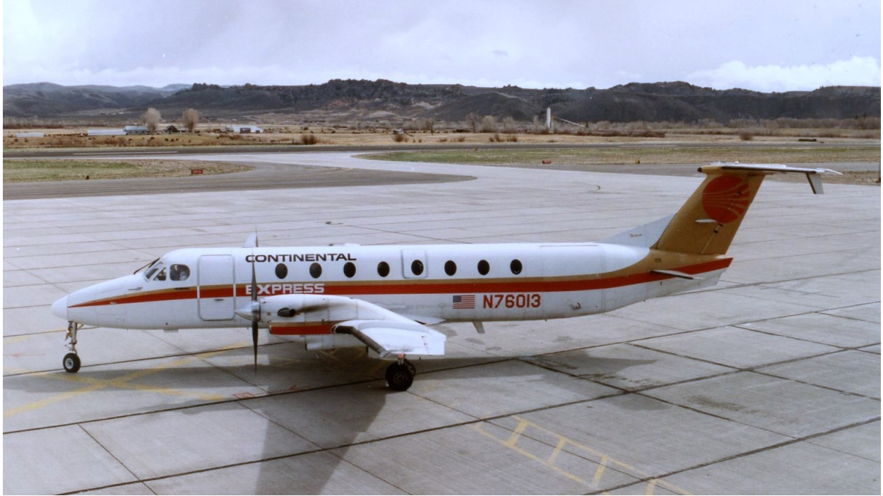
Continental Express Beechcraft 1900C operated by Rocky Mountain Airways.