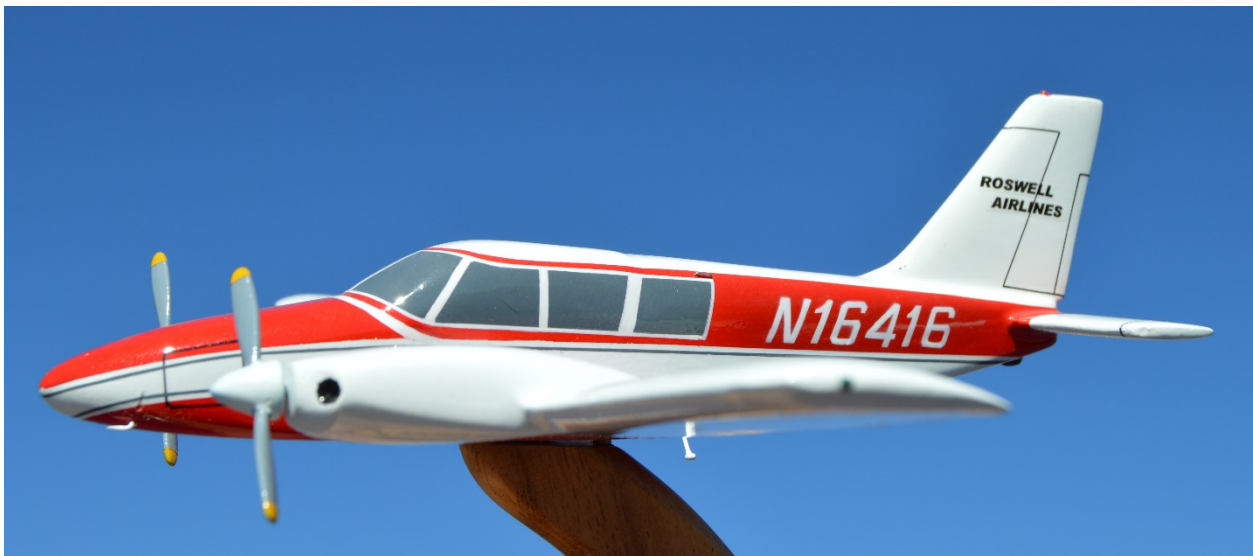
Model of a Roswell Airlines Piper Seneca aircraft.

Roswell Airlines was based in Roswell, New Mexico and provided commuter airline service on an Albuquerque-Ruidoso-Artesia-Roswell route beginning September 15, 1975. The stops at Ruidoso and Artesia were flag stops made upon passenger request. Flights on a Roswell-Artesia-Carlsbad-El Paso route and from Ruidoso to El Paso were added by July, 1977. The carrier had planned to serve Hobbs and Clovis, New Mexico but the service did not materialize. Roswell Airlines first used a Piper Seneca aircraft and obtained larger Piper Navajo Chieftain aircraft in late 1977. The carrier changed its name to New Mexico Air shortly before it ceased operations in mid-1978.