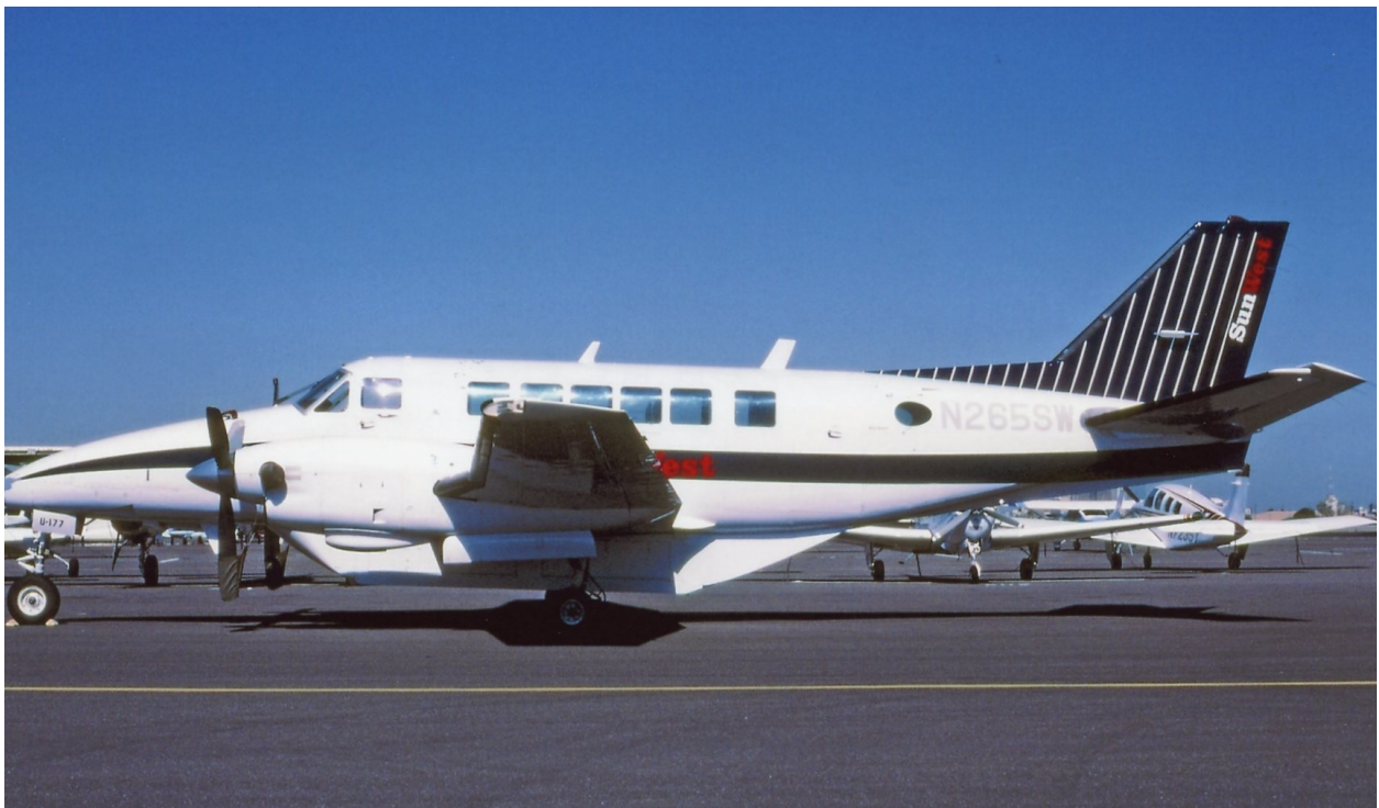
Sun West introduced the Beechcraft 99 along with a new livery in 1983.