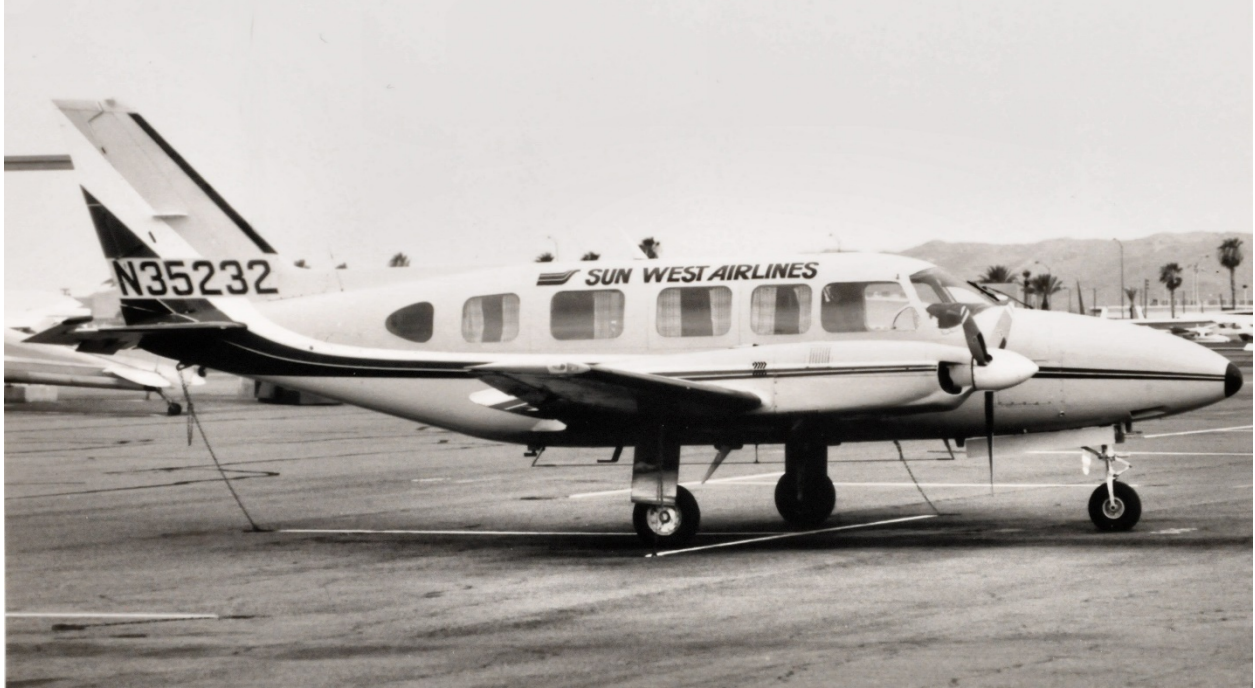
Sun West Airlines Piper Navajo.