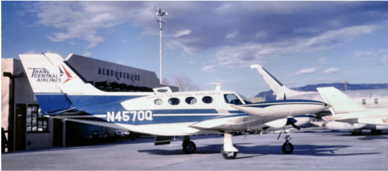
Trans Central Airlines Cessna 402 parked at the old terminal of the Albuquerque Sunport.