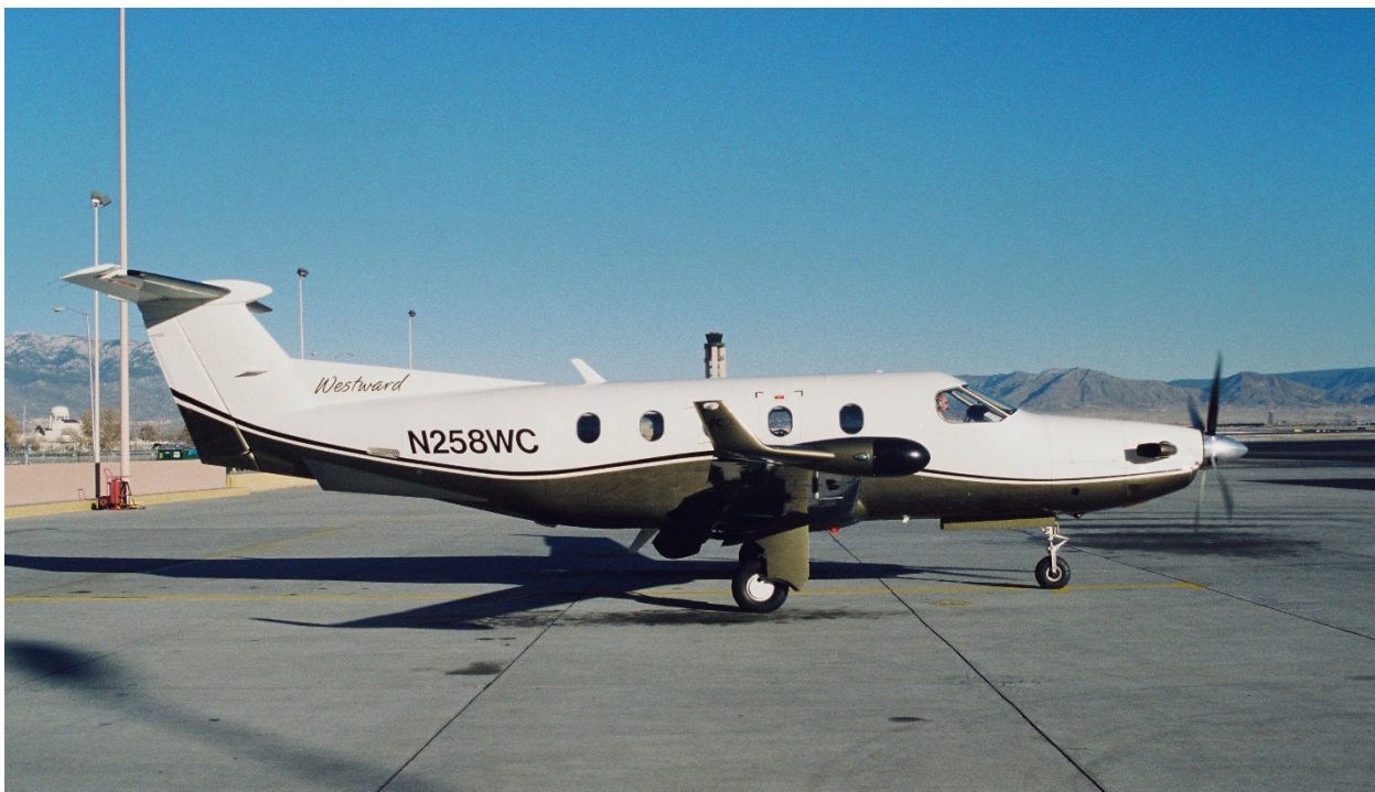
Westward Airways Pilatus PC-12 at Albuquerque.

Westward Airways was established in 2002 and based in Scottsbluff, Nebraska. The carrier started with flying "The River Route" serving cities along the Platte River in Nebraska. Westward began its New Mexico operation on November 30, 2004 using a single Pilatus PC-12 aircraft on routes from Albuquerque to Alamogordo, Las Cruces, and Taos. A second aircraft was added on April 5, 2005 with new service from Albuquerque to Gallup and Phoenix as well as from Las Cruces to Phoenix. All flights were halted in July, 2005 but as the route to Alamogordo was subsidized through an EAS contract, Westward was ordered to maintain service to that city. The Alamogordo flights were reinstated for a few more days however the carrier shut down again for good on July 25, 2005.