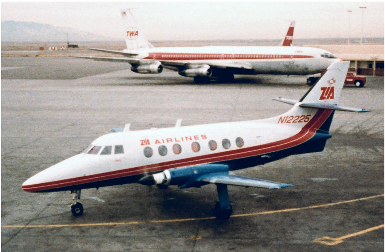
Zia Airlines Handley-Page Jetstream at Albuquerque.