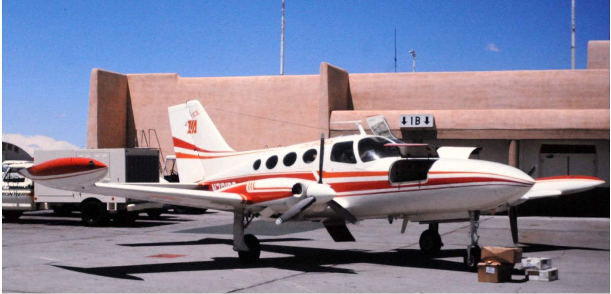
Zia Airlines Cessna 402 at the Albuquerque International Airport.