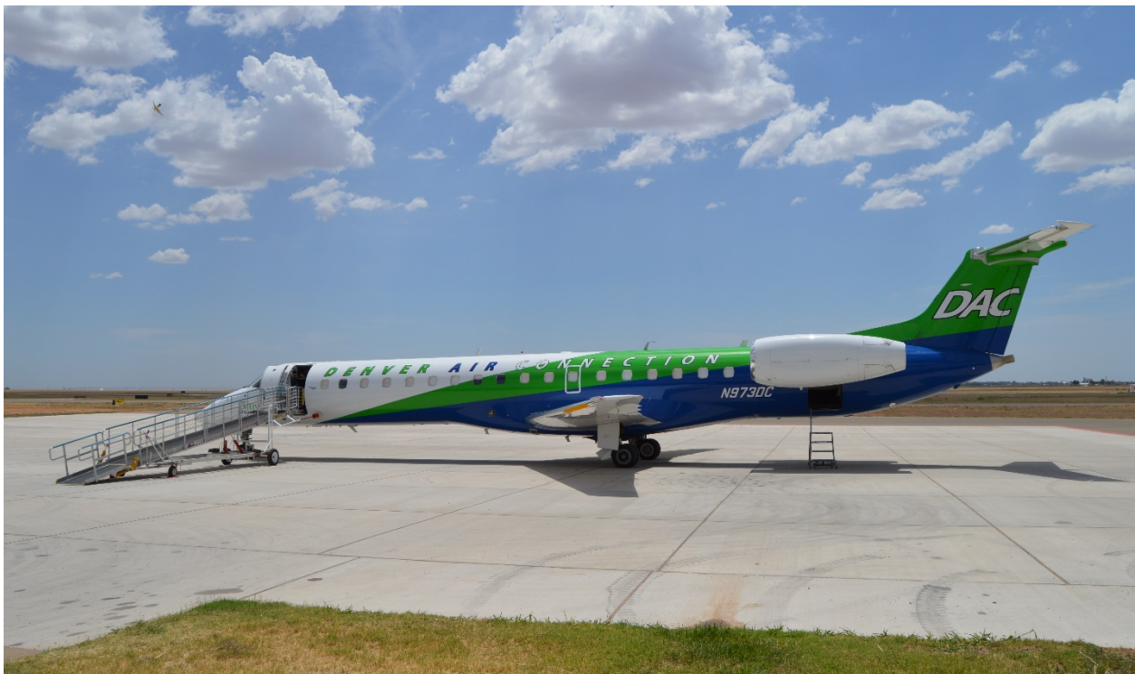
Denver Air Connection Embraer 145 regional jet at the Clovis Regional Airport in 2022.