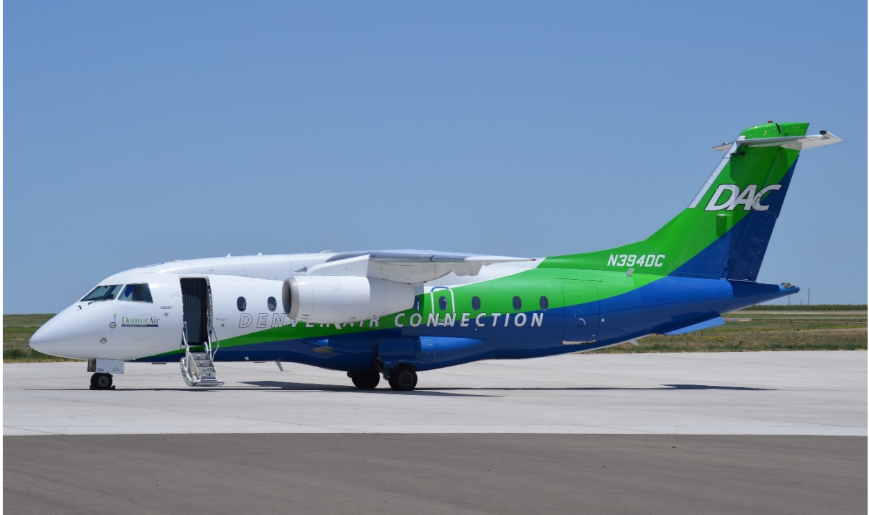
Denver Air Connection Fairchild Dornier 328Jet at the Clovis Regional Airport in 2020.