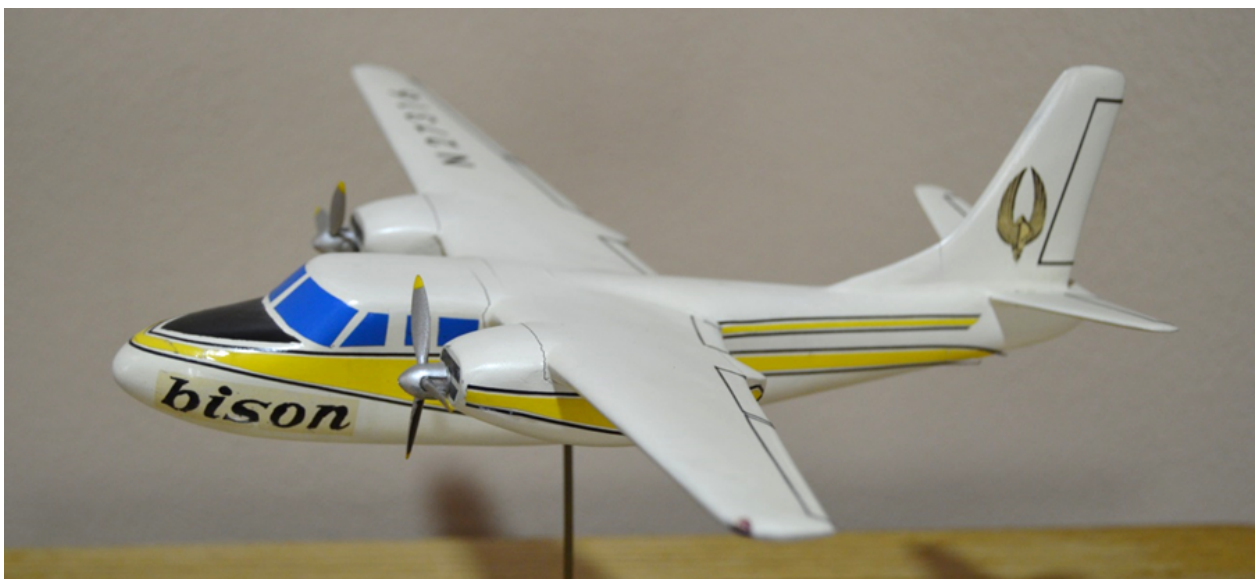
Model of a Bison Airlines Aero Commander from the Cavalcade of Wings display at the Albuquerque Sunport.

Bison Airlines was a commuter airline operating from March 18, 1963 through 1964. Bison was based in Roswell, New Mexico using Aero Commander 500 and De Havilland 104 Dove aircraft. In 1963 Bison operated the following routes: Santa Fe-Albuquerque-Roswell-Artesia-Carlsbad-Hobbs-Midland/Odessa, Las Cruces-El Paso-Carlsbad-Artesia-Roswell, and Roswell-Lubbock. At one point the carrier flew a Saturday only flight to Sunland Park, New Mexico. Bison had planned to serve many other New Mexico cities including Alamogordo, Deming, Silver City, Lordsburg, Clovis, Tucumcari, and Jal however it is unknown if flights to any of these cities ever commenced.