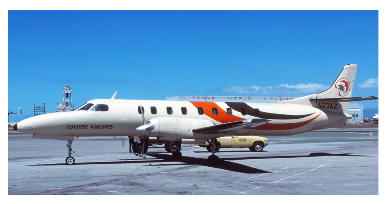
Cochise Airlines Swearingen Metroliner.

Cochise Airlines was based in Tucson, Arizona and started operations within the state of Arizona in September, 1971. On November 1, 1979 Cochise began a single daily flight from Gallup, New Mexico to Phoenix with stops at Winslow and Flagstaff, Arizona using a Swearingen Metroliner aircraft. By early 1980, Cochise had begun using a DeHavilland Twin Otter on the flight. Frontier Airlines had discontinued the Gallup-Phoenix route earlier in 1979 and another commuter carrier, Desert Airlines, also began the same route that year. Cochise left the Gallup market by mid-1980.