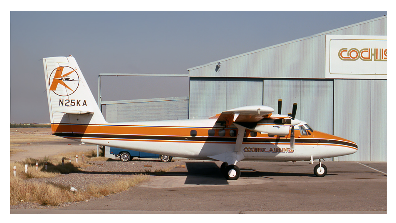
Cochise Airlines DeHavilland Twin Otter.