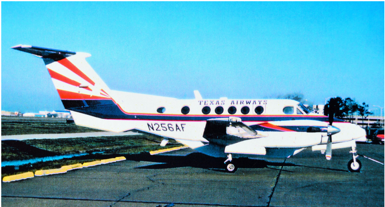
Texas Airways Beechcraft 1300.

Texas Airways provided service from Roswell to Abilene and Dallas/Fort Worth, Texas for a few weeks in June, 1995 using a Beechcraft 1300 aircraft. The carrier had stepped in when Mesa Airlines vacated the Roswell-Dallas/Fort Worth market.