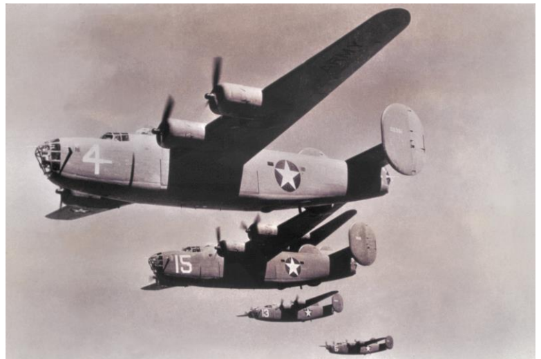
A group of the B-24's from the Kirtland school on a training flight.