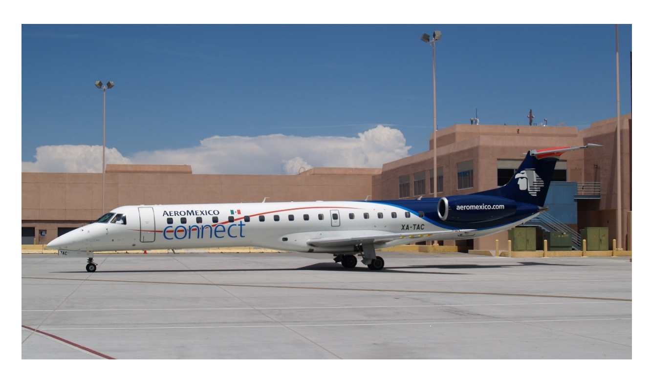
AeroMexico Connect Embraer-145, operated by AeroLitoral, at the Albuquerque Sunport in 2009.