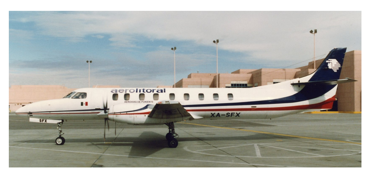
AeroLitoral Swearingen SA-227DC Metro 23 painted in the markings of AeroMexico at the Albuquerque Sunport in 1993.