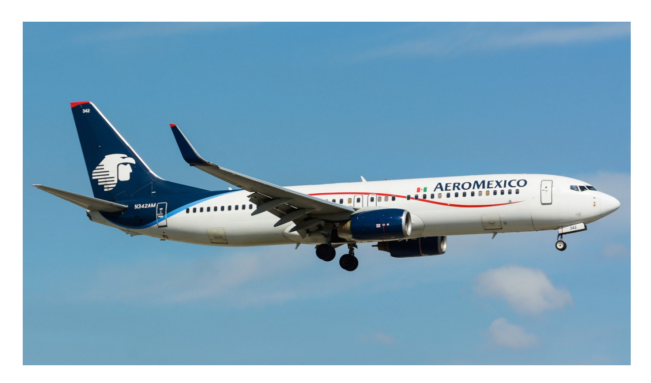
This AeroMexico Boeing 737-800 made an unscheduled landing at Albuquerque on July 10, 2022