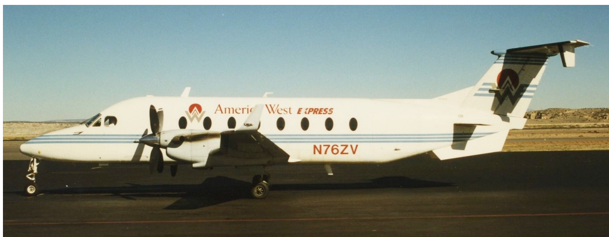
America West Express Beech 1900D operated by Mesa Airlines at the Farmington Four Corners Airport.

In late 1992 America West contracted with Mesa Airlines to initiate a feeder operation at Phoenix known as America West Express. Mesa's existing flights from Phoenix to Gallup and Farmington, New Mexico began operating as America West Express using 19-seat Beech 1900 aircraft as well as an occasionally 30-seat Embraer Brasilia. Service to Gallup ended in 1999 and new service from Phoenix to Santa Fe began in 2000 but ended one year later. A 37-seat Dash-8 aircraft was used on one Phoenix-Farmington flight for a brief time in 2001. America West Express service came to Albuquerque in 2002 with supplemental flights to Phoenix. Initially 50-seat Canadair CRJ-200 regional jets were used but larger 70 seat CRJ-700's and 86 seat CRJ-900's came within a year later. The larger regional jets were operated at first by Freedom Airlines, a subsidiary of the Mesa Air Group, but then blended in with Mesa Airlines by the end of 2003. Mesa also bought out Air Midwest, a competing commuter airline, in 2001 and all flights operating with Beech 1900 aircraft, including the Phoenix to Farmington and Santa Fe service, began operating under Air Midwest as America West Express. More information on Mesa, Air Midwest, and Freedom Airlines can be found in separate links for each carrier.