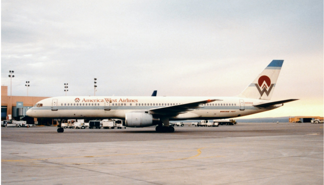
America West Boeing 757's served Albuquerque from 1996 through 2001.