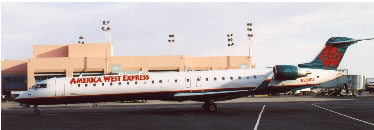
America West Express Canadair CRJ-900 operated by Freedom Airlines at the Albuquerque Sunport.