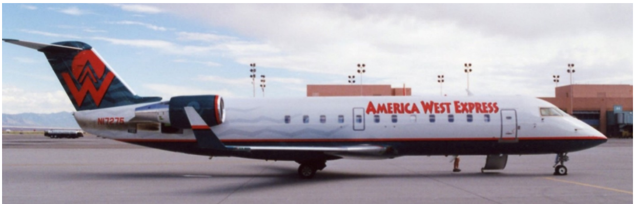
America West Express Canadair CRJ-200 operated by Mesa Airlines at the Albuquerque Sunport.