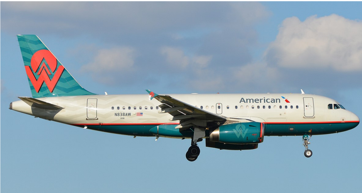
Another former America West Airbus A319 now flies for American Airlines in a retro livery commemorating America West.