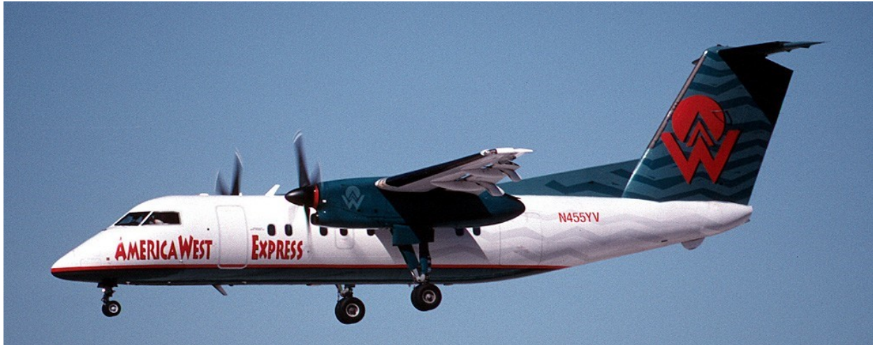
America West Express De Havilland Dash-8 operated by Mesa Airlines served Farmington in 2001.