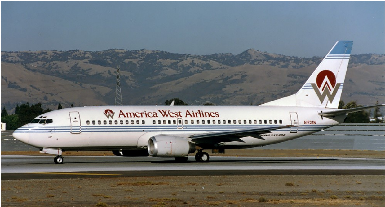
America West Boeing 737-300 introduced in 1985.