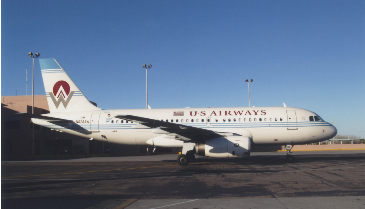
A former America West Airbus A319 flew with U-S Airways from 2007 through 2015 in a retro livery commemorating America West.