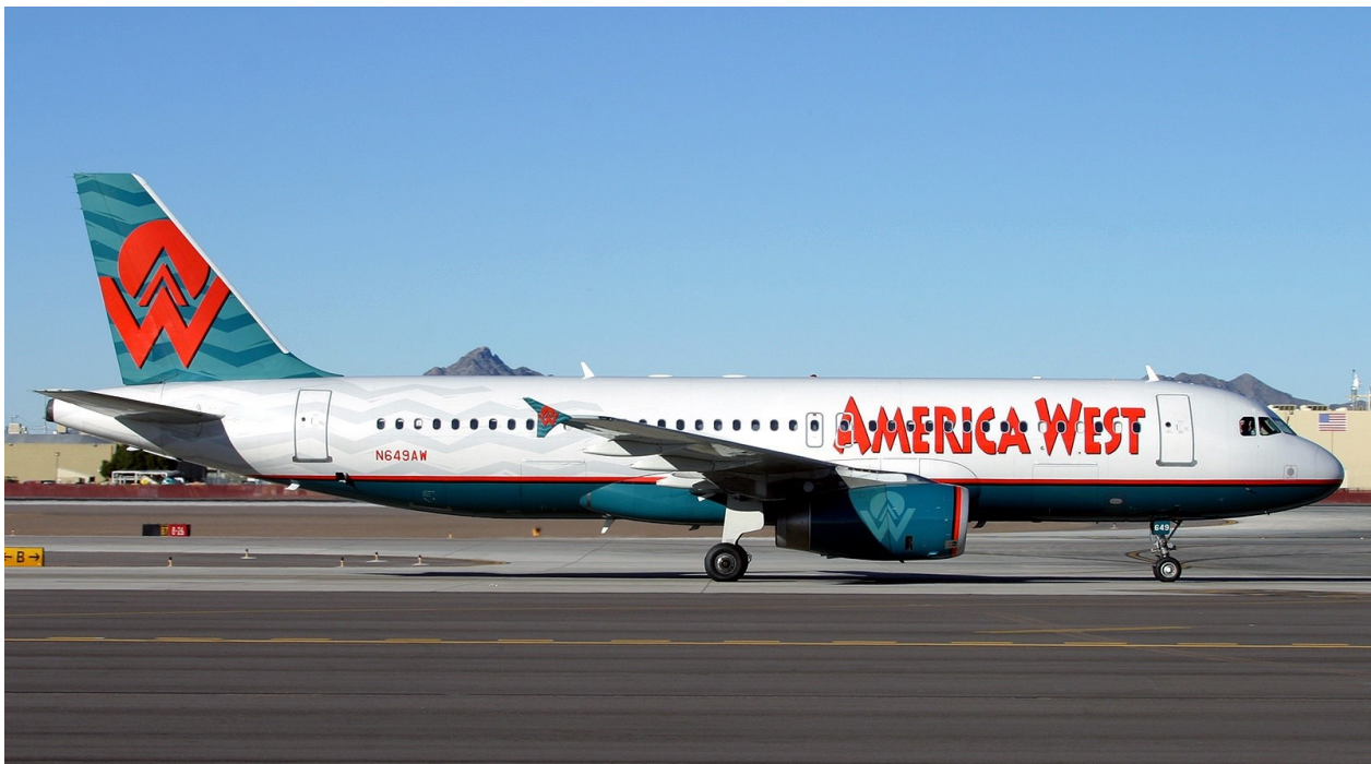
America West Airbus A320 in a new livery introduced in 1996.