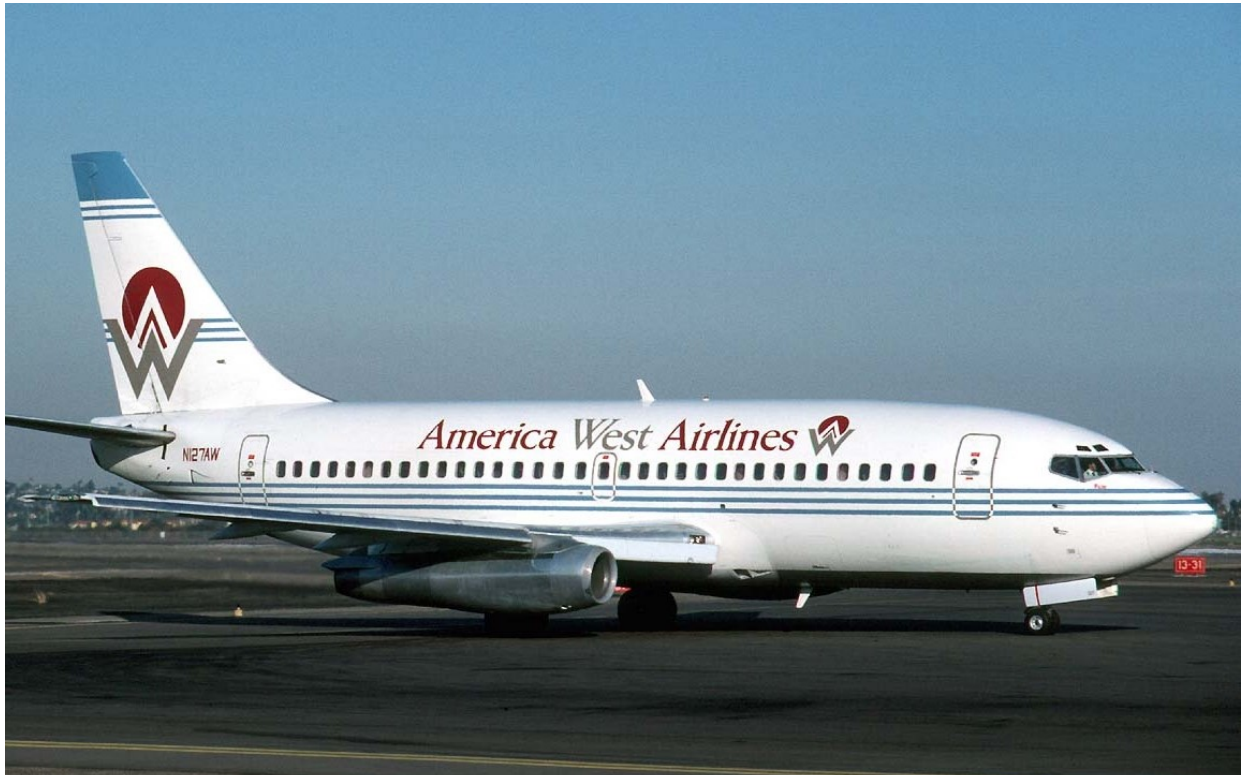
America West Boeing 737-200.