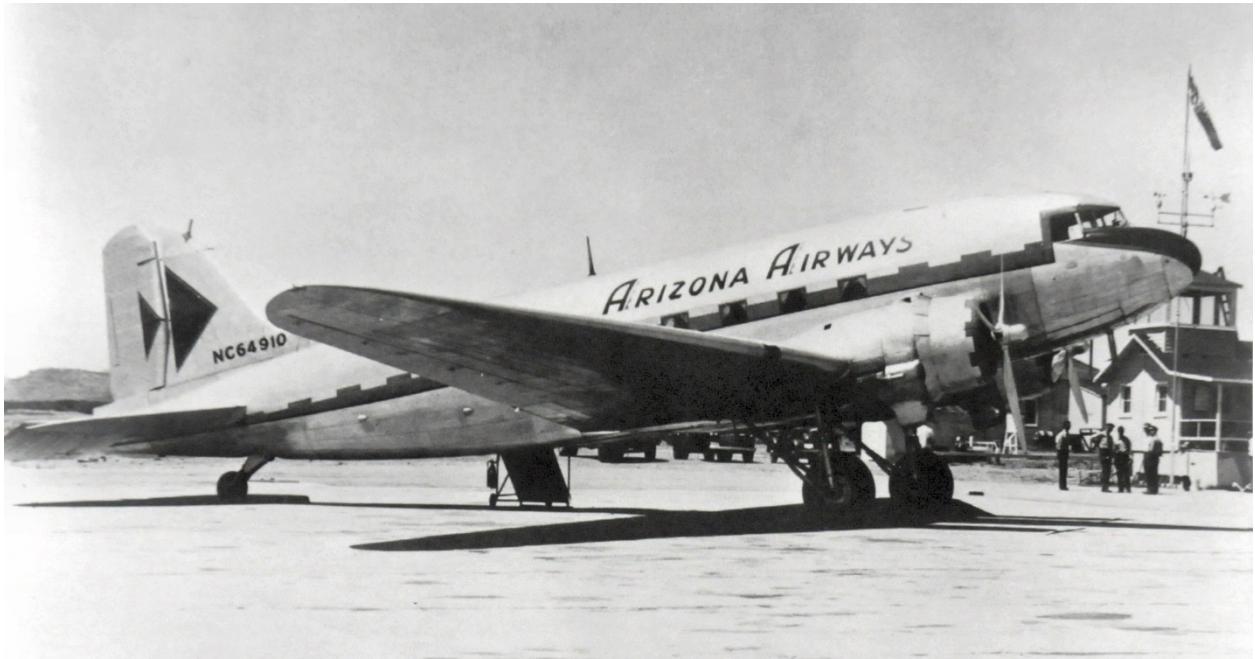
Arizona Airways Douglas DC-3.