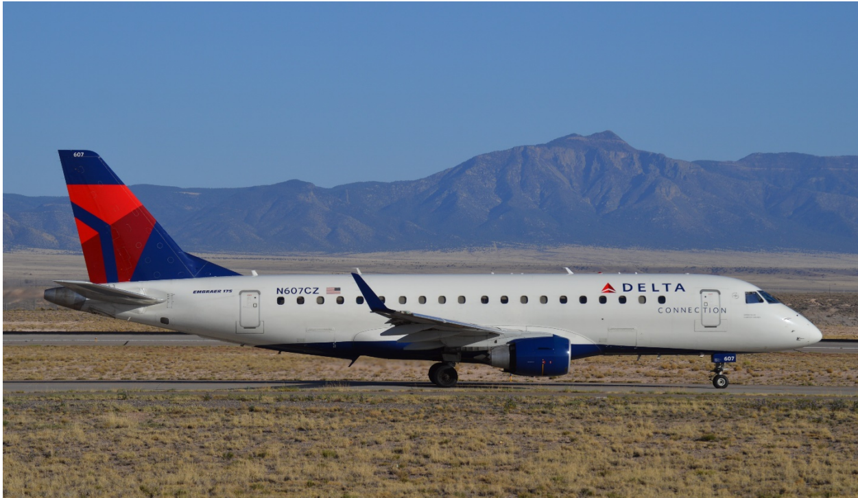
Compass Airlines Embraer 175 at Albuquerque operating as Delta Connection.