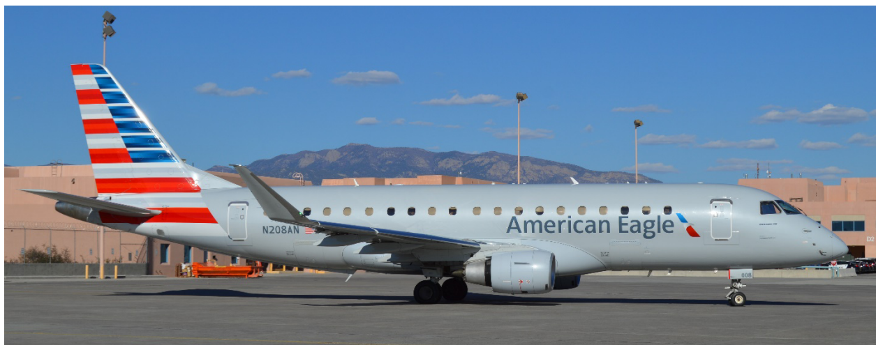
Compass Airlines Embraer 175 at Albuquerque operating as American Eagle.

Compass began Delta Connection flights at Albuquerque on October 2, 2017 with service to Salt Lake City also using the Embraer-175's. This operation was originally planned to start in early 2016. One month later on November 5, 2017, Compass replaced SkyWest Airlines on the Albuquerque-Los Angeles route. The carrier was then operating to Los Angeles under both the American Eagle and Delta Connection banners. Compass closed its doors on April 7, 2020 with its last departure from Albuquerque as Delta Connection on March 16, 2020 and as American Eagle on April 3, 2020, shortly after the beginning of the Covid-19 pandemic.