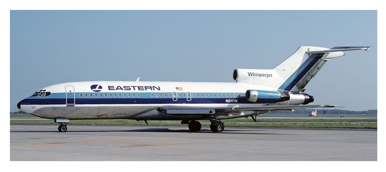
Eastern Air Lines Boeing 727-100.