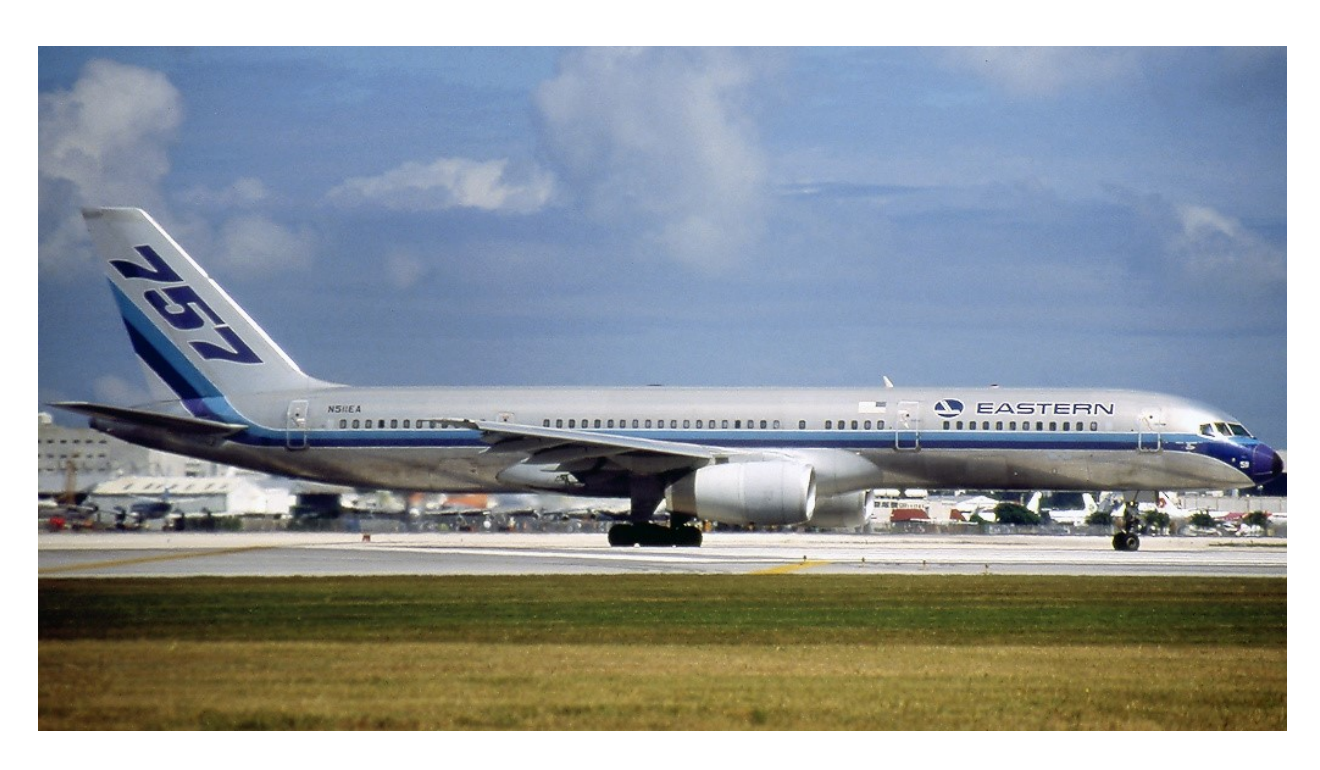
Eastern Air Lines Boeing 757-200 introduced in 1983.