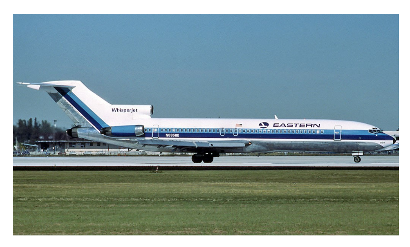
Eastern Air Lines Boeing 727-200.