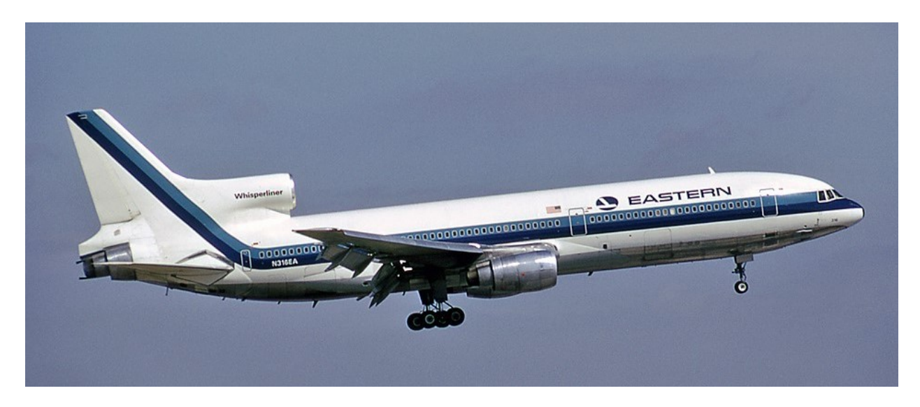
Eastern Air Lines Lockheed L-1011 Tristar.

In 1974, prior to serving Albuquerque, Eastern performed an aircraft swap with TWA in which TWA operated an Eastern widebody Lockheed L-1011 during their busier summer months and Eastern operated a TWA L-1011 during their busier winter season. TWA flew an L-1011 on one flight from Albuquerque to Chicago during the summer of 1974 and an Eastern L-1011 was occasionally used.