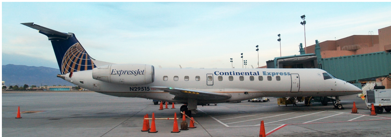
Continental Express Embraer 135 operated by ExpressJet at Albuquerque.

ExpressJet returned to New Mexico on January 7, 2003 serving Albuquerque with Continental Express flights to Houston using 37-seat Embraer 135 and 50-seat Embraer 145 regional jets. A weekly flight to Cleveland, Ohio was operated from 2005 through 2009 on a seasonal basis. Service to Hobbs, New Mexico began on July 1, 2011 with two daily flights to Houston using the Embraer 135's and 145s. Continental merged with United Airlines on April 1, 2012 and all ExpressJet flights at Albuquerque and Hobbs were switched to operate as United Express. The carrier later added flights from Albuquerque to Denver and began service from Santa Fe to Denver on May 1, 2013 also using Embraer 145's. United Airlines frequently changes its schedules using different United Express carriers on many of its routes at any given time and, as a result, United Express flights operated by ExpressJet typically saw interruptions in its service at Albuquerque. Flights to Hobbs had been consistently operated by ExpressJet since they started in 2011 however all service to Hobbs was changed to SkyWest on October 27, 2019. Some flights reverted back to ExpressJet on the Hobbs-Houston route in early 2020 but ended again on September 14, 2020, replaced by SkyWest. The Santa Fe-Denver service was switched to Trans States Airlines in mid-2015. ExpressJet introduced the larger Embraer 175 on United Express flights at Albuquerque in 2019 before ending their Albuquerque service on August 2, 2020.