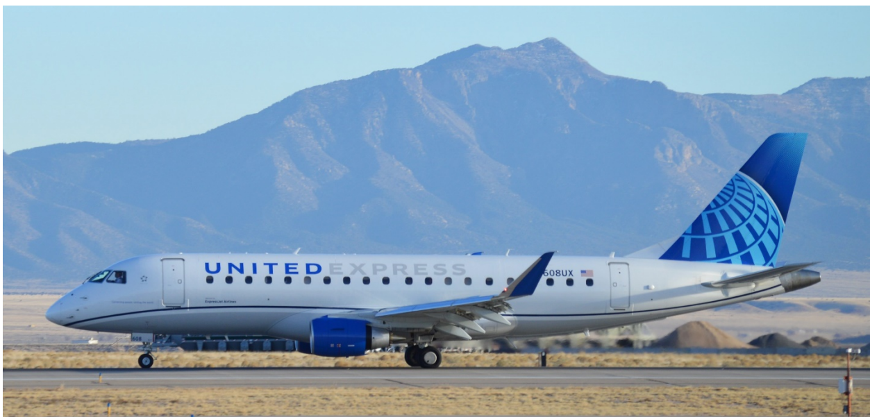
United Express Embraer 175 operated by ExpressJet in United's latest livery at Albuquerque.