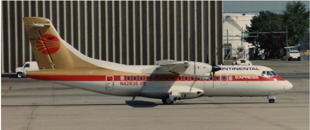
Continental Express Aerospaciale ATR-42.