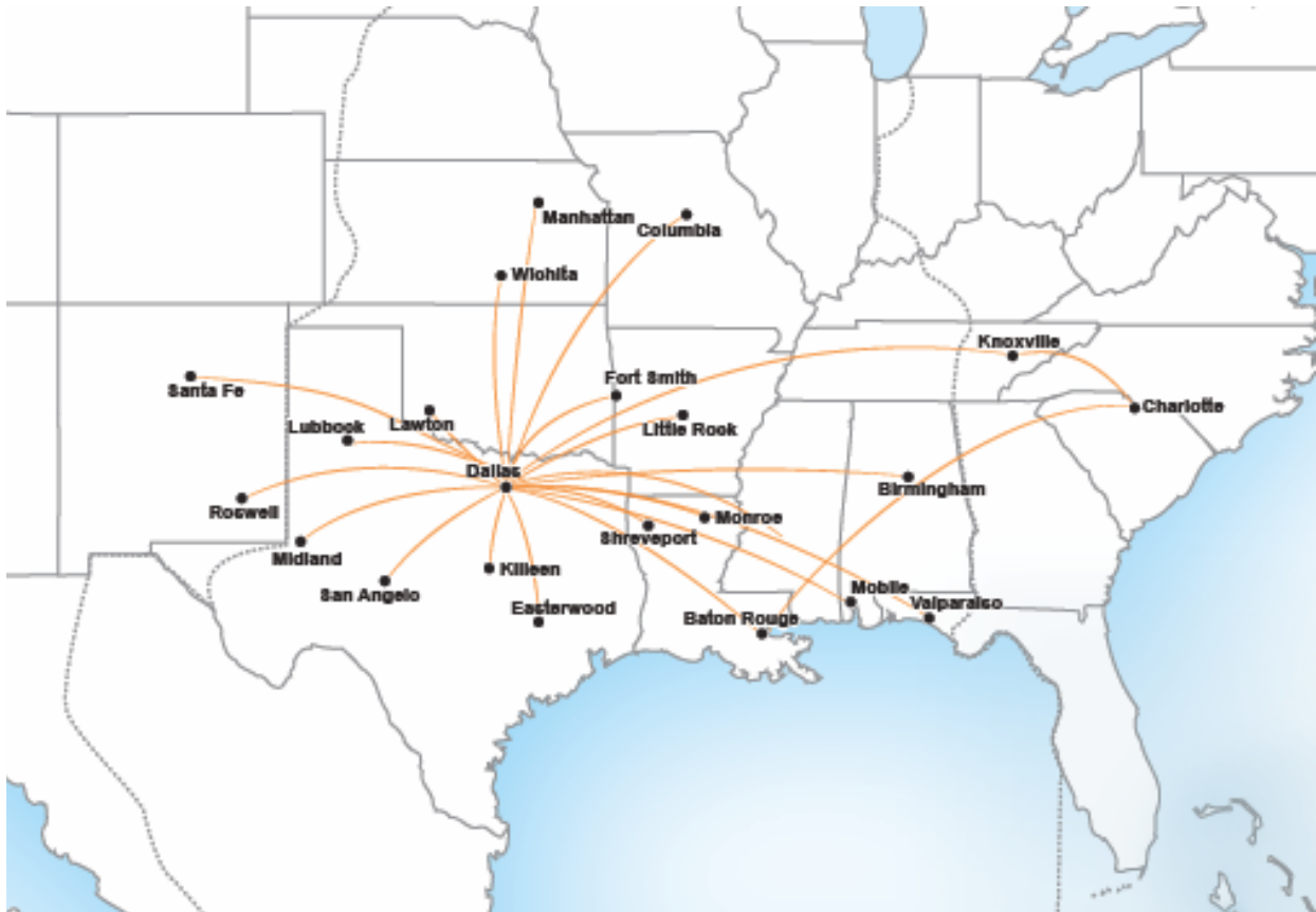
ExpressJet/American Eagle route map from December, 2017.