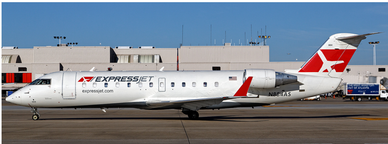
ExpressJet Canadair CRJ-200 in the companies' final house colors.

Some ExpressJet CRJ-200 aircraft were painted in the company's new livery introduced in the mid-2010's so they could be used for either American Eagle or United Express flights as needed.