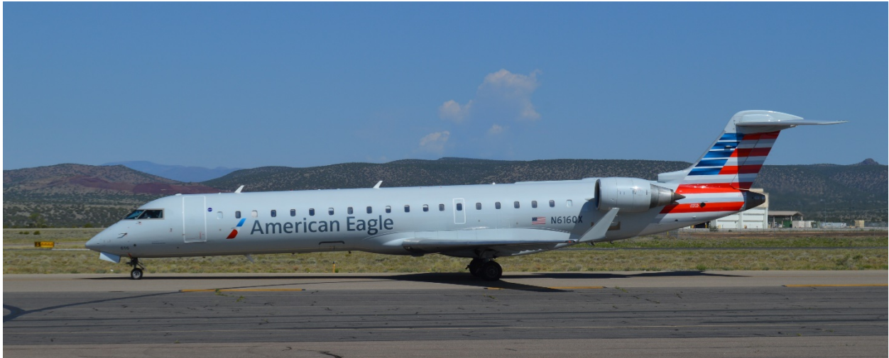
American Eagle Canadair CRJ-700 operated by ExpressJet at Santa Fe in 2017. American Airlines introduced their latest livery in 2013.