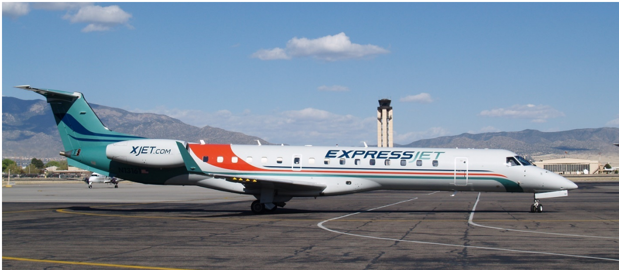
ExpressJet Embraer 145XR at the Albuquerque Sunport flying its independent flights.

In 2005 Continental Airlines elected to contract with other carriers under the Continental Express brand and greatly reduced contract flying by ExpressJet. This action freed up a number of aircraft which prompted the carrier not only to begin new alliances with Delta and American but also to create its' own independent airline and use its 50-seat Embraer 145 regional jets. Their goal was to service point to point routes where no other carriers were operating. ExpressJet began its new services on April 16, 2007 with nonstop flights from Albuquerque to Austin and San Antonio, Texas, Oklahoma City and Tulsa, Oklahoma, and to Ontario and Sacramento, California. ExpressJet was soon faced with an economic recession in the United States along with steeply rising fuel prices causing the carrier to abandon its independent operations. All independent flights at Albuquerque were discontinued by August 30, 2008 however the company continued to perform their flying as Continental Express. For about two weeks in November of 2007, ExpressJet also operated flights from Albuquerque to Denver on behalf of Frontier Airlines while Frontier was transitioning between feeder carriers.