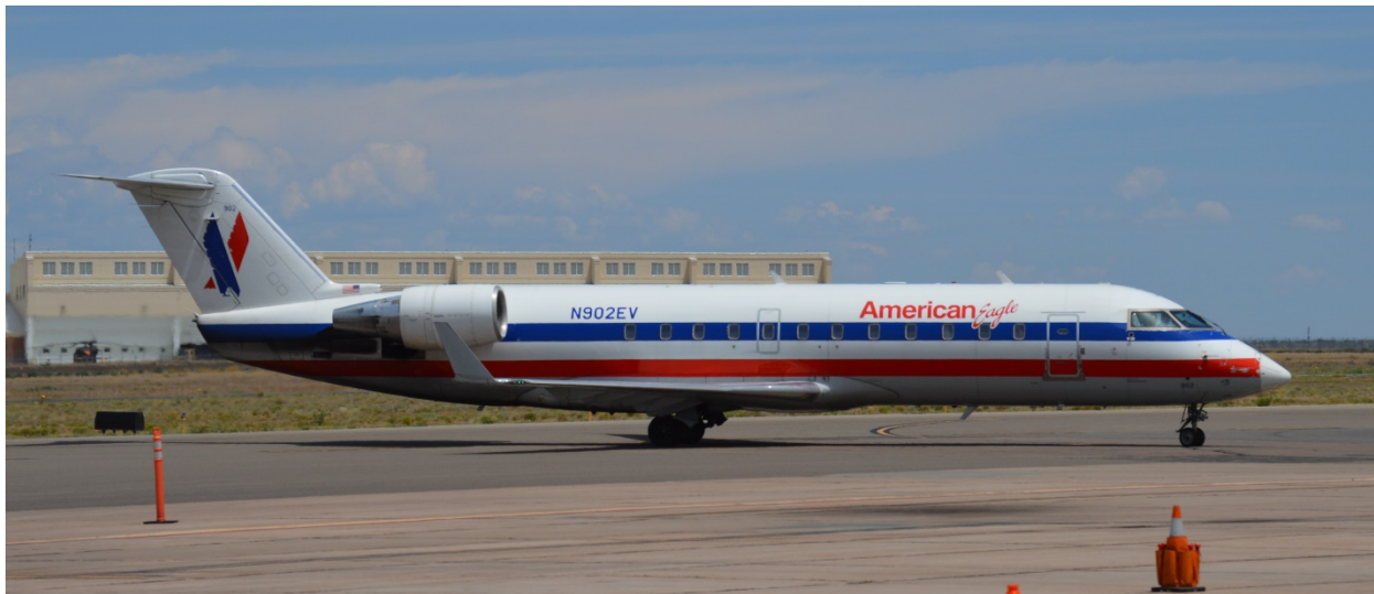
American Eagle Canadair CRJ-200 operated by ExpressJet at Santa Fe in 2016.

In 2012 ExpressJet added a new affiliation with American Airlines becoming an American Eagle operator. Service began with flights from Santa Fe to Dallas/Fort Worth in early 2015 followed by flights from Roswell to DFW later that year. Both routes supplemented Envoy Airlines, another American Eagle operator, and began with CRJ-200 regional jets acquired when ExpressJet was merged with ASA. Additional Embraer-145 regional jets were obtained from Envoy Air and added on both New Mexico routes in 2016. ExpressJet took over all American Eagle service at Santa Fe later in 2016 and upgraded all three DFW flights to 65-seat Canadair CRJ-700 regional jets in early 2017. Two of three flights from DFW to Roswell were also upgraded with CRJ-700 jets beginning in April, 2017. All American Eagle service to Roswell and Santa Fe operated by ExpressJet was replaced by parent company SkyWest Airlines by the end of 2018. ExpressJet then ended all flying as American Eagle in 2019.