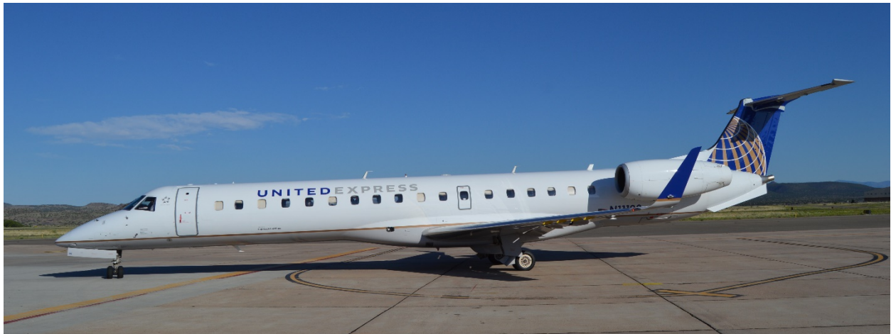
United Express Embraer 145XR (extended range) operated by ExpressJet at Santa Fe.