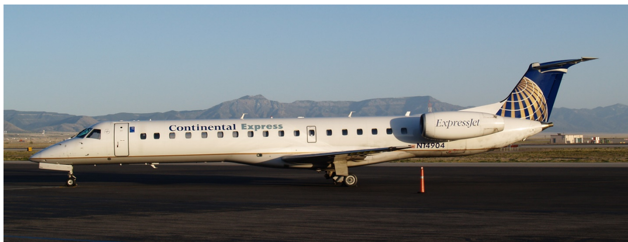
Continental Express Embraer 145 operated by ExpressJet at Albuquerque.