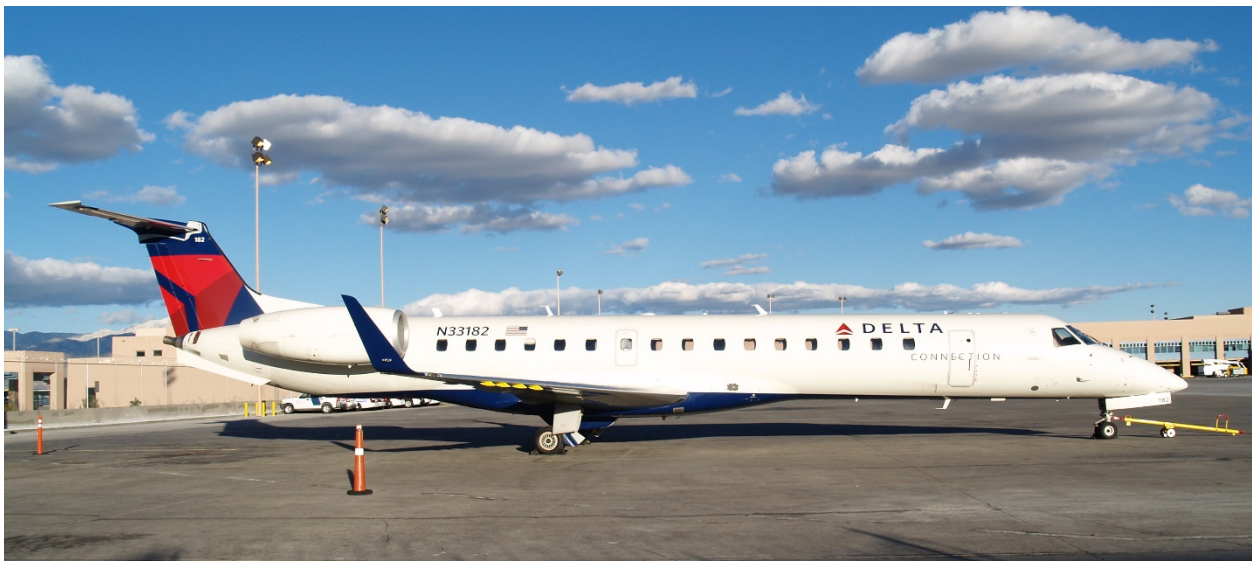
Delta Connection Embraer 145XR operated by ExpressJet at Albuquerque in 2008.

ExpressJet supplemented Delta Air Lines as a Delta Connection affiliate by operating flights from Albuquerque to Salt Lake City for a brief seven months in 2008, also using the Embraer 145 regional jets. Delta Connection service to Santa Fe, New Mexico was due to commence in December, 2007 with flights to Los Angeles and Salt Lake City however this service was delayed due to environmental concern issues at the Santa Fe airport. With the downslide of the economy and skyrocketing fuel prices at the time, this service never began. Atlantic Southeast Airlines (ASA) had also served Albuquerque with flights to Salt Lake City under the Delta Connection banner briefly during the fall of 2005. ASA was merged into ExpressJet in 2011.