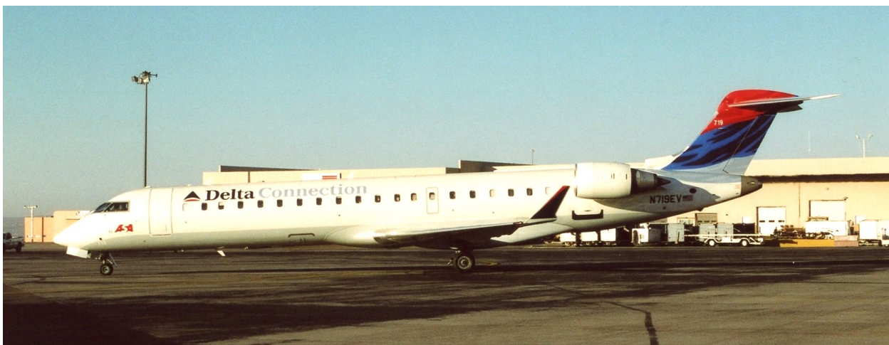
Delta Connection Canadair CRJ-700 at Albuquerque operated by Atlantic Southeast Airlines in 2005.

Atlantic Southeast Airlines, ASA, was founded in 1979 and based in Atlanta, Georgia. The carrier became Delta Connection on behalf of Delta Air Lines in 1984 and was the primary feeder for Delta at the carrier's hubs in Atlanta and Dallas/Fort Worth. ASA was bought out by SkyWest Airlines, another Delta Connection affiliate, in 2005 but continued to operate separately however some of its Delta Connection flights began operating at Delta's Salt Lake City hub alongside with SkyWest. ASA briefly served Albuquerque under the Delta Connection banner during the fall of 2005 with Canadair CRJ-700 flights to Salt Lake City supplementing SkyWest Airlines at the time. ASA was merged into ExpressJet in 2011 and continued operating separately from SkyWest.