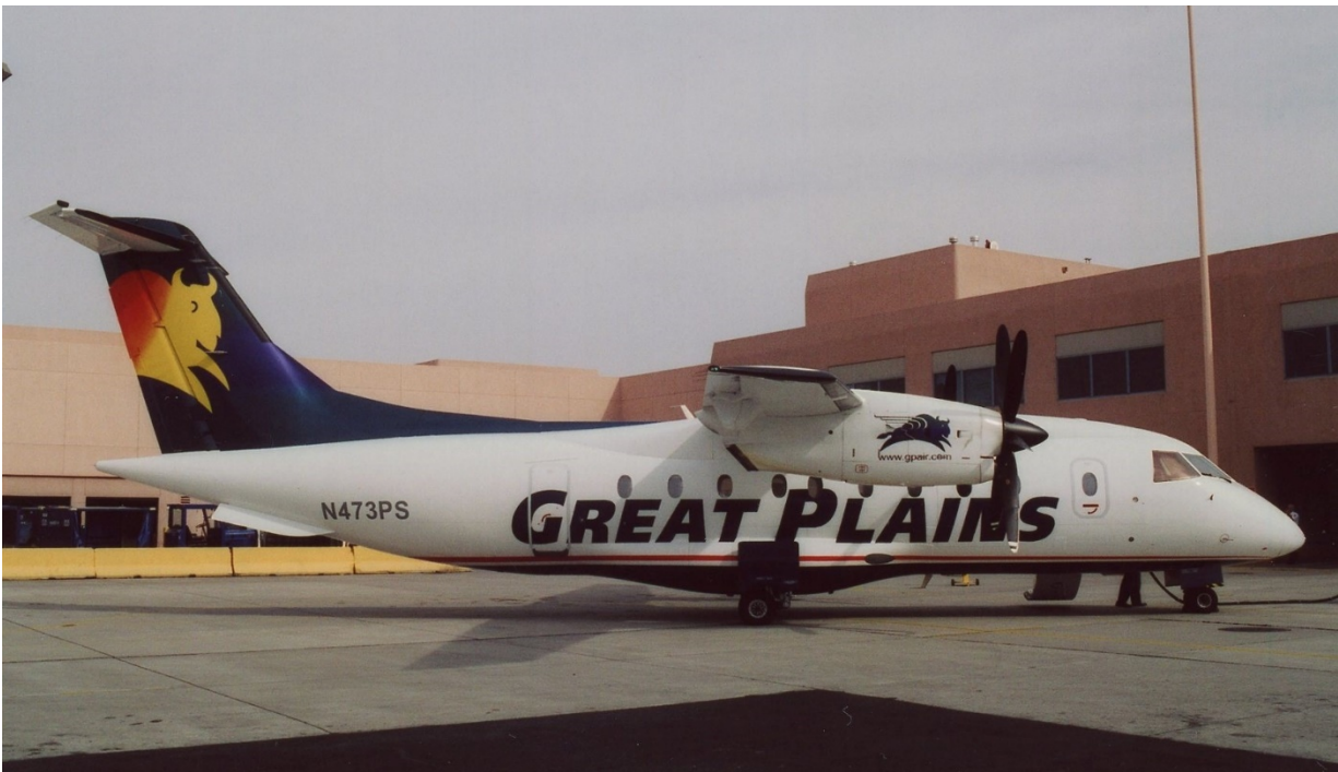
Great Plains Dornier 328 prop at the Albuquerque Sunport.