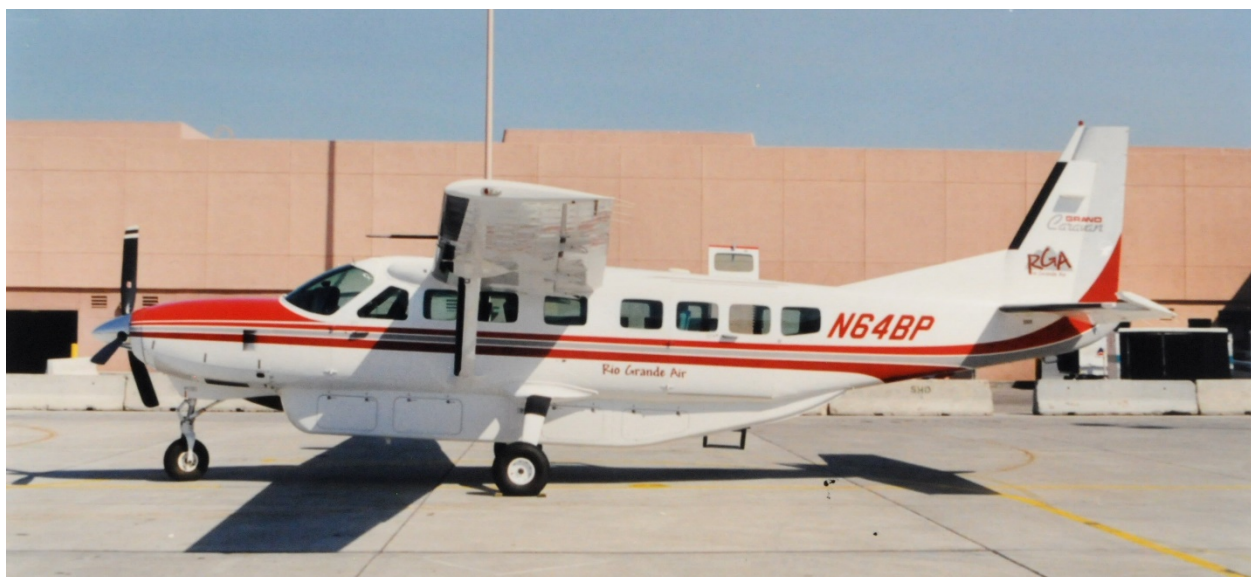
Rio Grande Air Cessna 208 Caravan at the Albuquerque Sunport.