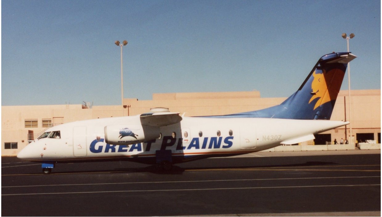
Great Plains Fairchild Dornier 328 Jet at the Albuquerque Sunport.