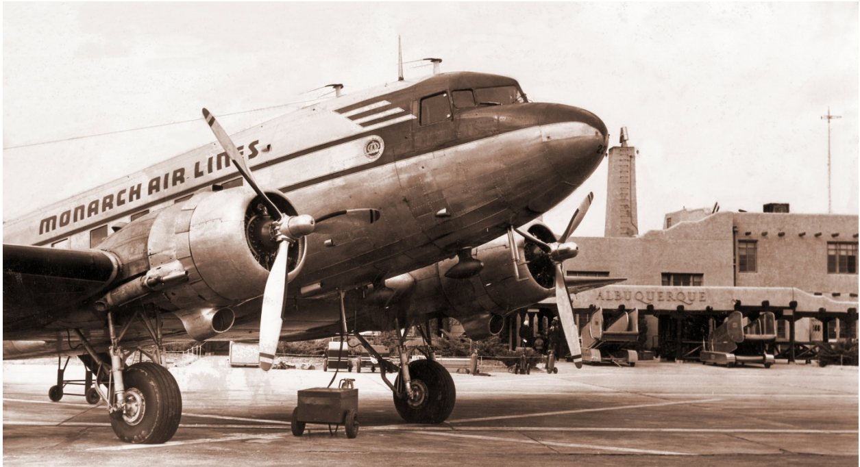
Monarch Air Lines Douglas DC-3 at the Albuquerque Municipal Airport in the late 1940's.