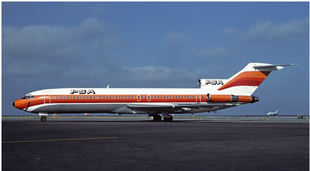
PSA Boeing 727-200.