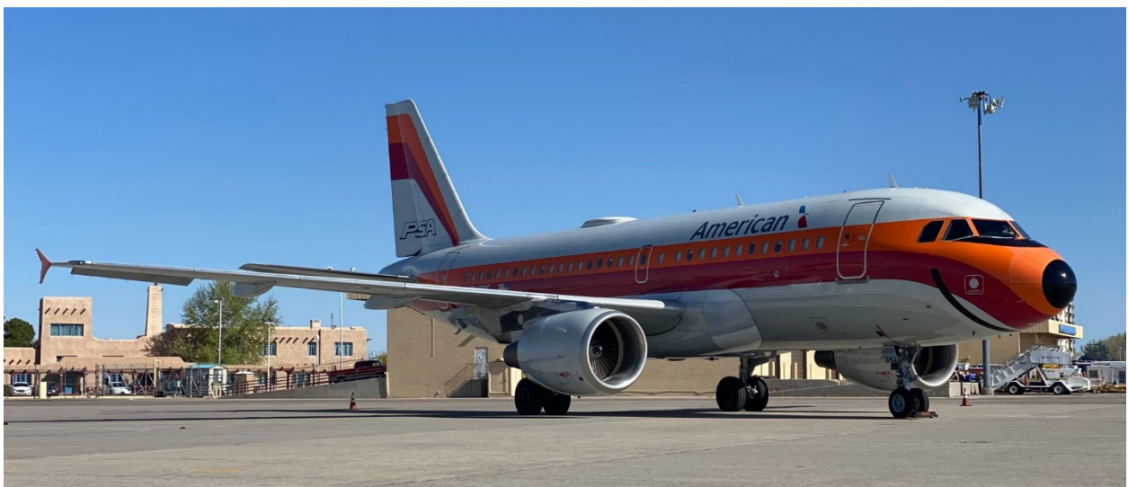
American Airlines Airbus A319 at Albuquerque in a retro livery commemorating PSA.