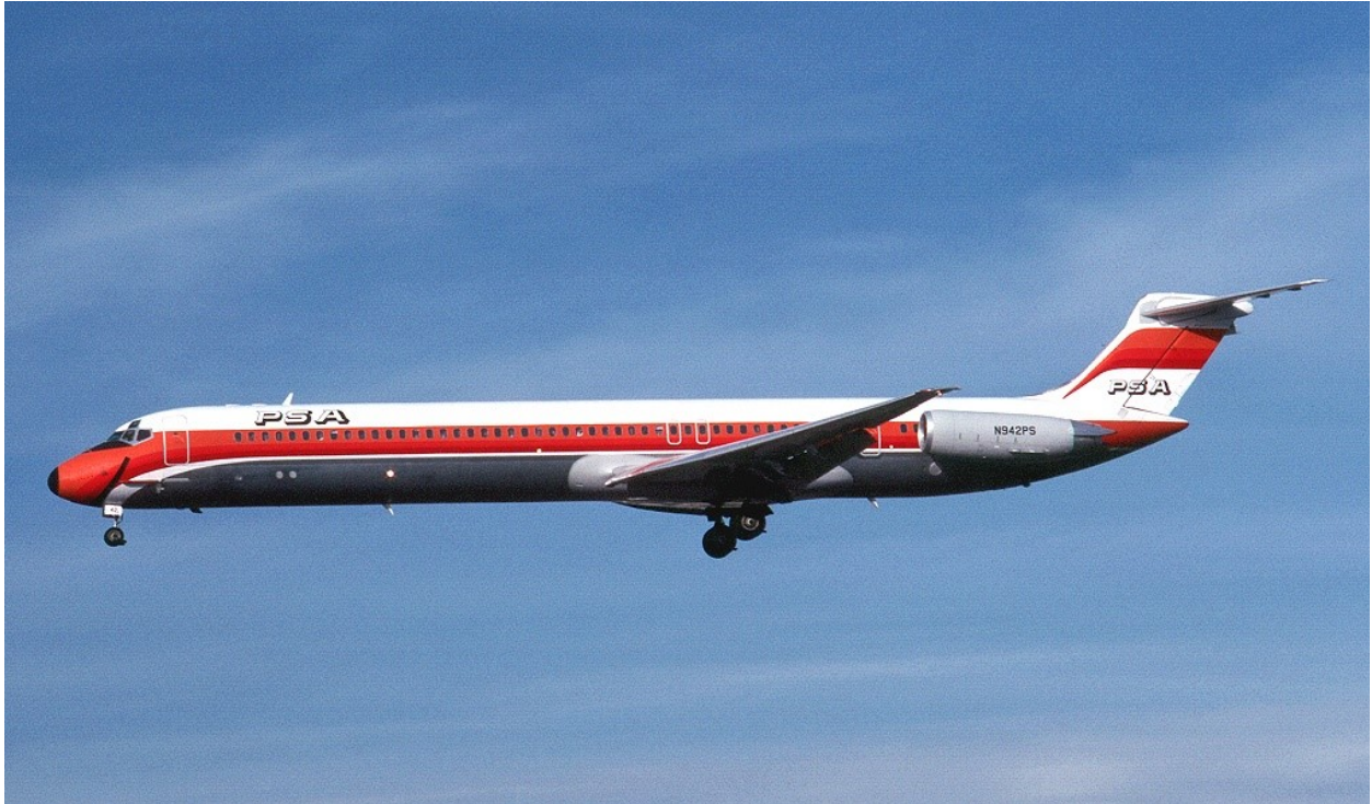
PSA McDonnell Douglas MD-80.