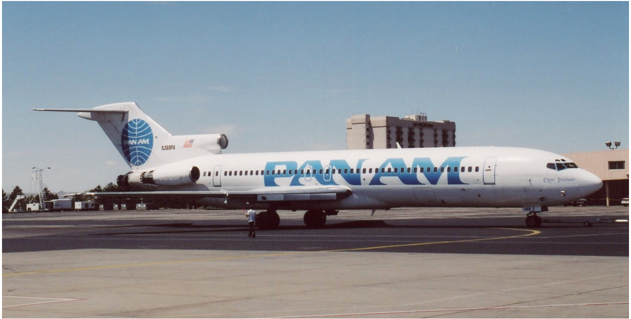
Pan Am Boeing 727-200 "Clipper Pathfinder" at the Albuquerque International Sunport