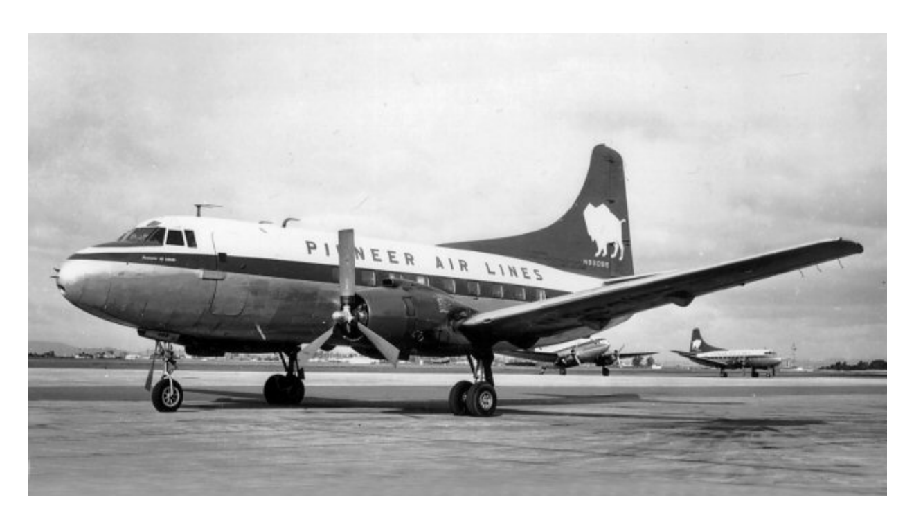
Pioneer Air Lines Martin 2-0-2.