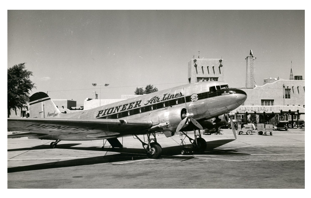
Pioneer Air Lines Douglas DC-3 at the Albuquerque Municipal Airport in the late 1940's.