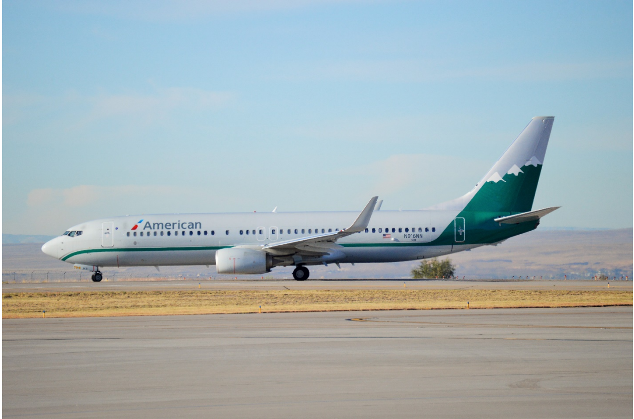
American Airlines Boeing 737-800 at Albuquerque in a retro livery commemorating RenoAir