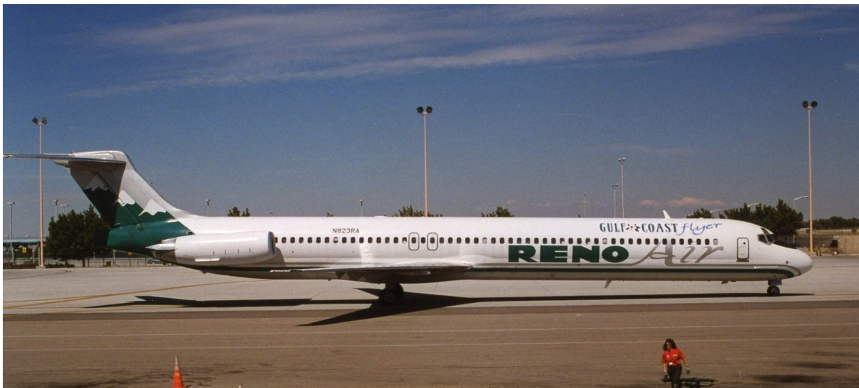
RenoAir McDonnell Douglas MD-80 at the Albuquerque Sunport

RenoAir was based in Reno, Nevada and began operations on July 1, 1992 with a small hub at Reno using MD-80 and MD-87 aircraft. Other hubs were later established in California and RenoAir initiated service to Albuquerque on October 3, 1995 with four daily flights to Los Angeles that continued to San Jose, California. Nonstop flights to Reno were briefly operated from December 1995 through May 1996 as well as a single flight to Colorado Springs in August and September of 1996. For the winter ski season of 1996/1997, RenoAir operated a flight from Albuquerque to Durango, Colorado that was an extension off of a flight from Los Angeles. On May 22, 1997 all flights to Los Angeles were discontinued and three daily flights to Las Vegas began, all of which continued onto San Jose where RenoAir was building upon as their main hub. All service to Albuquerque ended on March 31, 1998 and the airline was merged into American Airlines the following year. In remembrance of RenoAir, American repainted one its Boeing 737-800's in the livery of Reno Air in 2016.