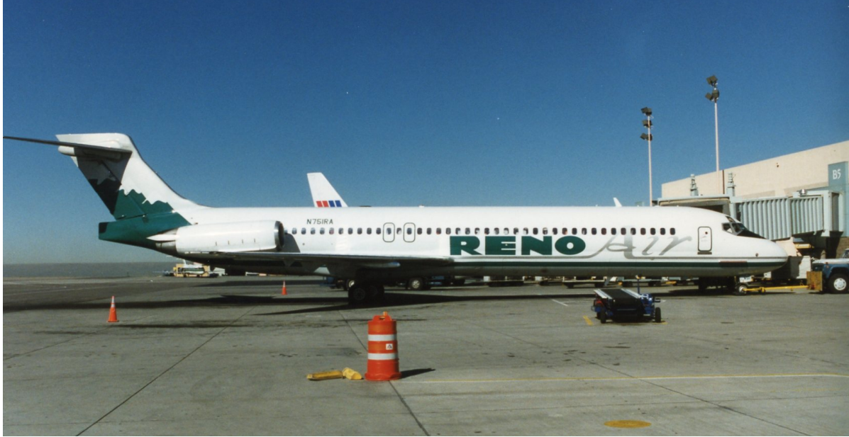
RenoAir McDonnell Douglas MD-87 at the Albuquerque Sunport