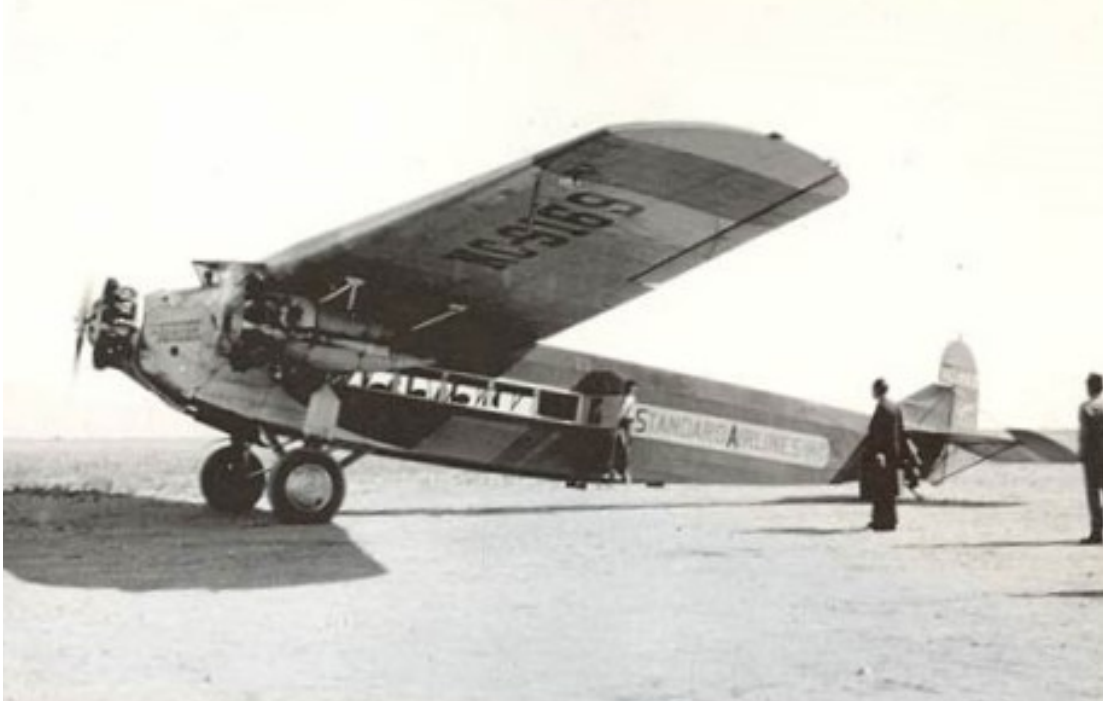
Standard Air Lines Fokker F-10 tri-motor.