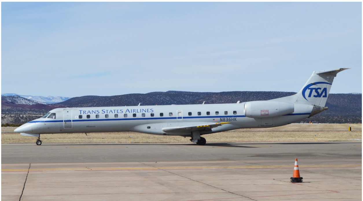
Trans States Embraer 145 in the carriers' house livery at the Santa Fe Airport.