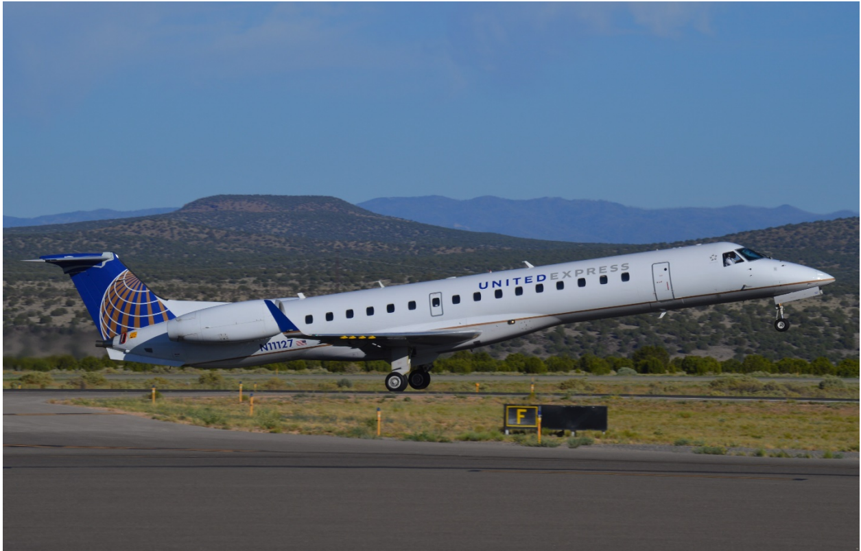
A Trans States Embraer 145 operating as United Express taking off from the Santa Fe Regional Airport.