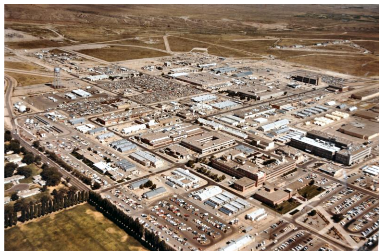
Photo of Sandia Tech Area I in the 1980s.