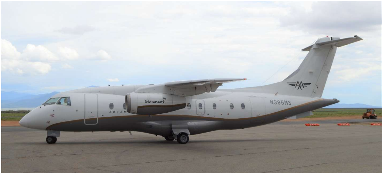
Advanced Air Fairchild Dornier 328Jet at the Taos Regional Airport.

In the fall of 2019, Advanced Air was contracted through the Taos Ski Valley to manage Taos Air, a virtual public charter airline with seasonal service from Taos, New Mexico to Austin and Dallas, Texas as well as to Carlsbad and Hawthorne, California. Taos Air operated two, 30-seat, Fairchild Dornier 328 Regional Jets. When the Taos Air aircraft were unavailable, Advanced Airlines would substitute their own aircraft. This operation ended after the summer 2022 season and was replaced by JSX Air beginning with the winter 2022/2023 ski season. For more information on Taos Air, see the separate column for that carrier under the “Past major and regional airlines” link.