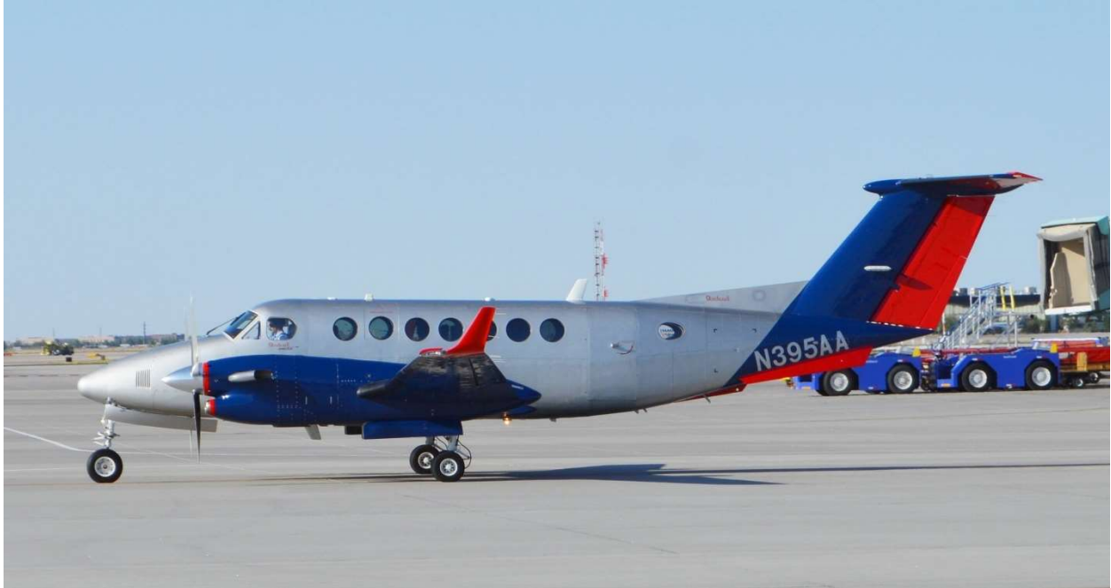
Advanced Air Beechcraft Super King Air 350 at the Albuquerque International Sunport.