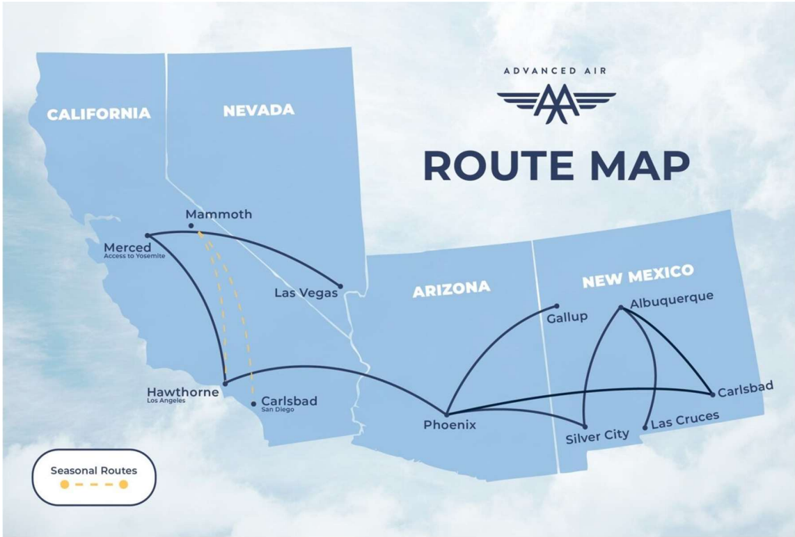
Advanced Air route map from November 5, 2023.