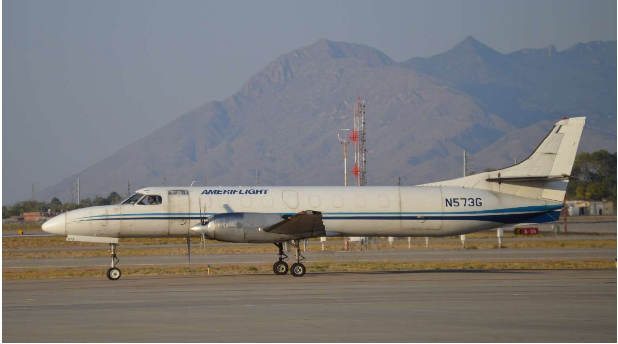
Ameriflight Swearingen Metroliner at the Albuquerque Sunport.