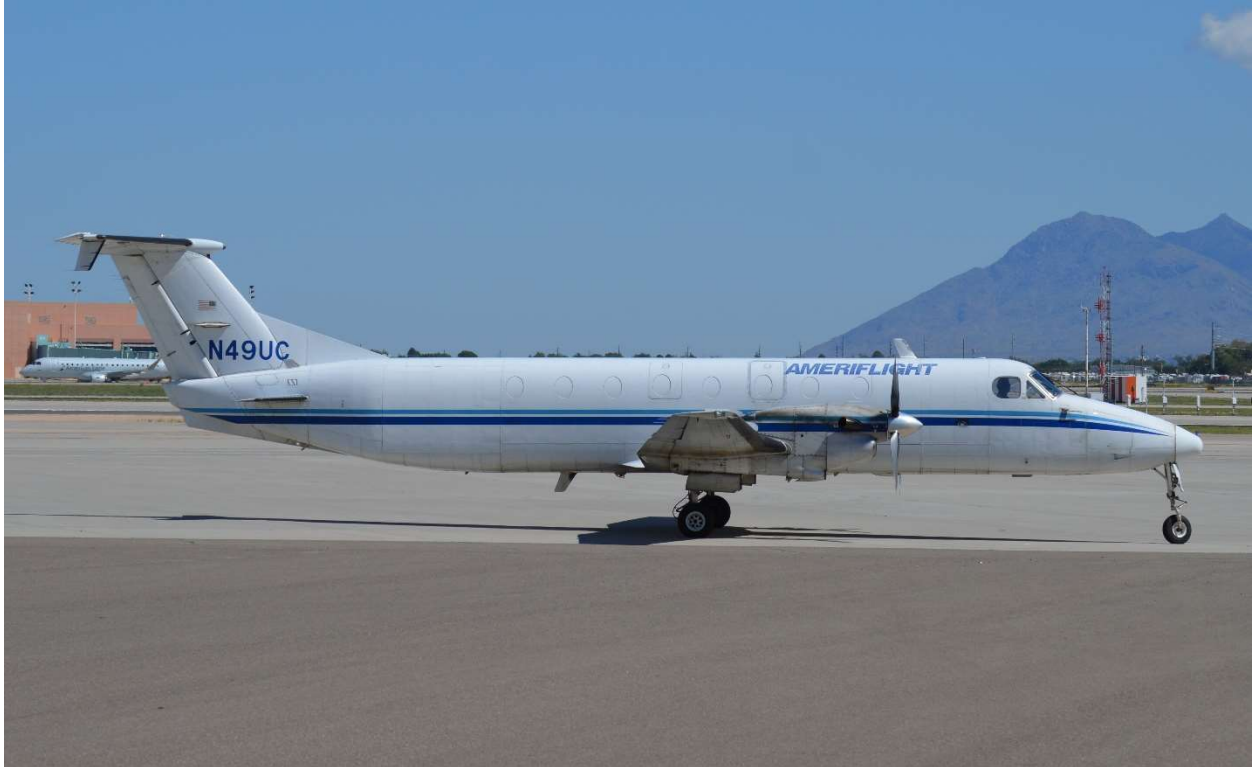
Ameriflight Beechcraft 1900C at the Albuquerque Sunport.