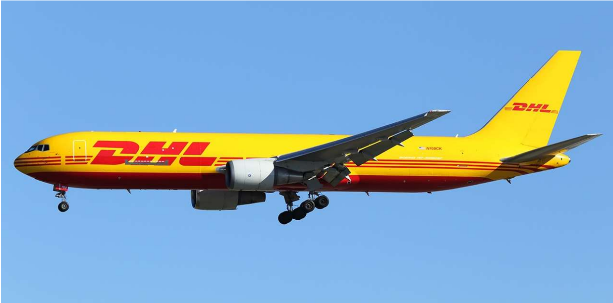
ABX Air Boeing 767-300 servicing Phoenix on behalf of DHL.