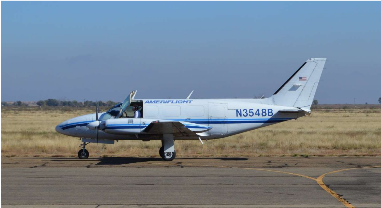
Ameriflight Piper Navajo at the Tucumcari, New Mexico airport.