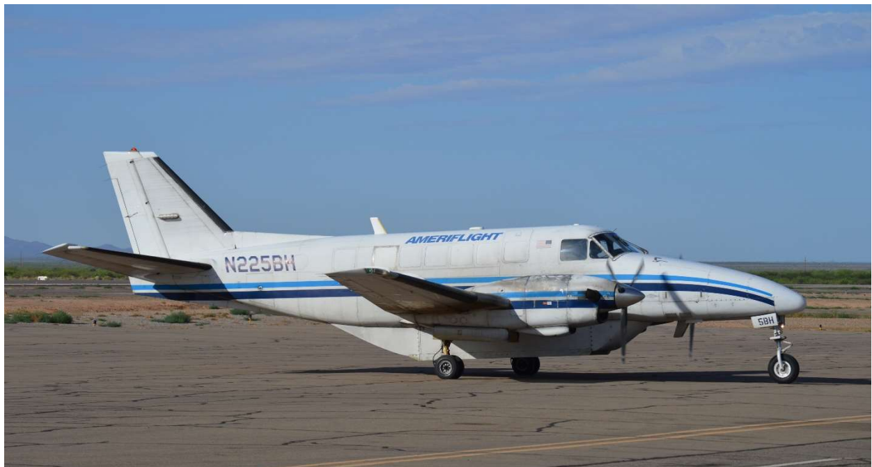
Ameriflight Beechcraft 99 at the Alamogordo/White Sands Regional Airport.