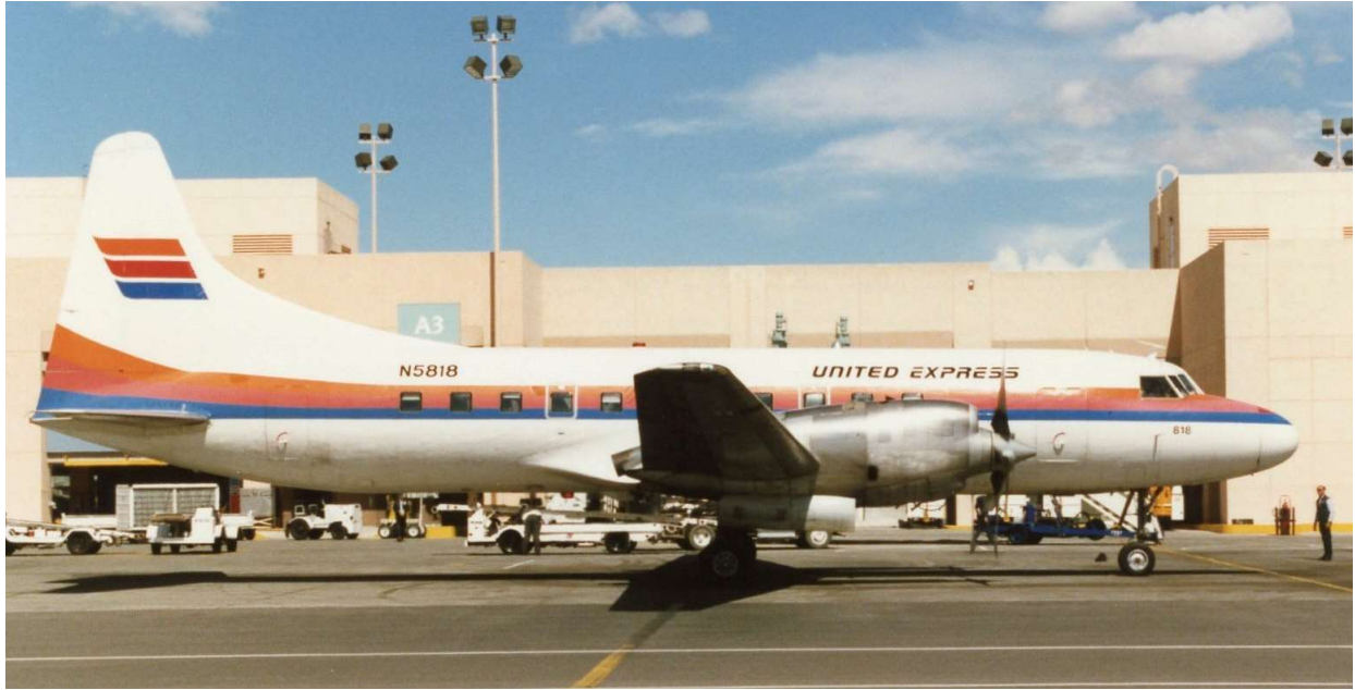
United Express Convair 580 operated by Aspen Airways at Albuquerque.