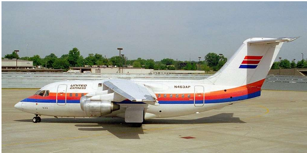
United Express BAe-146 operated by Aspen Airways.