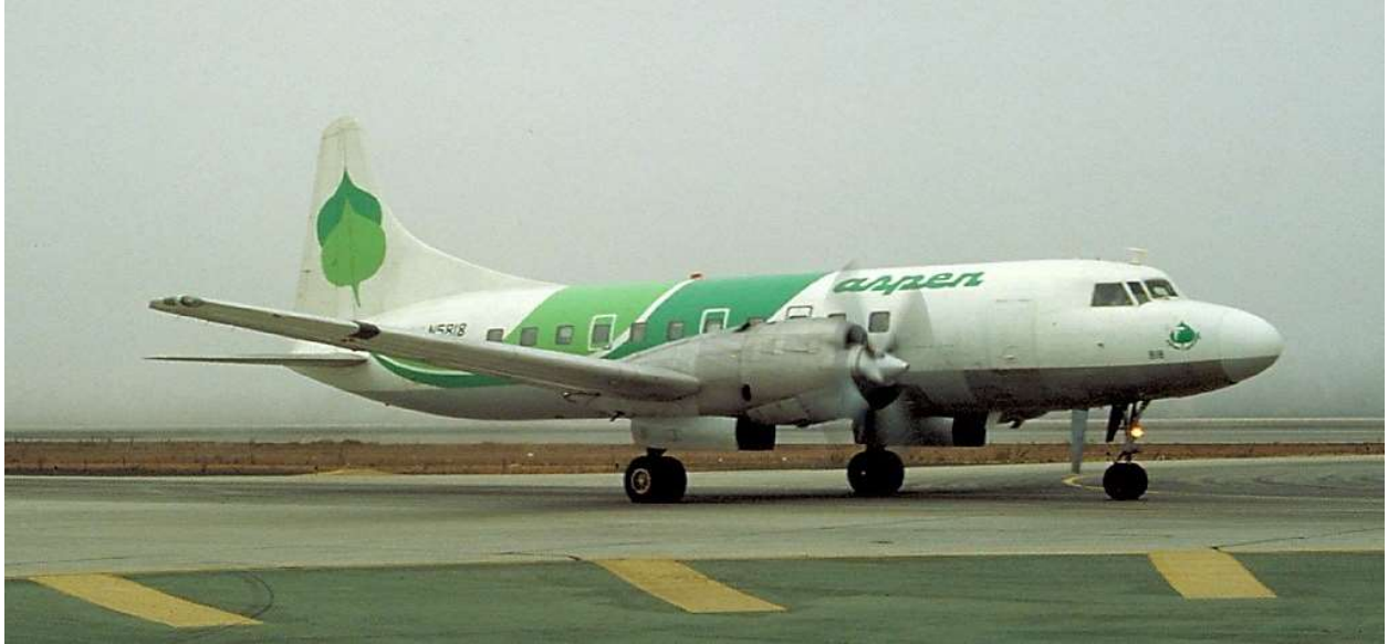
Aspen Airways Convair 580 in a new livery that began in 1985. Other colors were also used including blue, brown and orange.