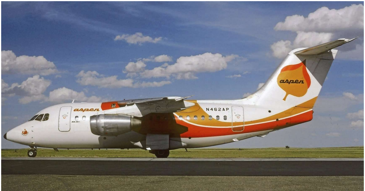
Aspen Airways BAe-146.