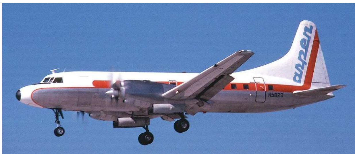
Aspen Airways Convair 580 in the livery worn when service began to New Mexico in 1979.

Aspen ceased operations on March 25, 1990 at which time Mesa Airlines became a United Express feeder carrier picking up many of Aspen's routes from Denver including the route to Farmington. The Convair 580's were retired and the BAe-146's as well as the original and very lucrative route between Denver and Aspen were transferred to Air Wisconsin, another United Express operator.