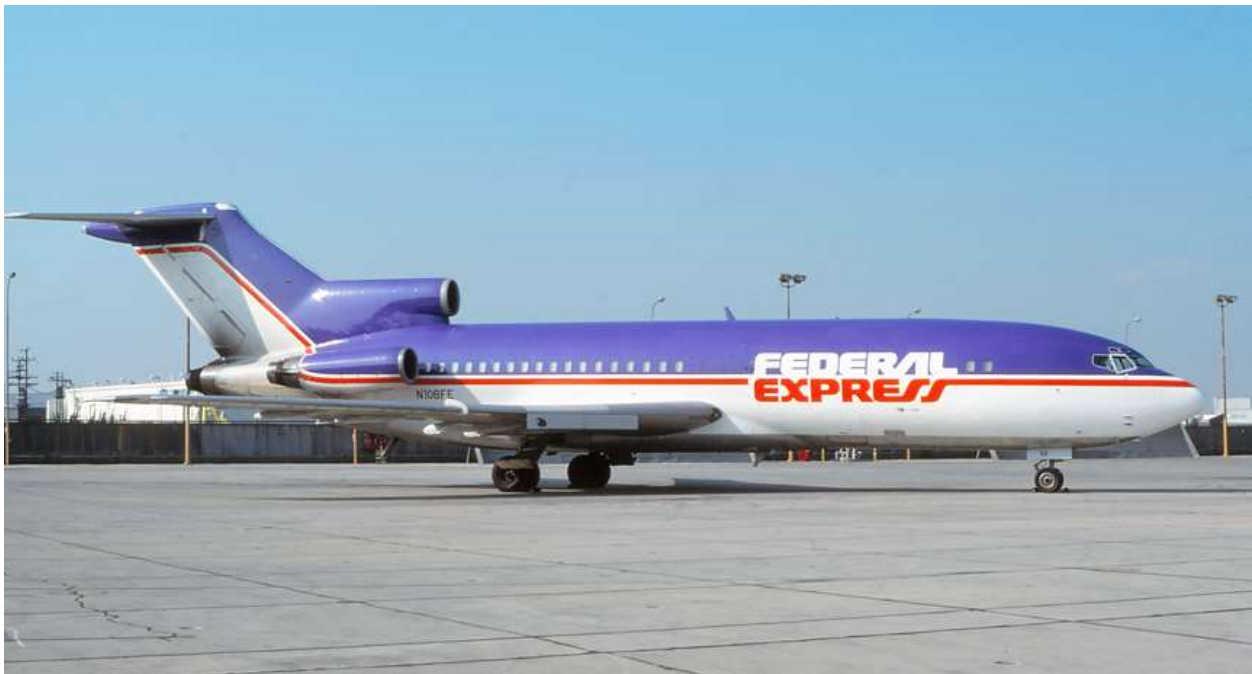
Federal Express Boeing 727-100 used during the 1980's