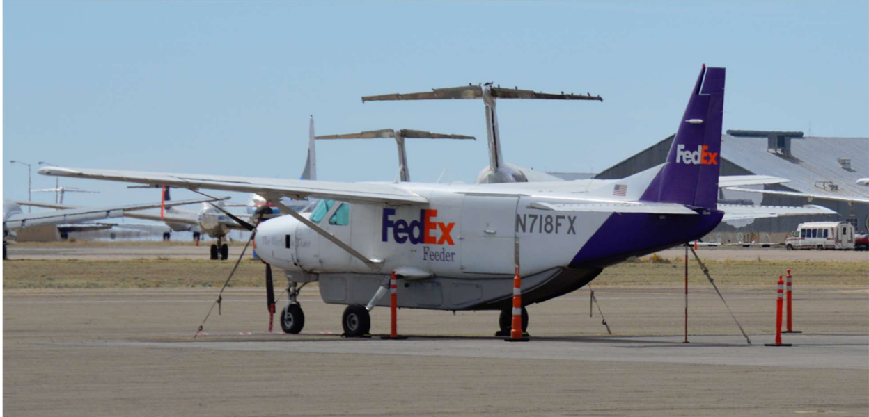
FedEx Feeder Cessna 208B Super Cargomaster operated by Baron Aviation at the Roswell International Air Center prior to discontinuing service in 2022.