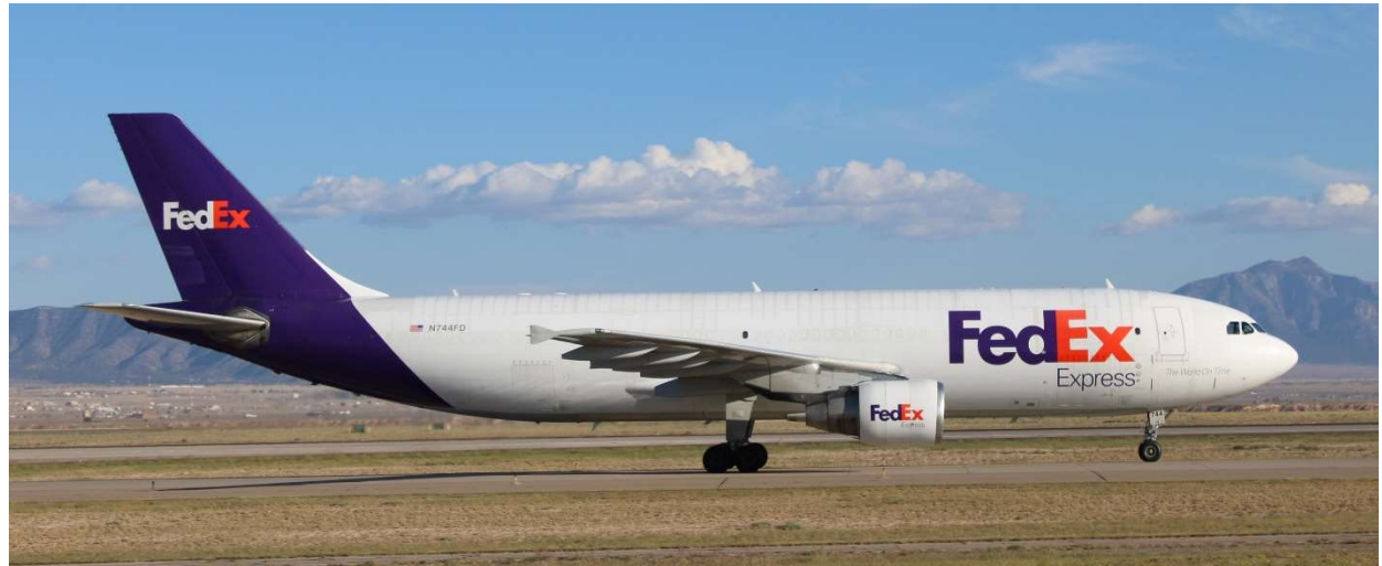
FedEx Airbus A300-600 landing at the Albuquerque Sunport.