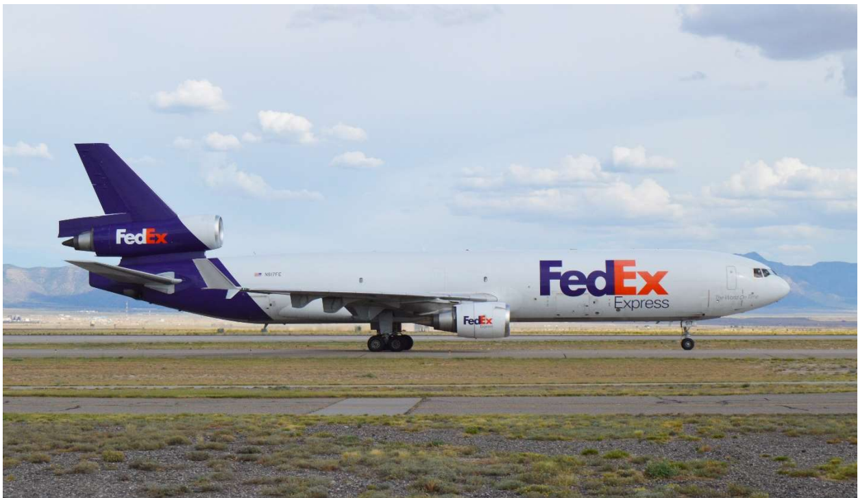
FedEx McDonnell Douglas MD-11 at the Albuquerque Sunport in 2017.