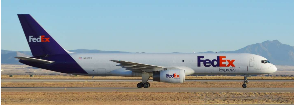
FedEx Boeing 757 at the Albuquerque Sunport displaying the new name and livery in 1994.