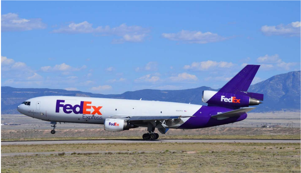
FedEx Douglas DC-10 landing at the Albuquerque Sunport. DC-10's had been flown regularly to Albuquerque until 2021.