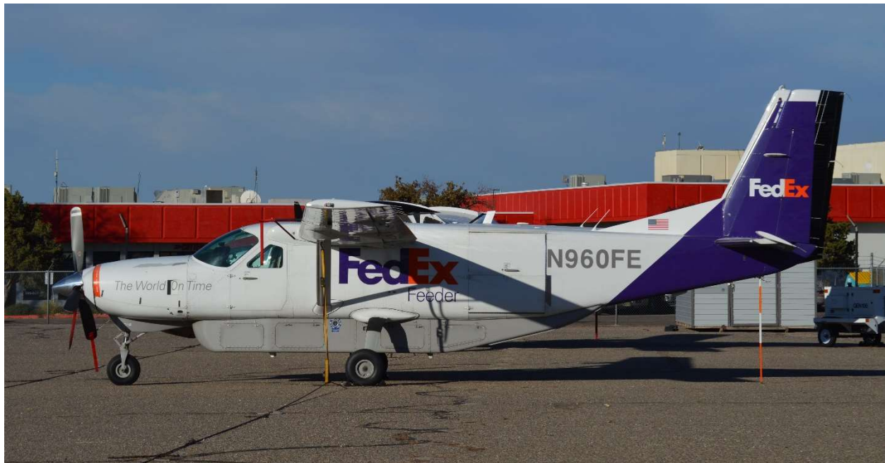
FedEx Feeder Cessna 208B Super Cargomaster operated by Reliable Airlines, formerly AirDialog, at the Albuquerque Sunport.