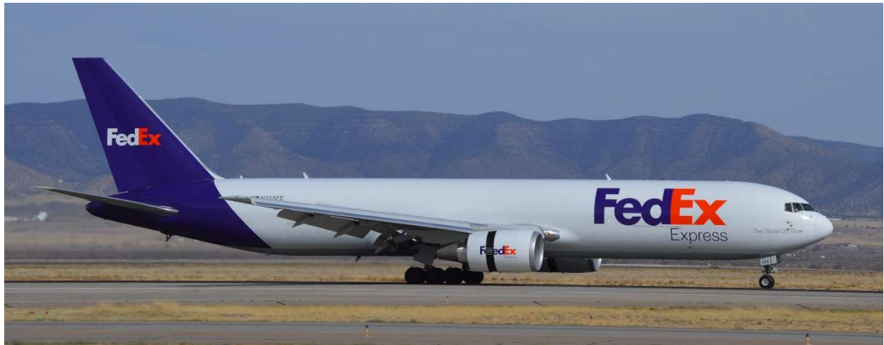
FedEx Boeing 767-300 landing at the Albuquerque Sunport.