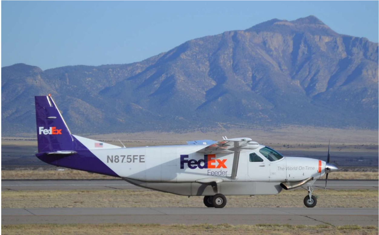
FedEx Feeder Cessna 208B Super Cargomaster operated by Empire Airlines at the Albuquerque Sunport.