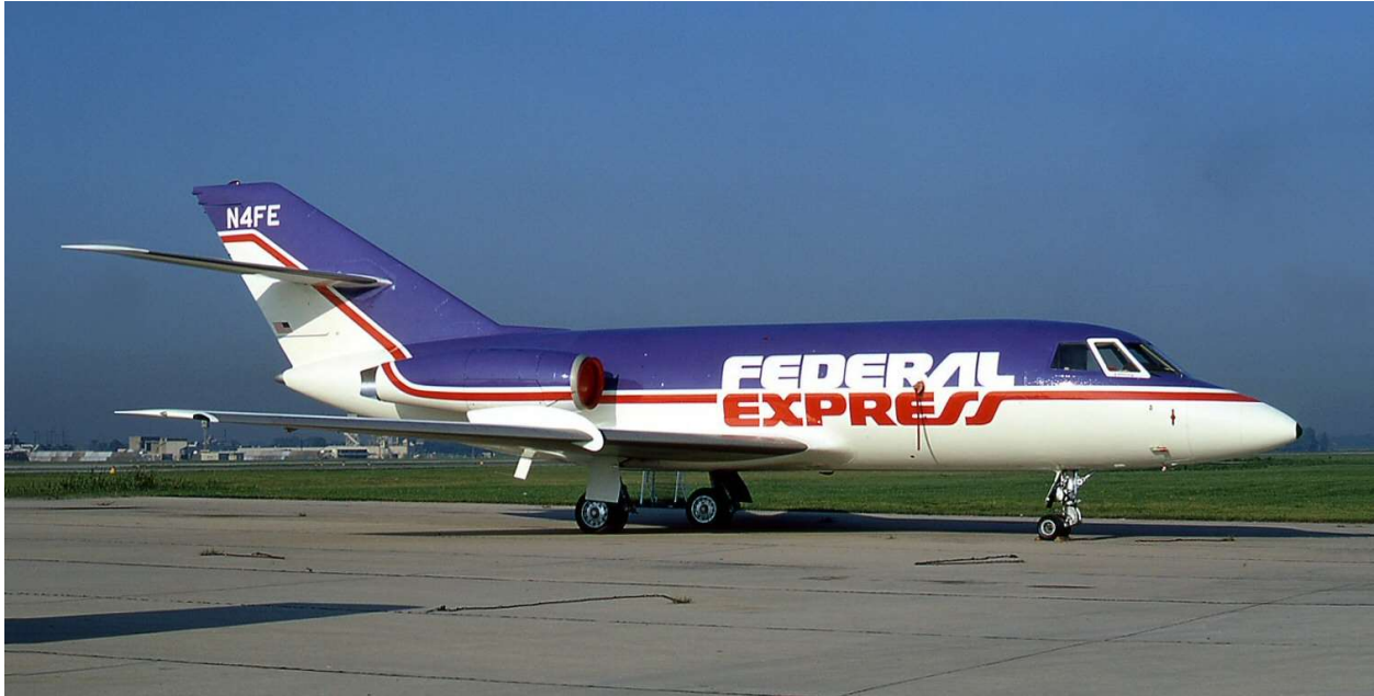
Federal Express original aircraft, the Dassault Falcon 20.

service on the Albuquerque – Durango route during the fall of 2023 while Reliable Airlines had aircraft undergoing maintenance.