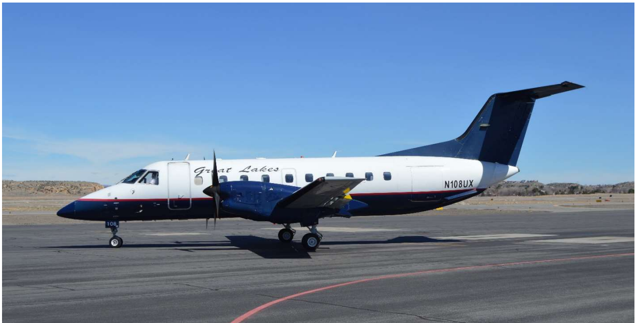
Great Lakes Embraer 120 Brasilia at Farmington.