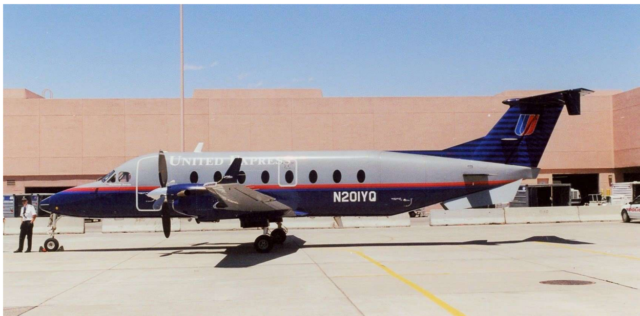
Great Lakes Beechcraft 1900D in the livery of United Express used until 2002.

Santa Fe service also began on June 1, 1998 as United Express with flights to Denver, the same as it did at Farmington. Mesa Airlines formerly operated only four flights per day between Santa Fe and Denver as United Express however Great Lakes increased the service to as many as 12 flights per day all using the same Beech 1900D type aircraft. After Great Lakes lost its status as United Express in 2002, the Santa Fe service was cut back to only two flights per day. The Santa Fe and Farmington service continued to operate an indirect code-share relationship with United Airlines as well as with Frontier Airlines when connecting at Denver with flights on United or Frontier. A single flight from Santa Fe to Albuquerque was briefly operated in 2005 and again in 2007 however all Santa Fe service was discontinued on January 7, 2008 after the announcement that American Eagle and Delta Connection carriers would serve Santa Fe from other hub cities using regional jets. Delta's service never came to be however and American's service from Santa Fe was to Dallas and Los Angeles. Great Lakes then returned to Santa Fe on December 1, 2012 with two daily roundtrips on a Denver-Santa Fe-Clovis routing. Five months later a new United Express carrier operating 50-seat regional jets began service between Santa Fe and Denver prompting Great Lakes to change its schedule to a single flight to Denver as well as adding a new nonstop to Phoenix. All service to Santa Fe ended again on November 3, 2013.