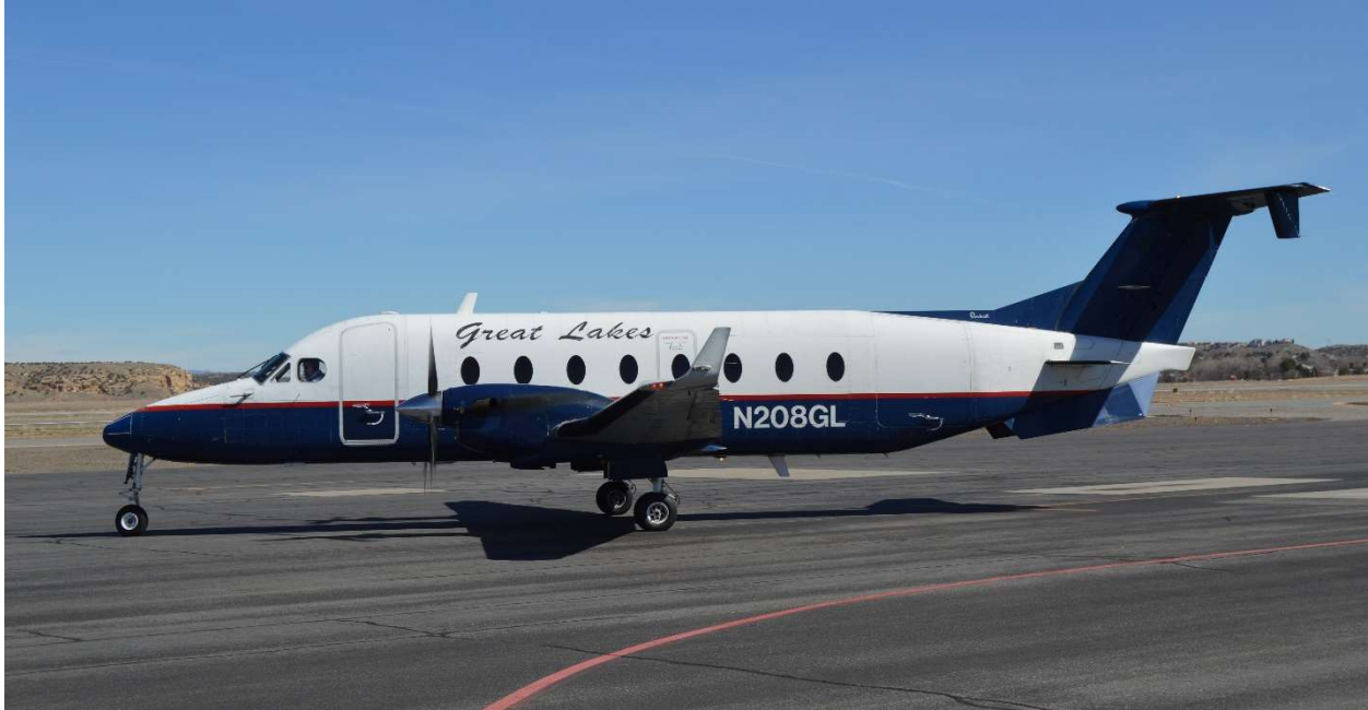
Great Lakes Beechcraft 1900D at Farmington in the carriers' house livery used from 2002.