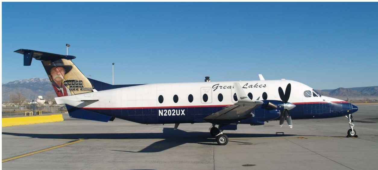
Great Lakes Beechcraft 1900D promoting Dodge City, Kansas.

Great Lakes also had a theme similar to that of Frontier Airlines in which the tails of many of their Beech 1900D aircraft were painted to advertise cities that the carrier flies to as well as some of the other regions in the West. Unfortunately, none of the cities or area in New Mexico were ever represented although the Shiprock monolith would have been a perfect example to represent the city of Farmington. Ironically, Farmington was one of the strongest cities that Great Lakes had served in their entire system.