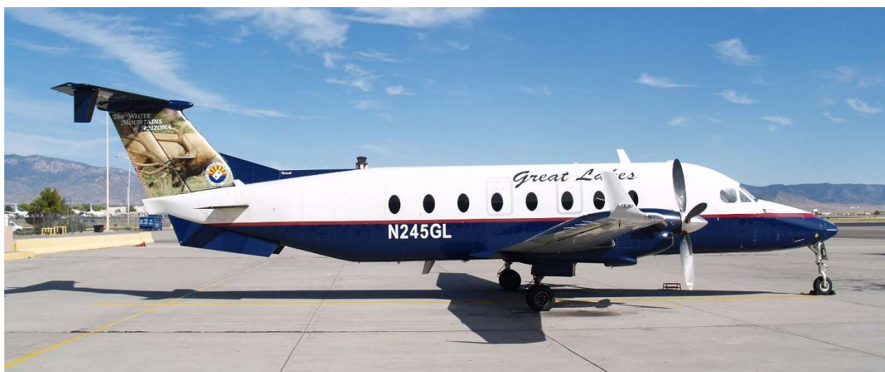
Great Lakes Beechcraft 1900D promoting the White Mountains of Arizona.