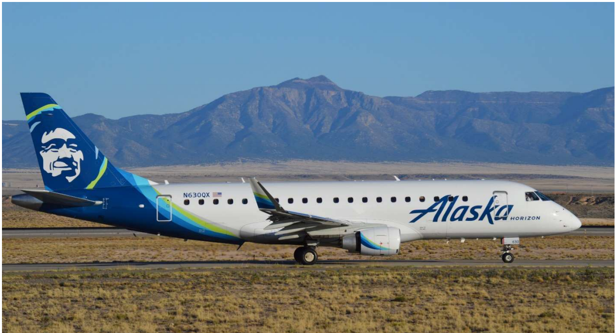
Horizon Air Embraer 175 at Albuquerque operating as Alaska Horizon.