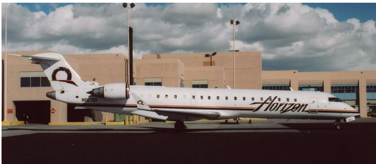
Horizon Air Canadair CRJ-700 at Albuquerque in the carriers' house livery.

Horizon Air was established in 1981 at Seattle/Tacoma, Washington operating routes within the state of Washington. In 1983 Horizon merged with Trans Western Airlines, a commuter airline based in Utah that served Albuquerque and Santa Fe from Denver for a short time in the late 1970's. Horizon was purchased by Alaska Air Group in 1986 and became the primary feeder carrier for Alaska Airlines. In 2004 Horizon began a new feeder contract with Frontier Airlines operating as Frontier Jet Express and initiated service from Albuquerque to Denver on January 5, 2004 using 70 seat Canadair CRJ-700 regional jets. Most aircraft were painted in the standard Frontier Airlines paint scheme with a wildlife emblem on the tail however at times aircraft would serve Albuquerque in the Horizon Air paint scheme. This service continued for nearly four years, ending on November 22, 2007. Frontier had then switched its feeder contract flying to Republic and Lynx Airlines while Horizon returned to flying exclusively for Alaska Airlines.