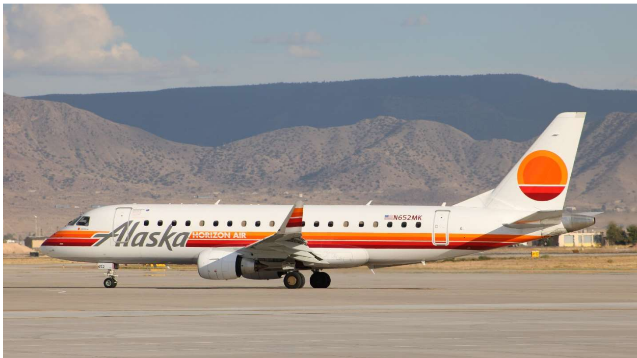
Horizon Air Embraer 175 at Albuquerque in a retro livery worn by Horizon in the 1980's.