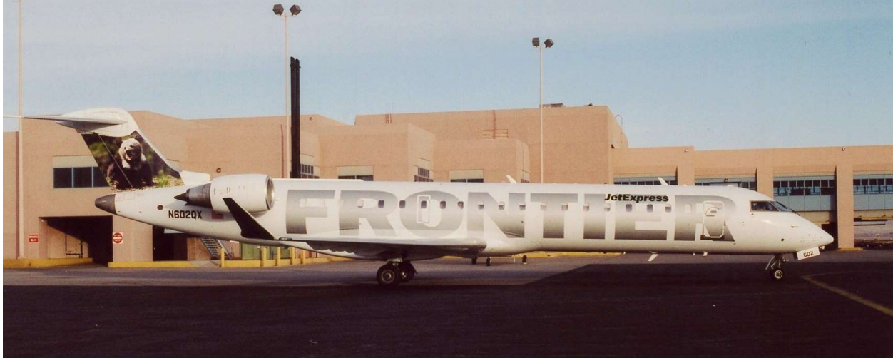
Horizon Air Canadair CRJ-700 in the Frontier Jet Express livery at Albuquerque.