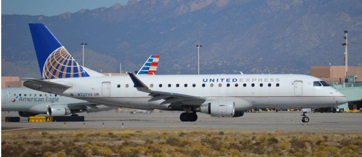
Republic Embraer 175 operated for United Express at Albuquerque in 2019.

On August 1, 2013 Republic began another new operation as American Eagle on behalf of American Airlines. New Embraer 175 regional jets are used and flights from Chicago to Albuquerque began on Republic's inaugural day of American Eagle service. Republic replaced American Eagle Airlines (now called Envoy Airlines) on the route but it was switched back to Envoy a year later. Republic and Envoy shifted back and forth several times and also had times where both carriers provided flights on the Albuquerque-Chicago route. Republic's service as American Eagle in Albuquerque was discontinued on April 4, 2016 but returned from April 2 through November 30, 2021, as Republic Airways, again operating to Chicago along with Envoy.