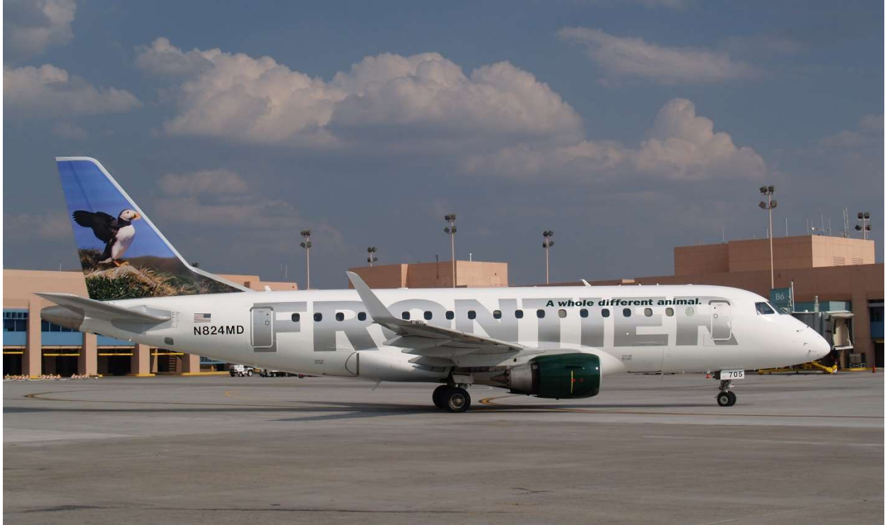
Republic Embraer 170 operated for Frontier Airlines at Albuquerque in 2007.