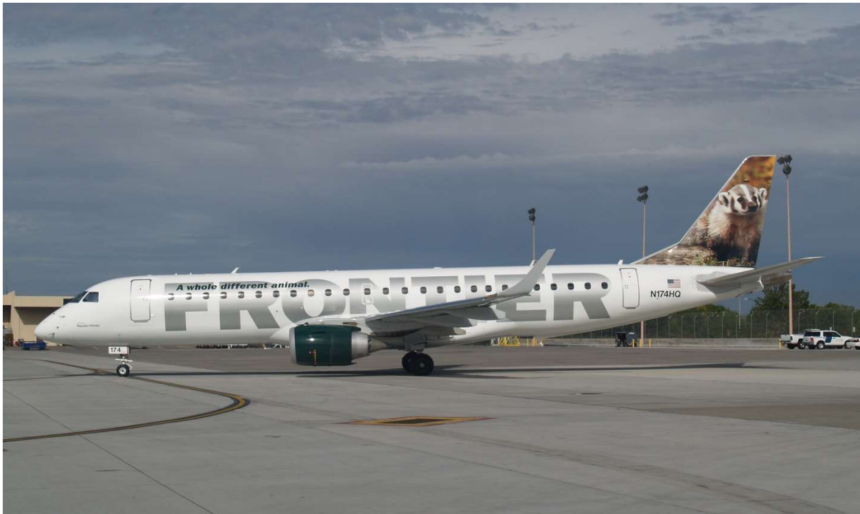
Republic Embraer 190 operated for Frontier Airlines at Albuquerque in 2010.