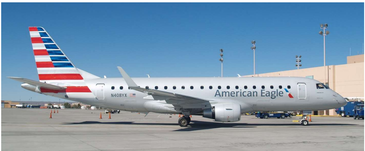
Republic Embraer 175 operated for American Eagle at Albuquerque in 2013.

On August 1, 2013 Republic began another new operation as American Eagle on behalf of American Airlines. New Embraer 175 regional jets are used and flights from Chicago to Albuquerque began on Republic's inaugural day of American Eagle service. Republic replaced American Eagle Airlines (now called Envoy Airlines) on the route but it was switched back to Envoy a year later. Republic and Envoy shifted back and forth several times and also had times where both carriers provided flights on the Albuquerque-Chicago route. Republic's service as American Eagle in Albuquerque was discontinued on April 4, 2016 but returned from April 2 through November 30, 2021, as Republic Airways, again operating to Chicago along with Envoy.