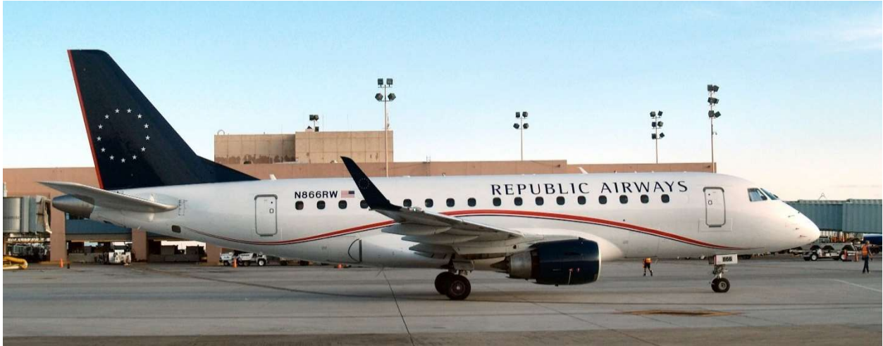
Republic Airways Embraer 170 at Albuquerque in 2007.