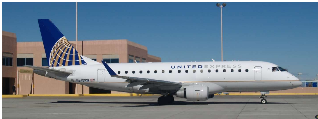
United Express Embraer 170 operated by Shuttle America at Albuquerque in 2013.

Shuttle America also operated as Delta Connection on behalf of Delta Air Lines using Embraer 170 and 175 regional jets. Delta Connection service from Salt Lake City to Albuquerque was planned to begin in April, 2016 but did not materialize.