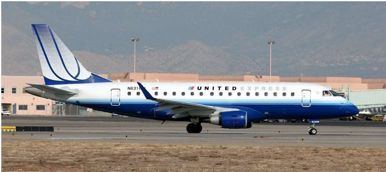
United Express Embraer 170 operated by Chautauqua Airlines at Albuquerque in 2005.

Chautauqua Airlines was founded as a commuter airline in 1973 in Jamestown, New York. The carrier was one of the first airlines to code-share with a major airline when it became an Allegheny Commuter on behalf of Allegheny Airlines in the 1970's. Allegheny became US Air in 1979 and later US Airways in which Chautauqua became a US Airways Express operator. Chautauqua was acquired by Republic Airways Holdings in 1998 and began code-sharing alliances with several other major airlines including a United Express operation on behalf of United Airlines. Chautauqua began serving Albuquerque on January 6, 2005 with United Express flights to Chicago using 70-seat Embraer 170 regional jets. However it was deemed that Chautauqua had violated a pilot scope clause through a code-share agreement they had with another major airline by operating aircraft with more than 50 seats. To resolve the issue, the Embraer 170 jets were transferred to Shuttle America, another subsidiary under Republic Holdings and United Express operator. Service to Albuquerque ended in fall, 2005 and was resumed by Shuttle America using the same aircraft.