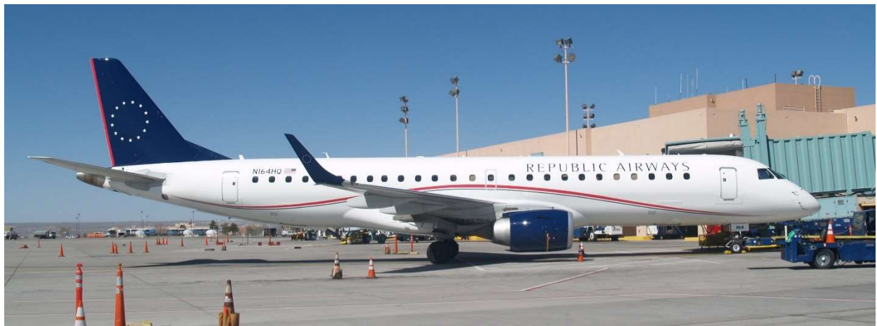
Republic Airways Embraer 190 at Albuquerque in 2014.