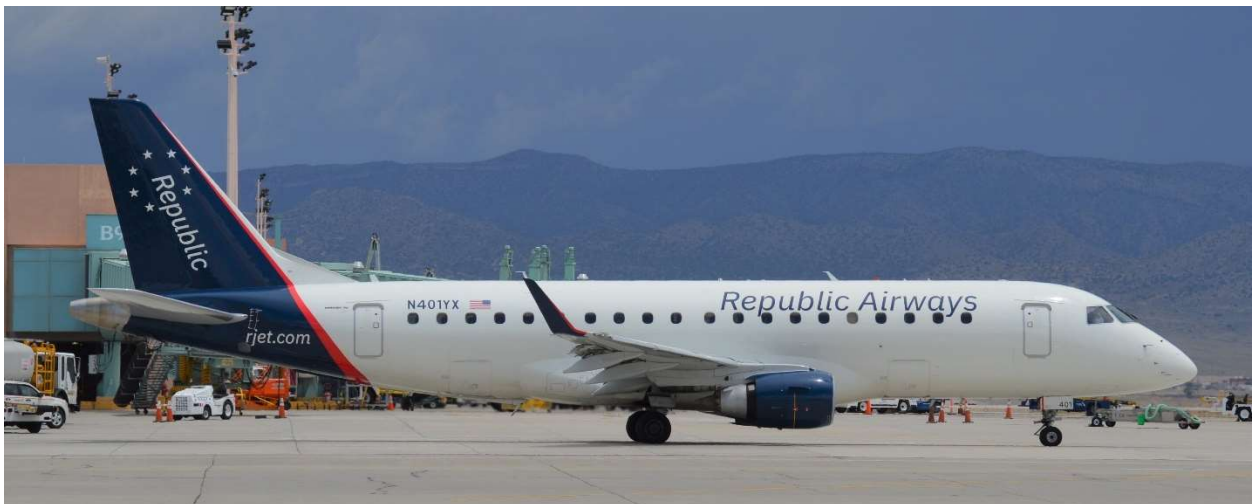
Republic Airways Embraer 175 at Albuquerque in 2021 displaying a new image that began in 2018.