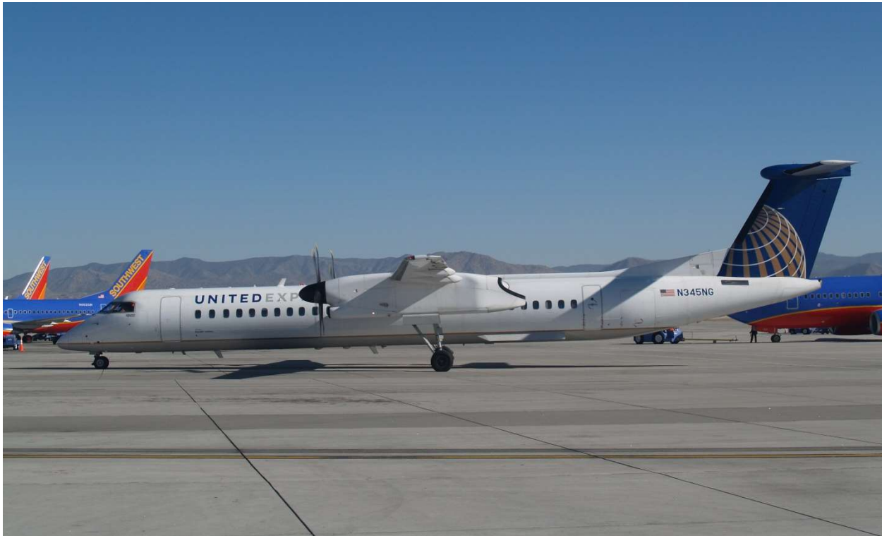
Republic De Havilland Dash-8-Q400 operated for United Express at Albuquerque in 2012. Republic Airlines was renamed to Republic Airways in 2018.

In 2012, Republic acquired a fleet of 74-seat Bombardier De Havilland Dash-8-Q400 turbo props and began a new operation as United Express on behalf of United Airlines with flights from Albuquerque to Denver that started October 3, 2012. The Republic flights to Albuquerque did not operate consistently as they are used to supplement several other United Express carriers as well as United Airlines mainline flights on the Denver route. As the Dash-8-Q400's were retired in 2016, United Express service to Albuquerque ended on February 9 of that year but resumed on June 9, 2016 with flights to Houston using Embraer 170's replacing Shuttle America which was also a subsidiary of Republic Airways Holdings. Since then, flights to Denver and Chicago resumed and new 76-seat Embraer-175 aircraft have been introduced. The flights to Denver were dropped at the beginning of 2020 and the remaining flight to Chicago periodically alternates with SkyWest and United mainline jets. Embraer-170 and -175 regional jets are still used and all service to Albuquerque last operated on March 3, 2022.