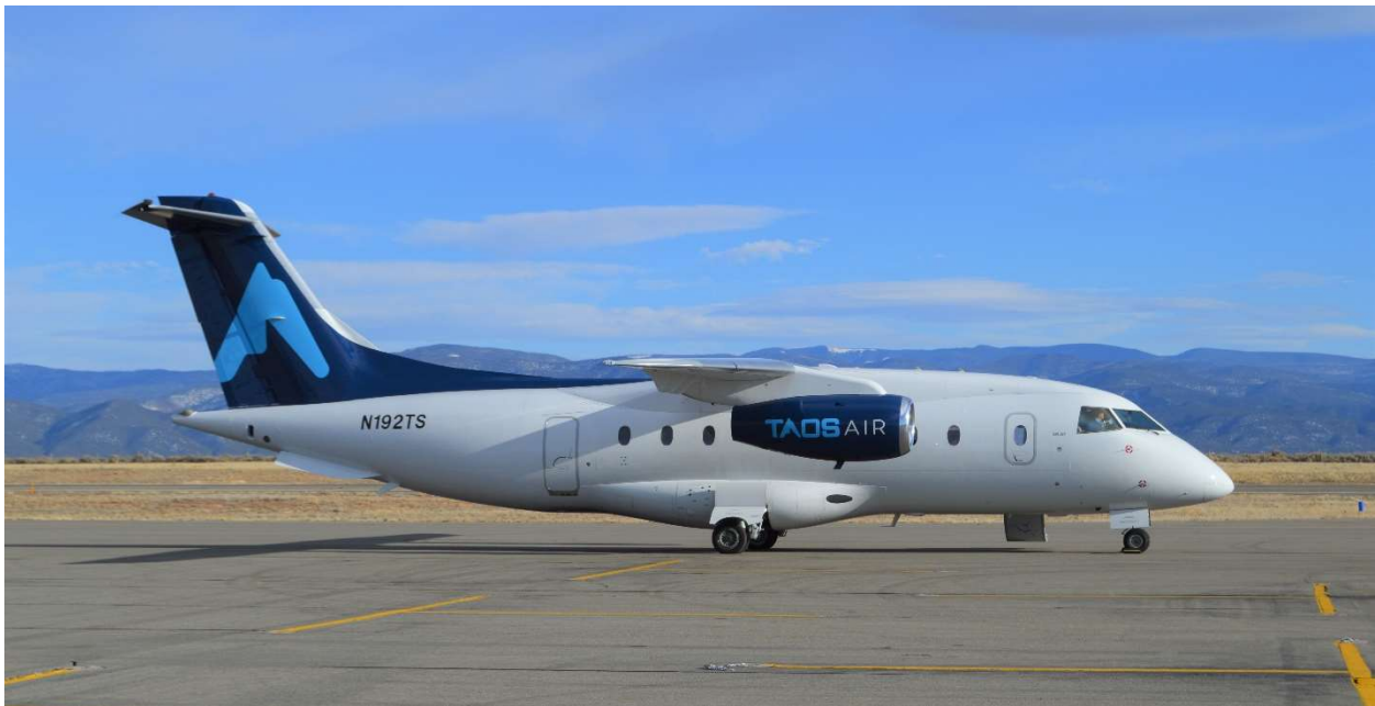
Taos Air Fairchild Dornier 328Jet at the Taos Regional Airport.

Taos Air was a virtual airline, managed by Advanced Air, that operated seasonal scheduled public air charter service from the Taos Regional Airport to Austin and Dallas in Texas as well as to Los Angeles and San Diego in California. The aircraft used were owned by the Taos Ski Valley. Taos Air first began flights during the 2018/2019 ski season using a single Dornier 328Jet operated by Ultimate Jet Charters and painted as Taos Air. The Taos Ski Valley then purchased this aircraft along with a second Dornier 328Jet and entered into an agreement with Advanced Air to manage the service. Flights resumed for the 2019/2020 ski season to Austin and Dallas (Love Field Airport) and new service was added to Los Angeles, via the Hawthorne, California airport, and to San Diego, via the Carlsbad, California airport. New service for the summer of 2020 as well as all service for the 2020/2021 ski season was cancelled due to the COVID-19 virus. Seasonal summer service then began in 2021 and the regular ski season service resumed in the winter of 2021/2022. By the summer of 2022, flights to Austin began operating through the Austin Executive Airport rather than the Bergstrom International Airport. All service ended after the summer 2022 season and new service began using JSX Air with the winter 2022/2023 season.