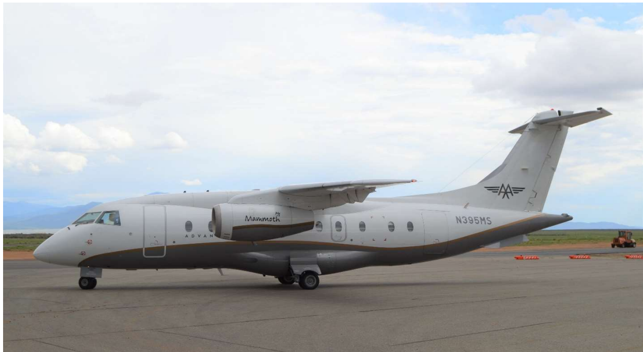
Advanced Air Fairchild Dornier 328Jet at the Taos Regional Airport.

Advanced Air was established in 2005 and is based in Hawthorne, California. The carrier performed private charters exclusively until early 2019 when it began commercial flights. In the fall of 2019, Advanced Air was contracted through the Taos Ski Valley to manage Taos Air, a virtual public charter airline with winter and summer seasonal service from Taos, New Mexico to Austin and Dallas, Texas as well as to Carlsbad and Hawthorne, California. Two, 30-seat, Fairchild Dornier 328 Regional Jets were purchased by the Taos Ski Valley and painted with the markings of Taos Air. When the Taos Air aircraft were unavailable, Advanced Airlines would substitute their own aircraft. The operation ended after the summer 2022 season and the Taos Ski Valley began working with JSX Air for air service beginning with the 2022/2023 winter ski season.