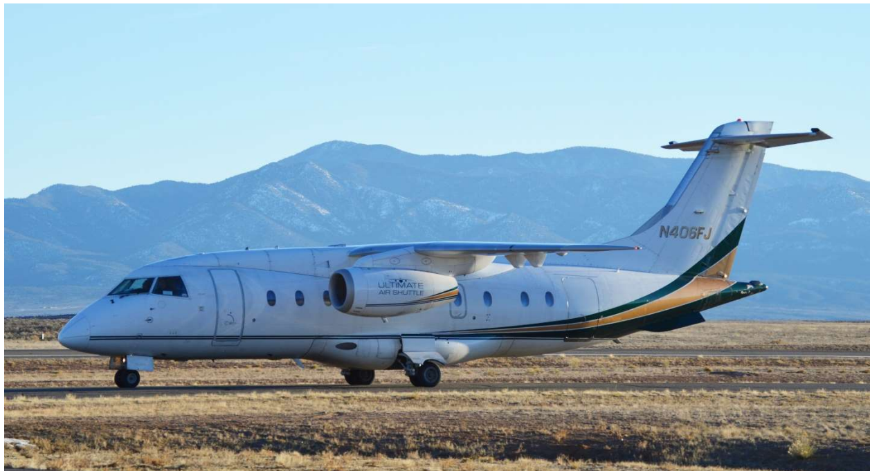
Ultimate Air Shuttle Fairchild Dornier 328Jet at the Taos Regional Airport.

For the ski season of December 20, 2018 through March 31, 2019, Ultimate operated scheduled public charter flights under the name Taos Air on three days per week from Taos to Dallas, Love Field Airport, and Austin, Texas using the Dornier 328Jet. The operation was supported by the city of Taos and the Taos Ski Valley. The service was planned to resume for the summer season from June 27 through September 22, 2019 as well as for future ski seasons however the contract between the Taos Ski Valley and Ultimate Jet Charters was cancelled. Taos Air resumed service for the 2019/2020 ski season under a new contract with Advanced Air. Ultimate Air Shuttle suspended all of its operations at the end of 2021.