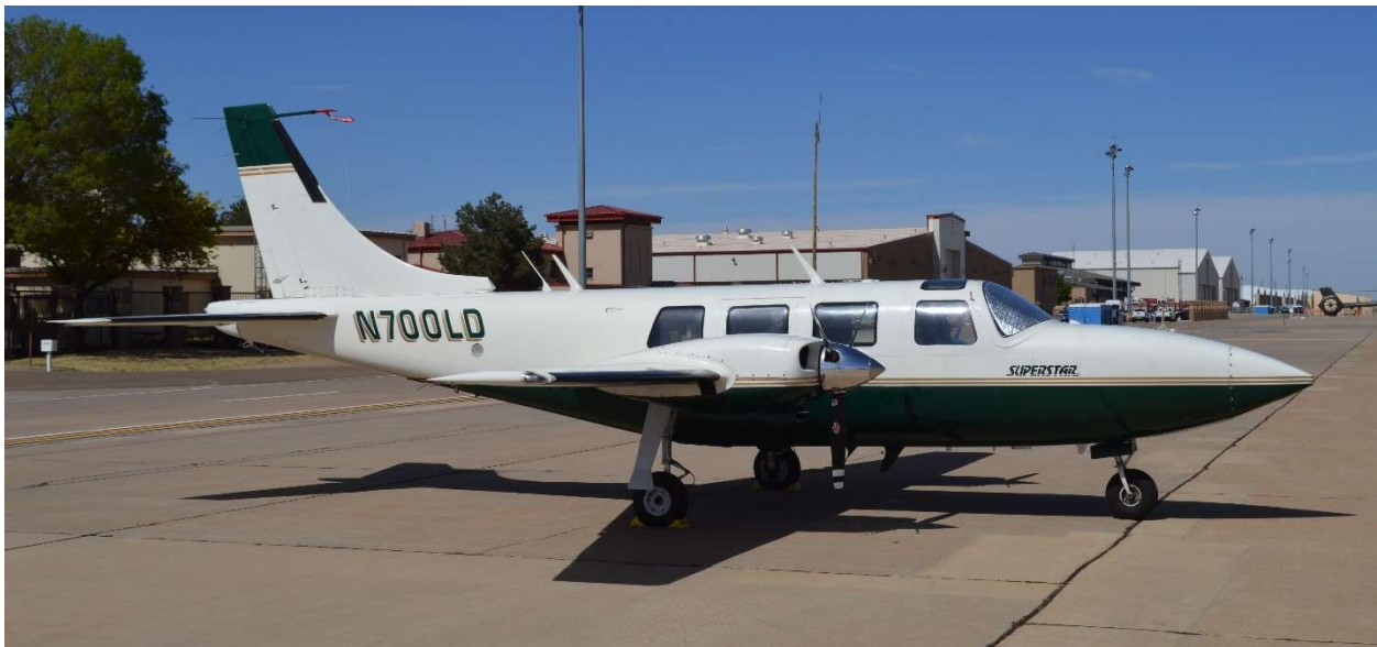
Ted Smith Aerostar, now referred to as a Piper Aerostar, like what was operated by Trans Western Airlines.

Trans Western Airlines was based in Logan, Utah and operated an Albuquerque-Santa Fe-Denver route from about May 15, 1977 through late 1978. The carrier started service with a Ted Smith Aerostar 601 aircraft then switched to a Twin Beech-18. It appears that the once daily round-trip flight was taken over from a previous carrier, Priority Air Transport. In September, 1978 Trans Western added a second round-trip which included stops at Espanola and Taos, New Mexico as well as Alamosa, Colorado along the route between Santa Fe and Denver. All New Mexico service ended by November, 1978 and Trans Western continued serving Utah and surrounding states with a hub in Salt Lake City until it merged into Horizon Air in 1983. Horizon Air, now a subsidiary of Alaska Air Group, then served Albuquerque in the mid-2000s as Frontier Jet Express and again beginning in 2017 as Alaska Horizon providing feeder service on behalf of Alaska Airlines.