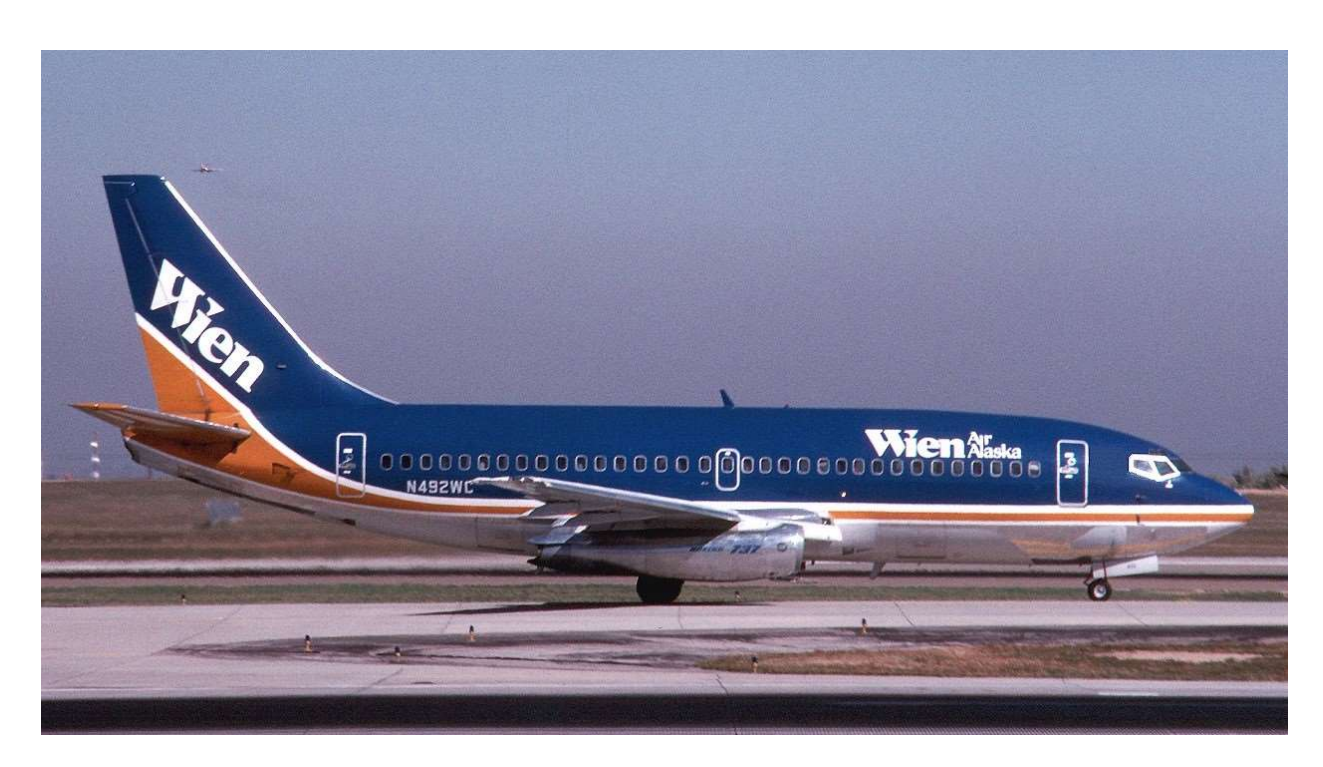
Wien Air Alaska Boeing 737-200.

Wien Alaska Airways was a family owned airline established in 1927 operating within the state of Alaska. The name was changed several times until Wien Air Alaska was adopted in 1974. After airline deregulation in 1978, Wien began expanding into the lower 48 states and introduced service to Albuquerque on March 2, 1984 with a single flight to Oakland, California, continuing on to Portland, Seattle, Anchorage, and ending in Kodiak, Alaska using a Boeing 737-200 aircraft. A second flight was added a month later to Denver, Seattle, and Anchorage using a 727-200 but ended the same month. Wien's service to Albuquerque was very brief as the first flight was then discontinued on May 31, 1984, only three months after it had started. The airline had shut down by November of that year.