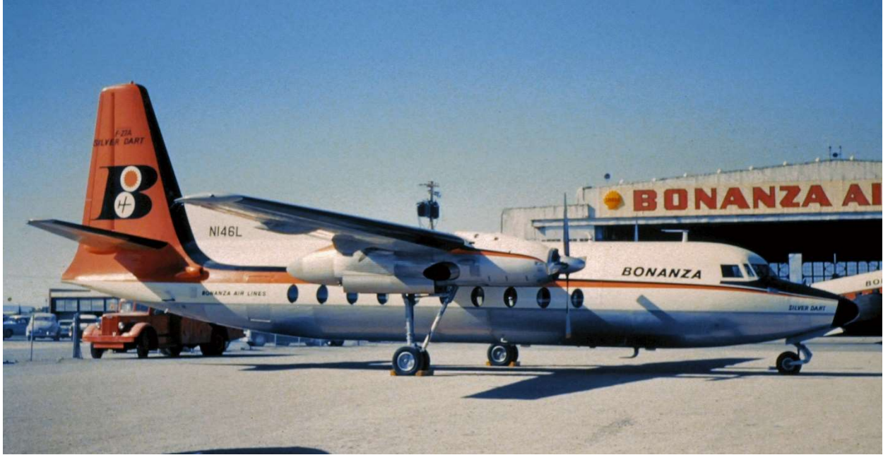
Bonanza Air Lines Fairchild F-27.