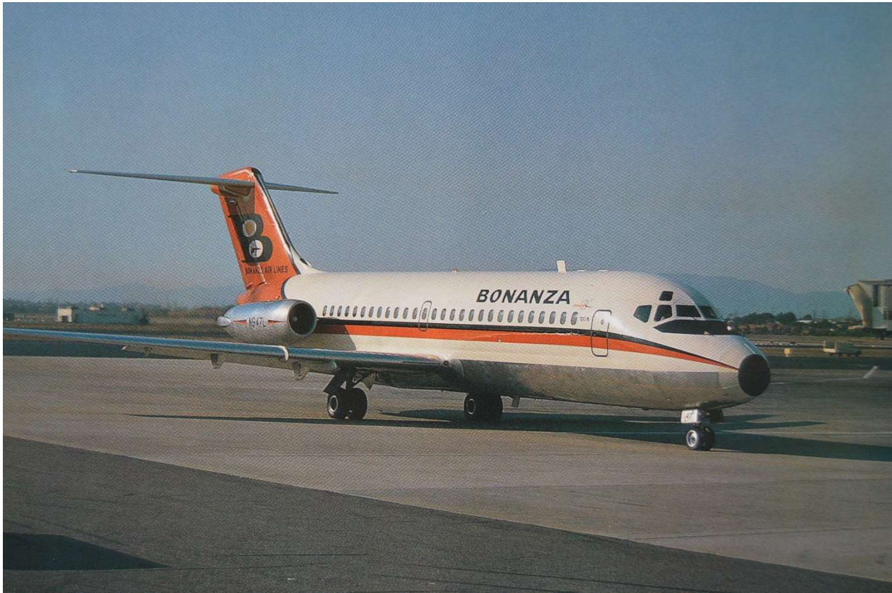
Bonanza Air Lines Douglas DC-9.