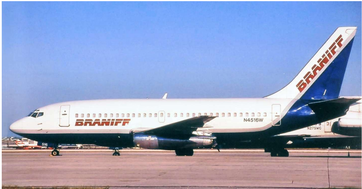
Braniff Boeing 737-200.