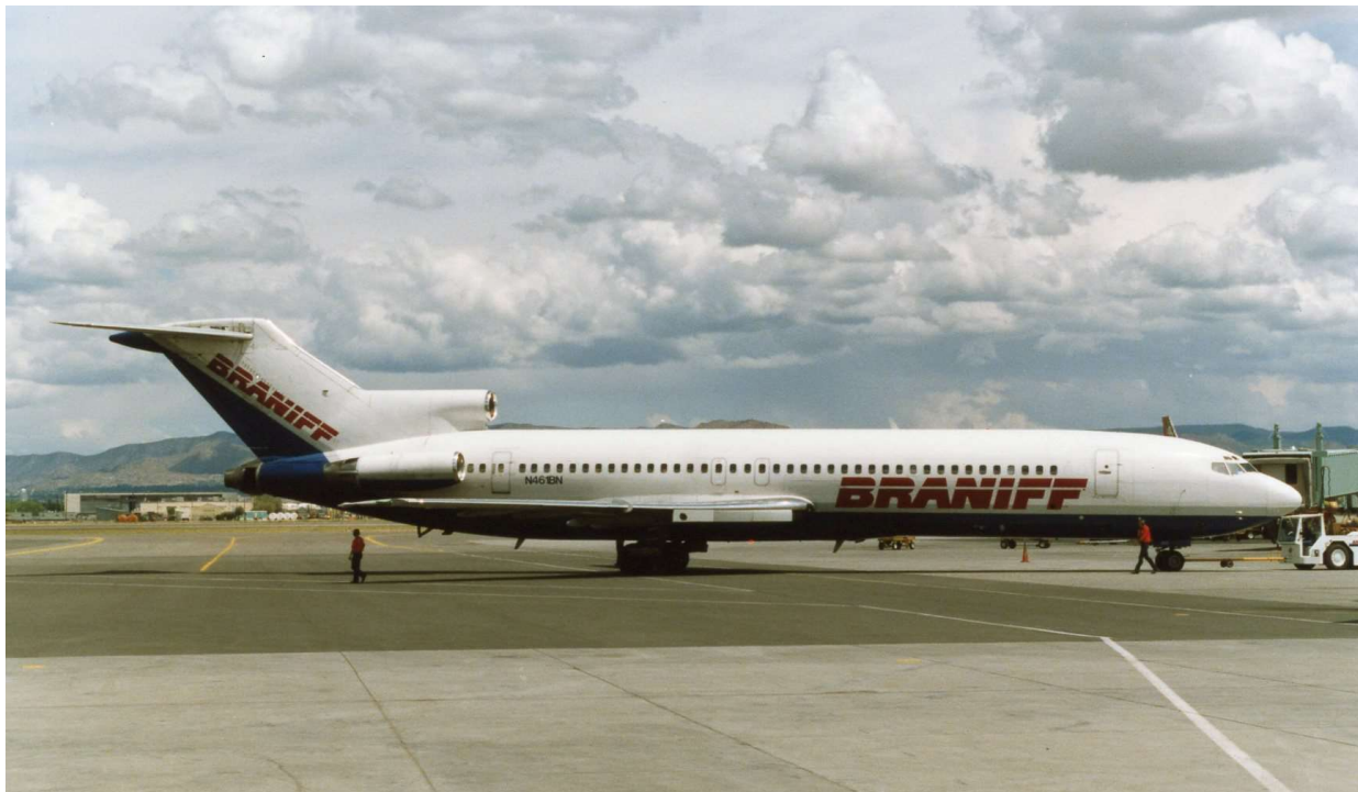
Braniff Boeing 727-200 at the Albuquerque International Sunport.

Braniff Airways was a large U.S. legacy air carrier founded in 1928 and based in Dallas, Texas. The airline, later known as Braniff International, operated routes throughout the United States, Mexico, and South America with major hubs at Dallas/Fort Worth and Miami. For a time in 1947 Braniff proposed to serve Albuquerque and Roswell with an Amarillo-Albuquerque-Los Angeles route and a Lubbock-Roswell-Phoenix-San Diego route. Upon airline deregulation in 1978, Braniff had very aggressive expansion causing it to lose a massive amount of money, declare bankruptcy, and shut down on May 12 of 1982. The airline reorganized and returned to life in 1984, building a new hub at Kansas City where Eastern Air Lines was retreating. Braniff briefly served Albuquerque from April 19, 1988 through September 27, 1989 with two daily roundtrip flights from Kansas City to Albuquerque and continuing onto Tucson using Boeing 727-200 and 737-200 jets. The new Braniff also shut down a short time later.