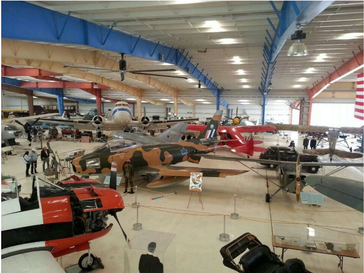
Photos of the War Eagles Air Museum at the Dona Ana County International Jetport.