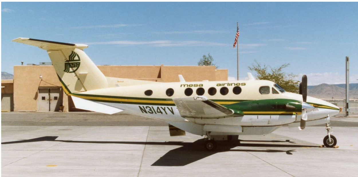
Mesa Beechcraft 1300 replaced the Beech 99's and were flown from 1988 through 1991.