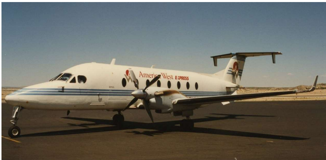
Mesa Beech 1900D at the Farmington Airport in the livery of America West Express

During the 1990's Mesa acquired many other carriers and created some new carriers of its own. All would be managed under a holding company called "Mesa Air Group". In 1995 the "Mesa Airlines" subdivision was designated as "Mountain West Airlines" but reverted back to the "Mesa Airlines" name the following year. One of the carriers acquired was Air Midwest, Mesa's former competitor, and by the start of 2001 Mesa transferred all flights operating with Beech 1900D's to fly under the Air Midwest certificate however they were still known as Mesa Airlines in Albuquerque and America West Express in Phoenix. In the years to come, Mesa's (Air Midwest's) independent flights and routes at Albuquerque continued to be dropped until the operation was completely dissolved with the last flight departing to