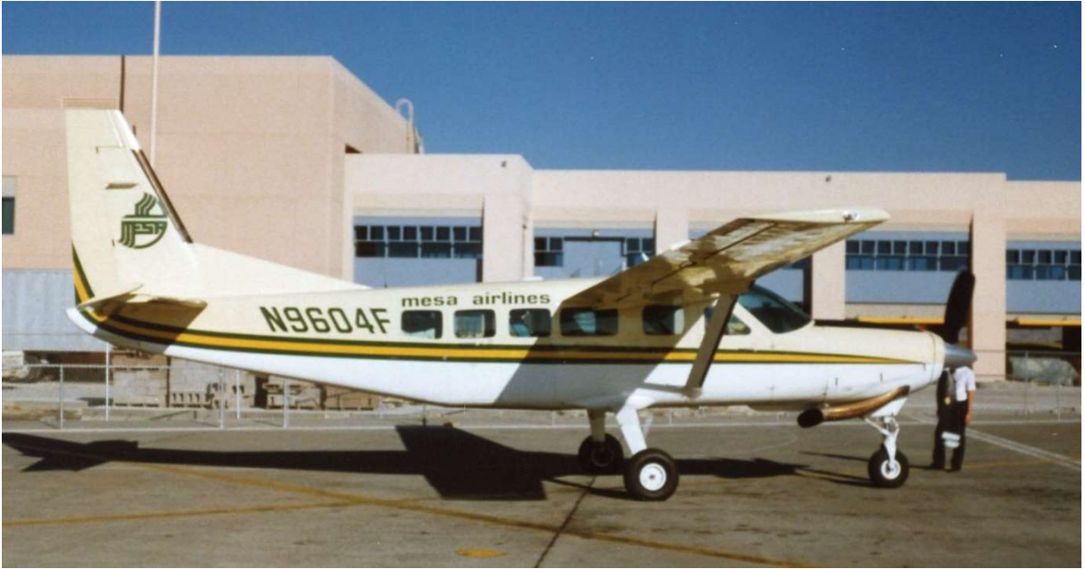
Mesa Cessna 208 Caravan was used between 1987 and 1991