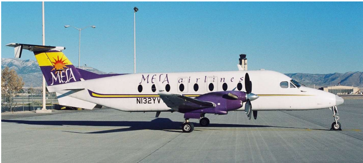
Mesa Beech 1900D in the final livery worn from 2002 while operating under the Air Midwest certificate.