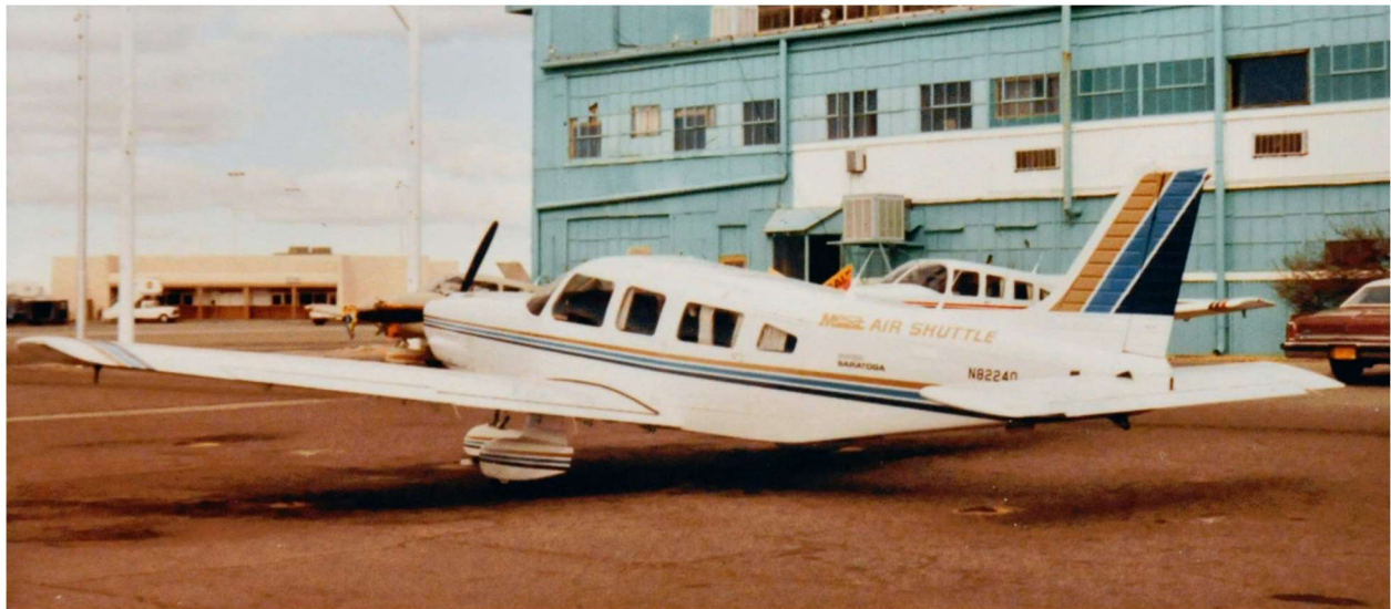
Mesa Air Shuttle Piper Saratoga at the Southwest Air Rangers hanger of the Albuquerque Sunport.