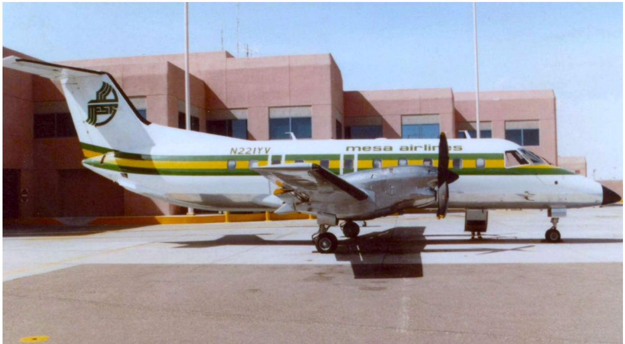
Mesa Embraer 120 Brasilia in a modified paint scheme was briefly flown between Albuquerque and Farmington in 1992.