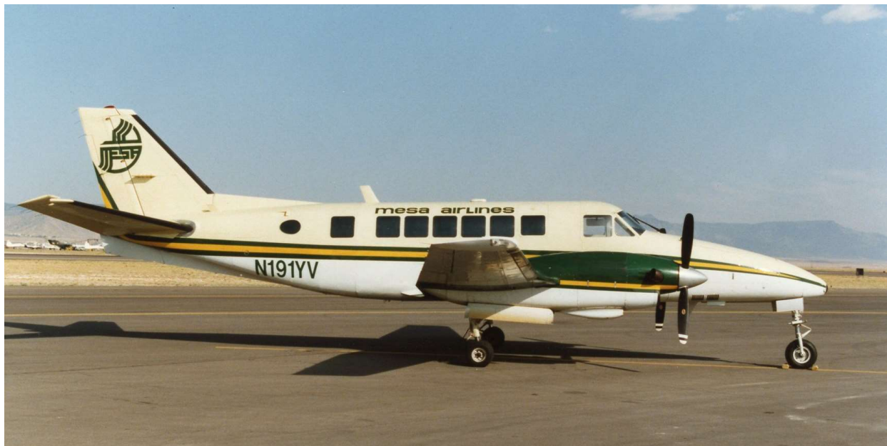
Mesa Airlines Beechcraft 99 at the Albuquerque Sunport.

Mesa struggled during its first few years competing with several other commuter airlines, especially Air Midwest, but by mid-1987 all competitors had left New Mexico and Mesa survived as the only commuter serving Albuquerque from every community in New Mexico that had airline service. Mesa introduced the Beechcraft 1900C, a larger 19-seat aircraft in late 1985 using it for new service from Albuquerque to Telluride and Denver, Colorado. In 1987 Mesa obtained a pair of 13-seat, pressurized,