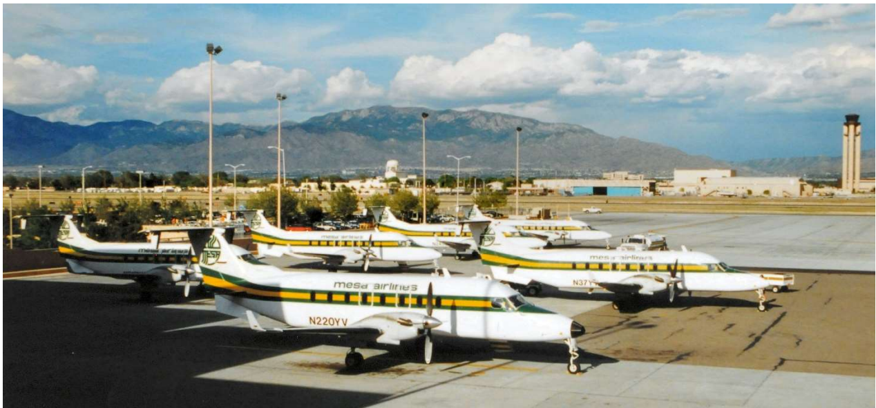
Six Mesa Beech 1900D’s at the Albuquerque Sunport commuter gate in the 1990’s.