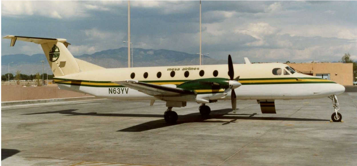
Mesa Beechcraft 1900C's were first acquired in late 1985.