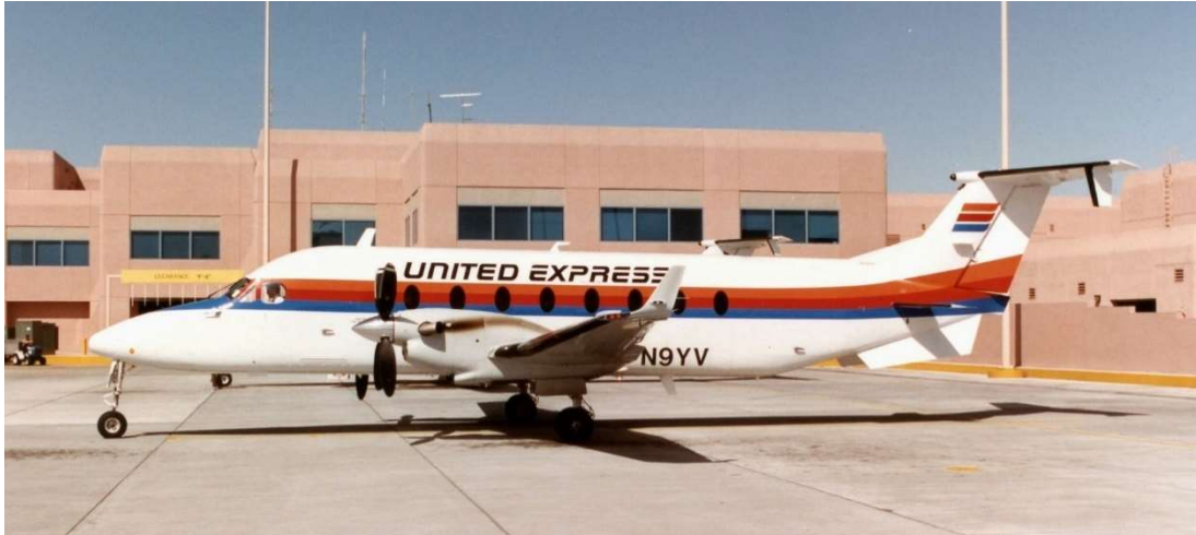
Mesa Beech 1900D in the colors of United Express.