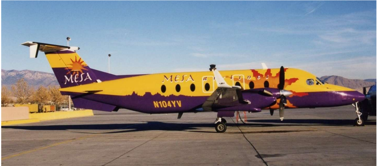
Mesa Beech 1900D in a very colorful southwest sunset livery worn from 1998 through 2002.

Farmington on December 31, 2007. The Essential Air Service routes requiring subsidy were transferred to new carriers such as Great Lakes and New Mexico Airlines. The Albuquerque to Farmington route was Mesa's first and was always the strongest with flights operating every hour for many years but by 2008 there was no service by Mesa or any other carrier. The America West Express service between Phoenix and Farmington became US Airways Express in 2007 following a merger between the two mainline carriers but ended the following year when all Beech 1900 flying was discontinued.