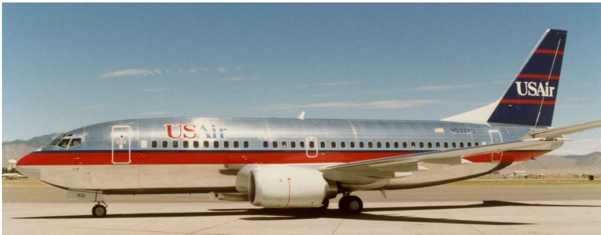
USAir Boeing 737-300 at the Albuquerque Sunport in a new livery starting in 1989.