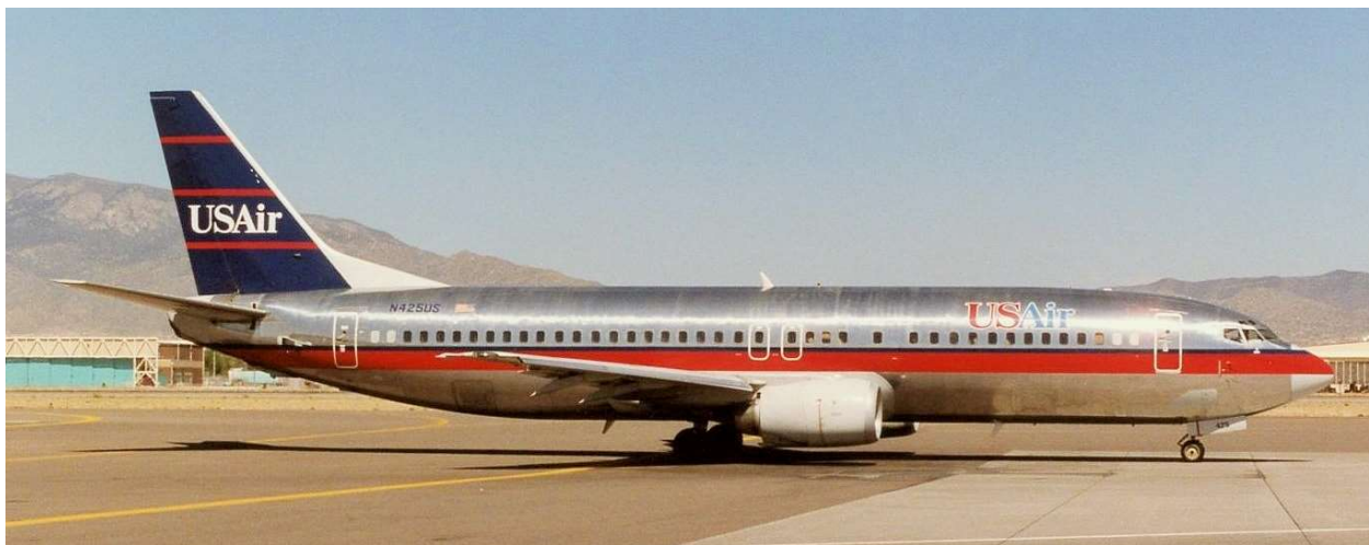
USAir Boeing 737-400 at the Albuquerque Sunport introduced in 1992.