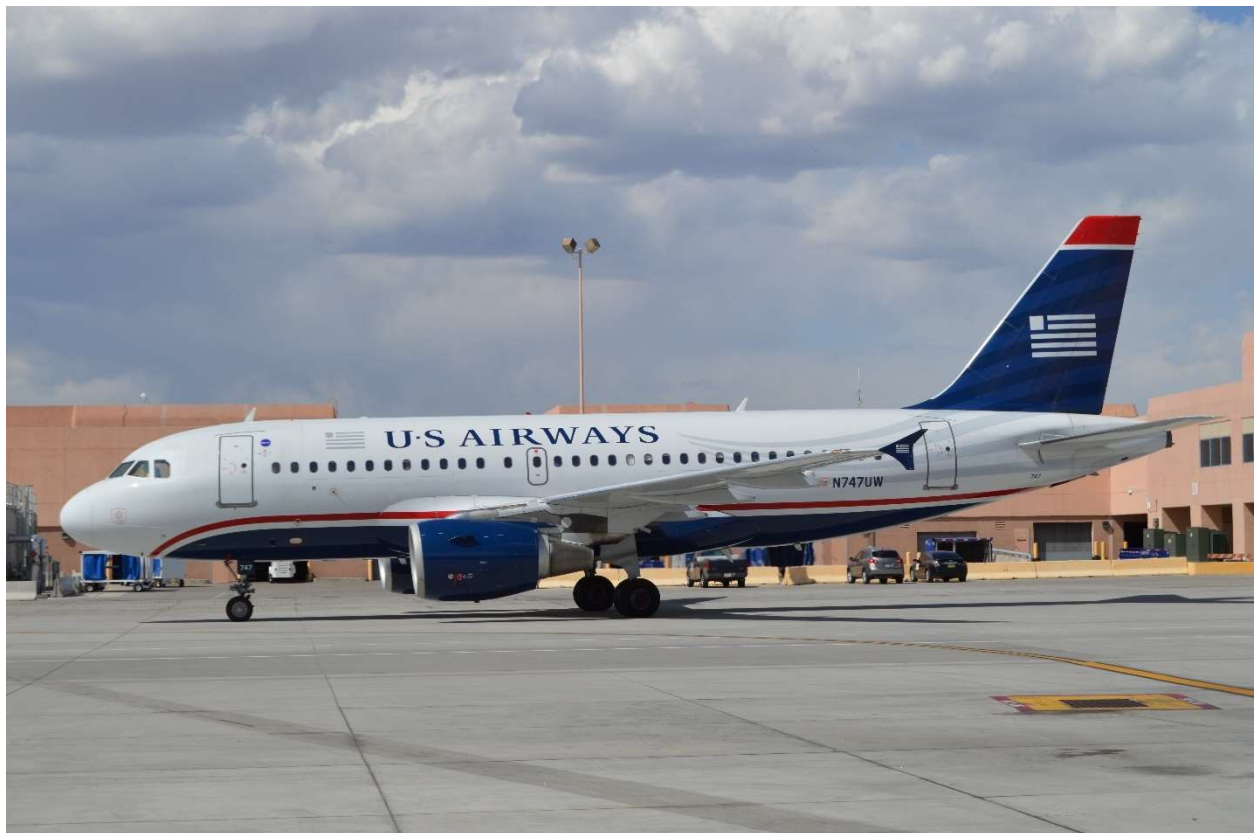
U-S Airways Airbus A319 at the Albuquerque Sunport in the final livery starting in 2007.