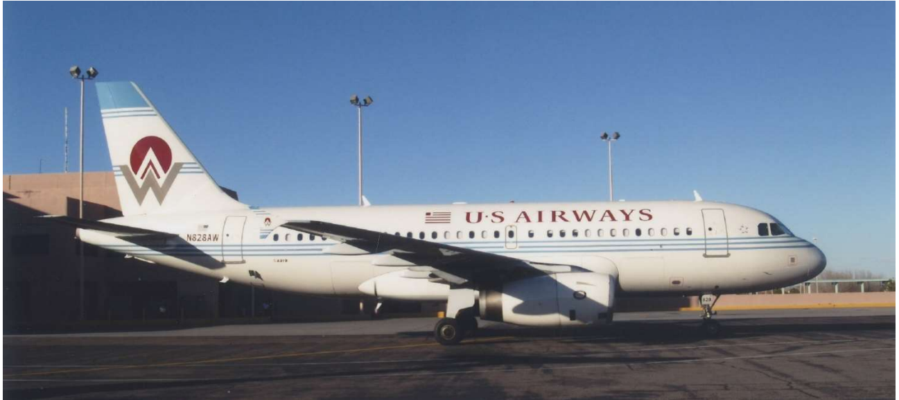
U-S Airways Airbus A319 in the former colors of America West Airlines at the Albuquerque Sunport.

U-S Airways had seen four different paint schemes on its aircraft during the two times it served Albuquerque. The carrier also had several aircraft painted with special schemes honoring sports teams and in the livery of airlines that it has merged with in the past including PSA and America West. American has carried on this tradition and maintained one aircraft in a U-S Airways paint scheme as well.