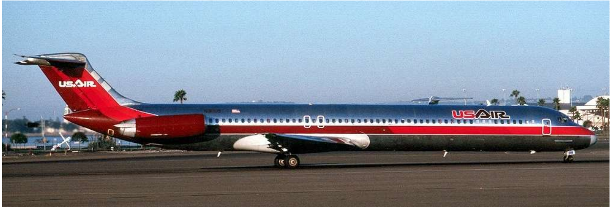
USAir McDonnell Douglas MD-80 originally flown by PSA in 1988.