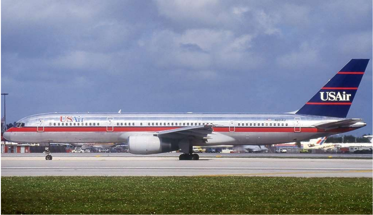
USAir Boeing 757-200 used at Albuquerque in 1995.