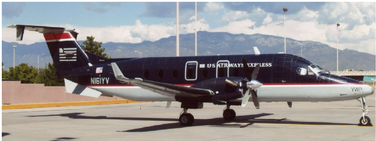
U-S Airways Express Beech 1900D used for service to Farmington, New Mexico in 2007 and 2008.