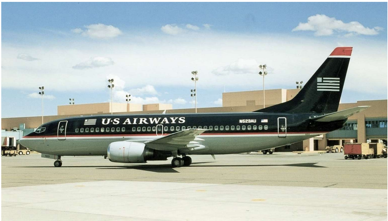
U-S Airways Boeing 737-300 at the Albuquerque Sunport reflecting the name change and a new livery in 1997.