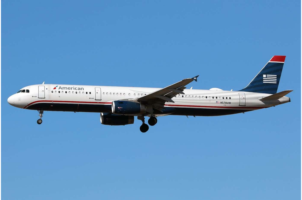
American Airlines Airbus A321 retaining the colors of U-S Airways.

More detail on PSA, America West, and American Airlines, as well as the U-S Airways Express operations by Mesa, Air Midwest, and SkyWest Airlines, has been written in separate links for each of these carriers.