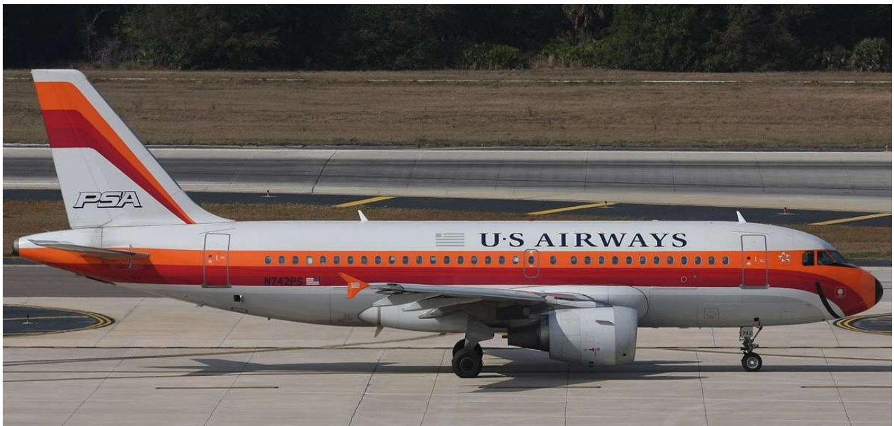
U-S Airways Airbus A319 in the former colors of PSA.