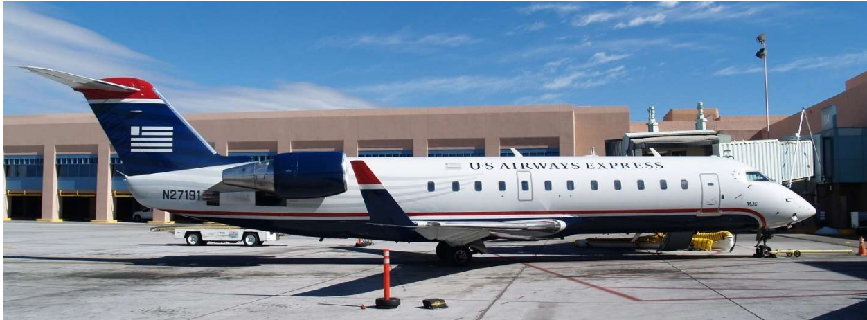
U-S Airways Express Canadair CRJ-200 at the Albuquerque Sunport. Both Mesa and SkyWest Airlines flew this aircraft type.