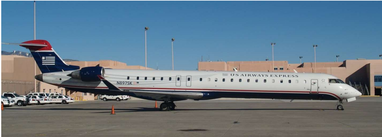
U-S Airways Express Canadair CRJ-900 at the Albuquerque Sunport. Both Mesa and SkyWest Airlines also flew this aircraft type.