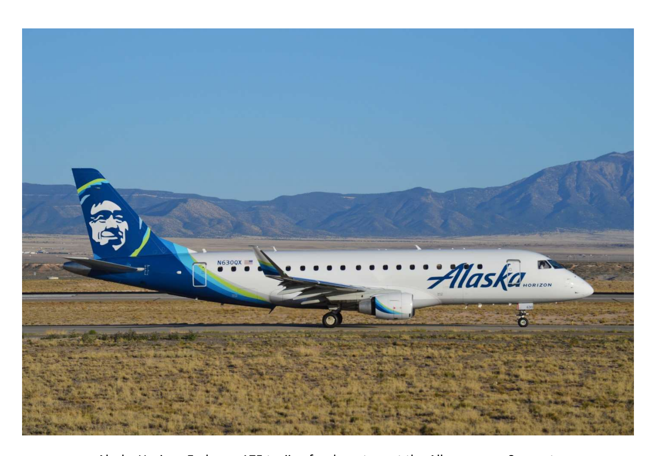
Alaska Horizon Embraer-175 taxiing for departure at the Albuquerque Sunport.

In the fall of 2017 Alaska's partner carrier, Horizon Air, began new service from Albuquerque to Portland, Oregon, Orange County, San Francisco, and San Diego, California. One daily flight to each airport was operated using new 76-seat Embraer-175 regional jets. Horizon also began one flight to Seattle complementing the Alaska mainline service but that flight was replaced with a second Alaska mainline jet in the spring of 2019. The flight to Orange County was discontinued in early 2019. In the spring of 2018, SkyWest Airlines, a second feeder carrier for Alaska, took over the flight to San Francisco that Horizon had started eight months prior and by March 10, 2019, SkyWest had taken over the flights to Portland and San Diego previously operated by Horizon. SkyWest also uses Embraer-175 regional jets, the same as Horizon. The San Diego and San Francisco flights were both discontinued in late 2019 and the Portland flight operation was then alternated between Horizon and SkyWest. A complete overview on Horizon Air and SkyWest can be found in the Commercial and Regional Airlines section.