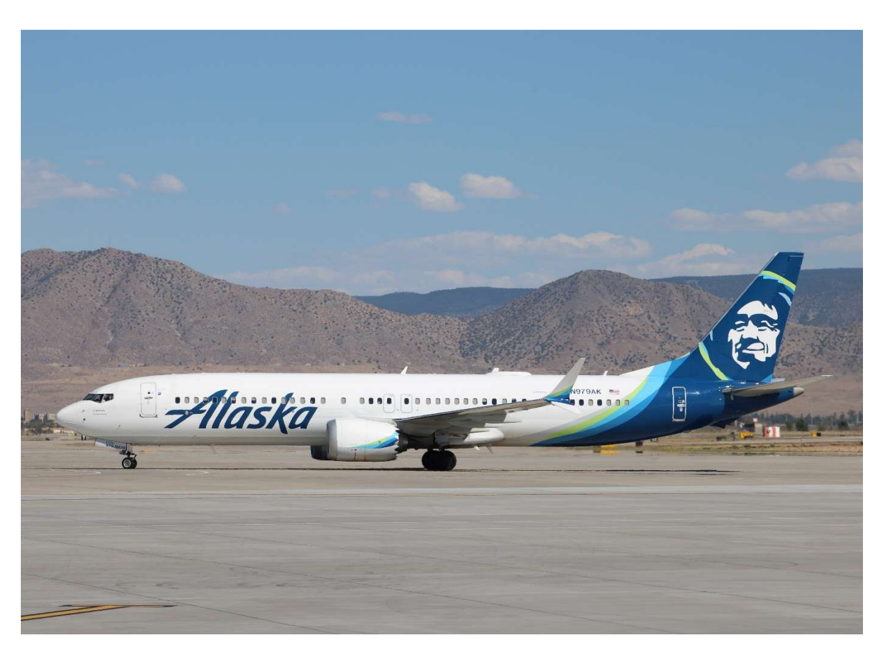
Alaska Boeing 737-9 MAX at Albuquerque in 2023.