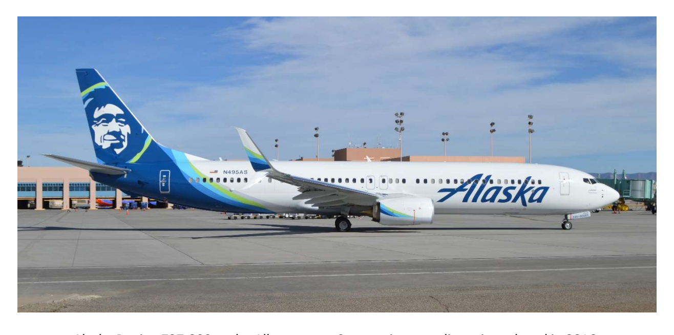
Alaska Boeing 737-900 at the Albuquerque Sunport in a new livery introduced in 2016.