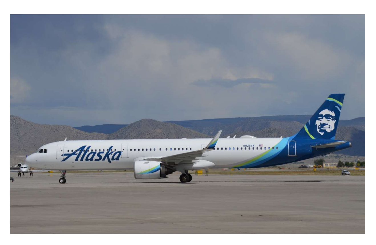
Alaska Airbus A321neo arriving in Albuquerque in 2019.