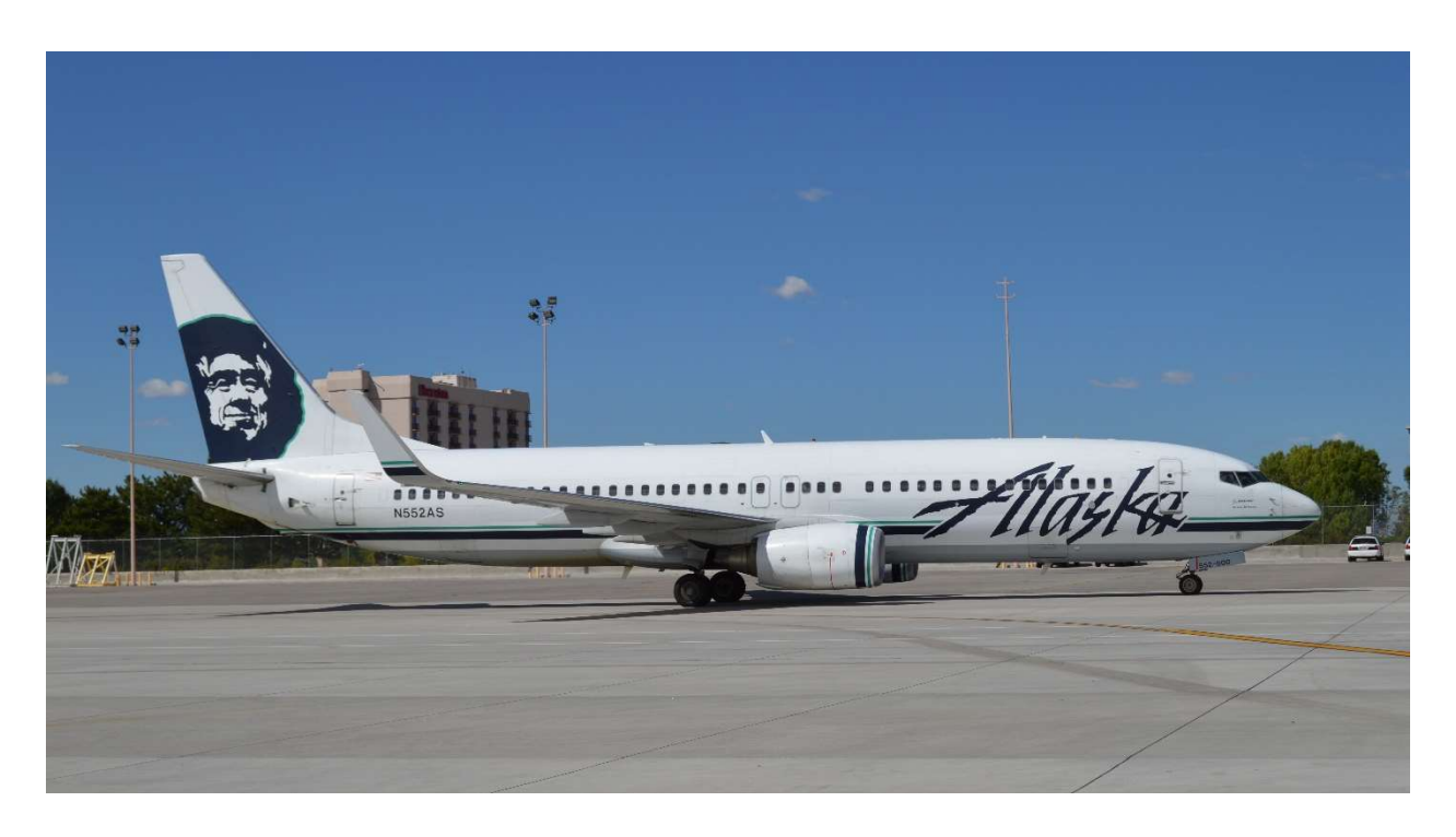
Alaska Boeing 737-800 on its maiden arrival flight into Albuquerque on September 18, 2014.