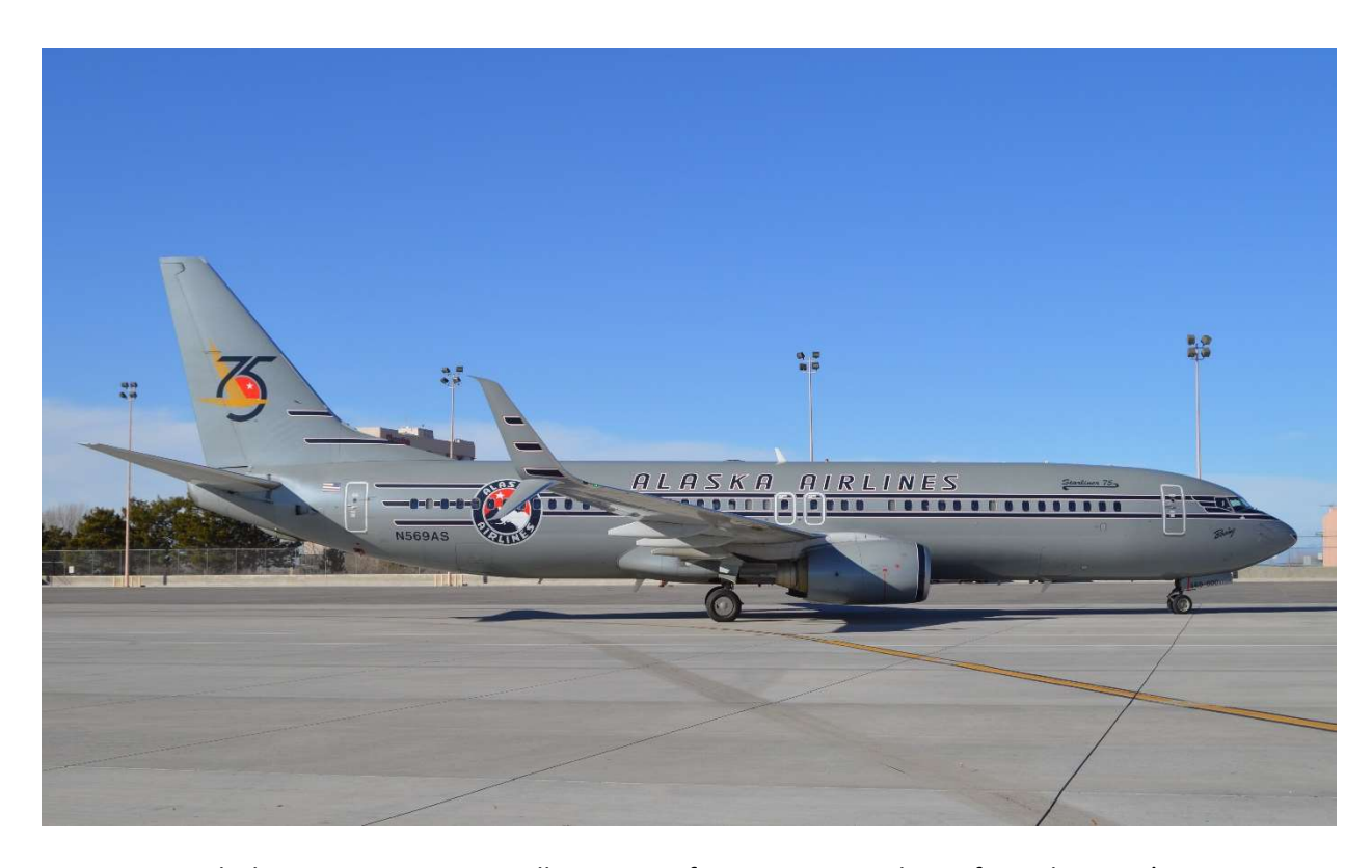
Alaska Boeing 737-800 at Albuquerque featuring a retro livery from the 1940's.