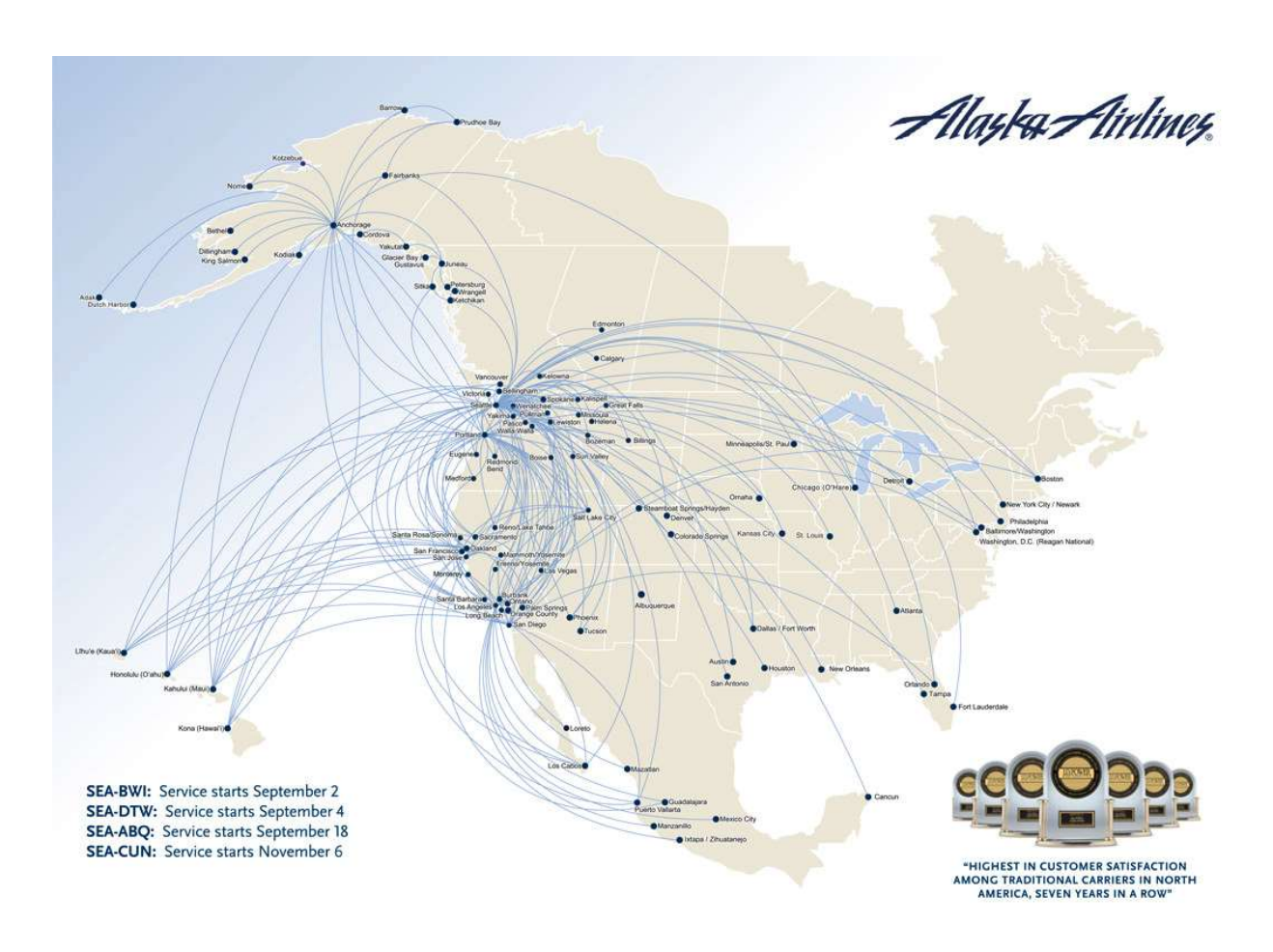
Alaska Airlines route map from September 2014.