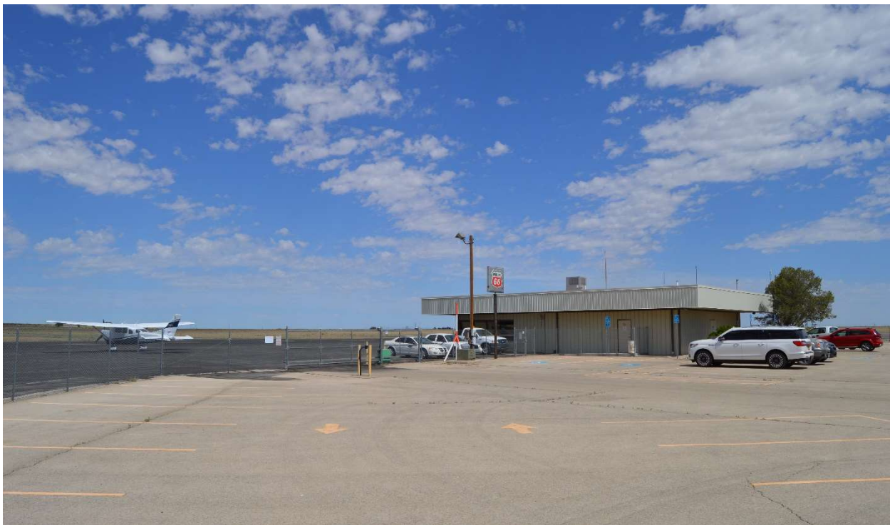
The terminal building at the Artesia Municipal Airport.

The Artesia Municipal Airport is now a general aviation civil airfield with two runways located three miles west of Artesia, New Mexico. It was established in 1943 by the United States Army Air Forces as a contract glider training field to train glider pilot students during World War II. The field was deactivated in the fall of 1944, declared surplus, and turned over to the Army Corps of Engineers. It was later discharged to the War Assets Administration and eventually converted into a civil use airport. The Artesia airport saw commuter airline service by several commuter air carriers from 1963 through 1978. Scheduled flights were provided to Albuquerque, El Paso, Amarillo, Lubbock and Midland/Odessa. A third runway had initially been constructed but was deactivated in the late 1980's.