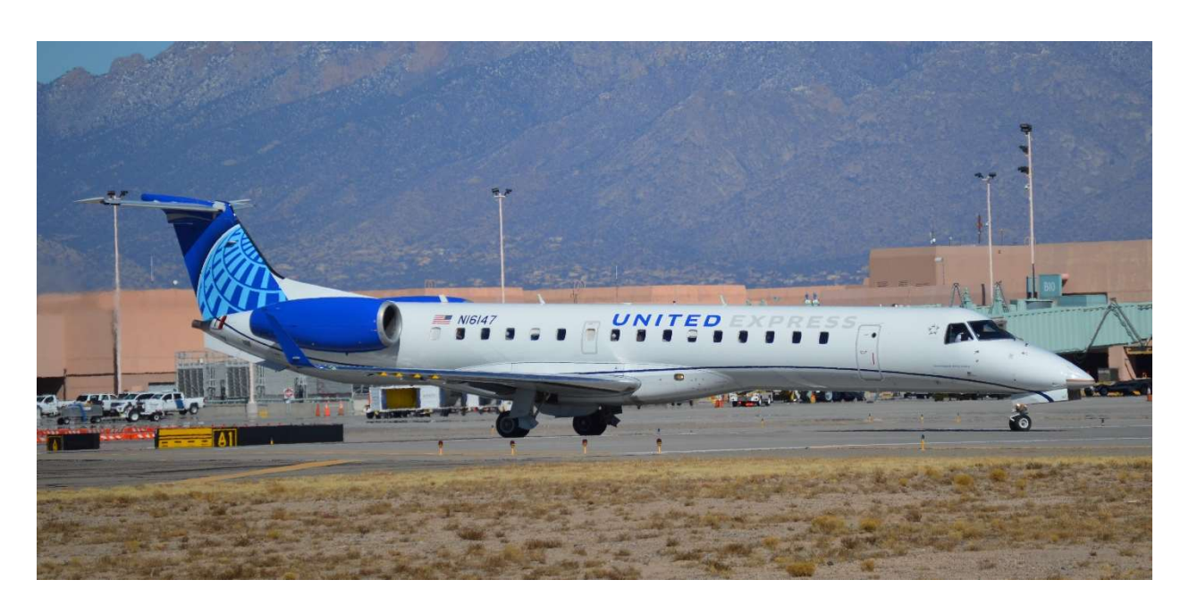
United Express Embraer-145 operated by CommuteAir at the Albuquerque International Sunport.